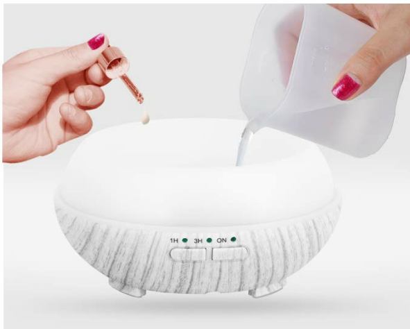
3. Add water and add drops of essential oil (oil not included)