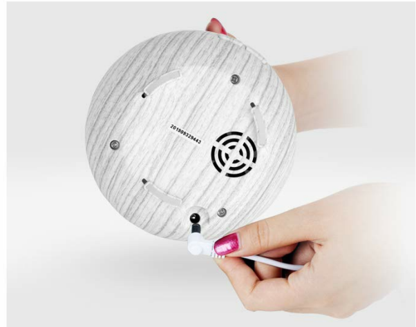
2. Insert the power cable