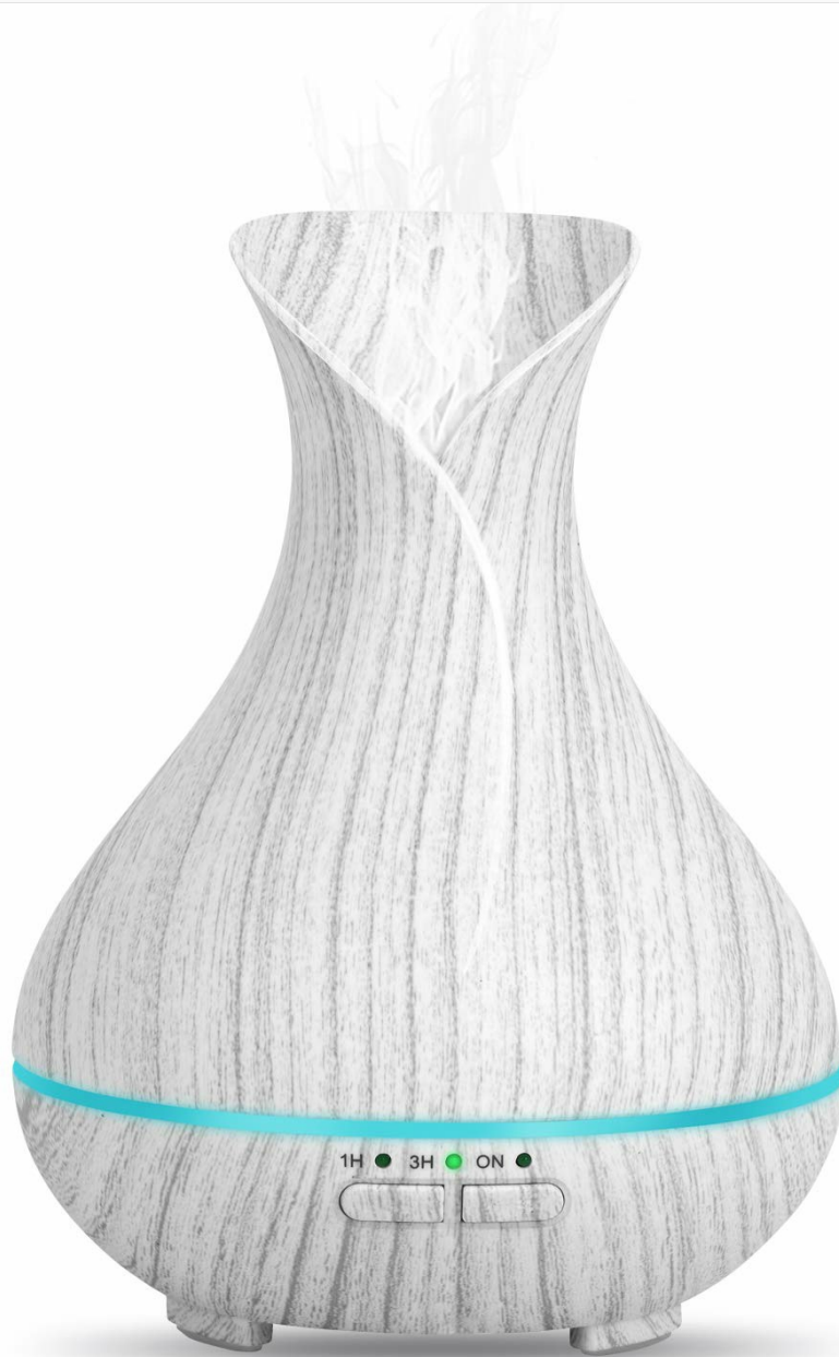
Image: OliveTech Mini Essential Oil Diffuser, showcasing its design and mist output.

The OliveTech Mini Essential Oil Diffuser features a unique flower vase design with a light wood grain finish. It includes two control buttons for mist and light functions.