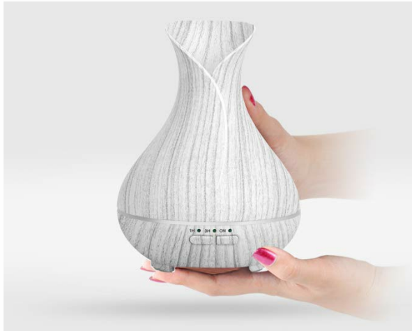
1. Lift up the cover