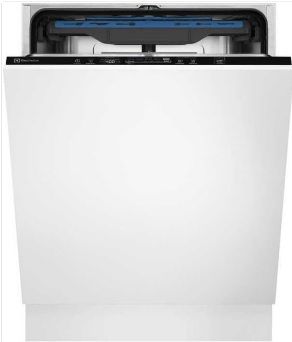
Figure 1: Front view of the Electrolux EEM48300L built-in dishwasher. This image shows the appliance's sleek white exterior and integrated control panel at the top.