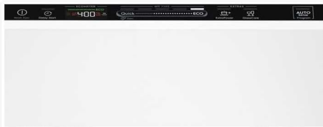
Figure 3: Close-up view of the Electrolux EEM48300L dishwasher control panel. It shows the digital display, program selection buttons, and indicators for various functions like Delay Start, Quick, Eco, ExtraPower, GlassCare, and AutoSense Program.