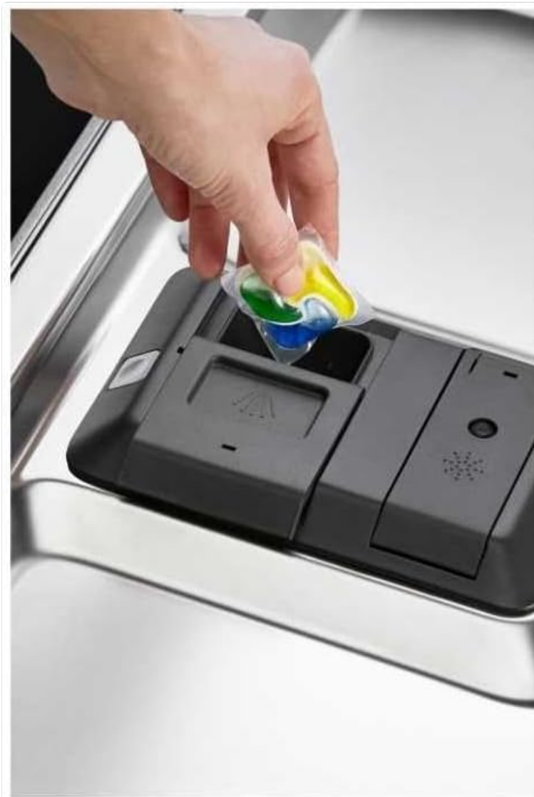
Figure 5: A hand placing a multi-chamber detergent pod into the dishwasher's detergent dispenser. This illustrates the correct way to add detergent for a wash cycle.

Open the detergent dispenser and add the recommended amount of dishwasher detergent. If using a tablet, place it in the main detergent compartment. Fill the rinse aid dispenser with rinse aid to ensure streak-free drying.