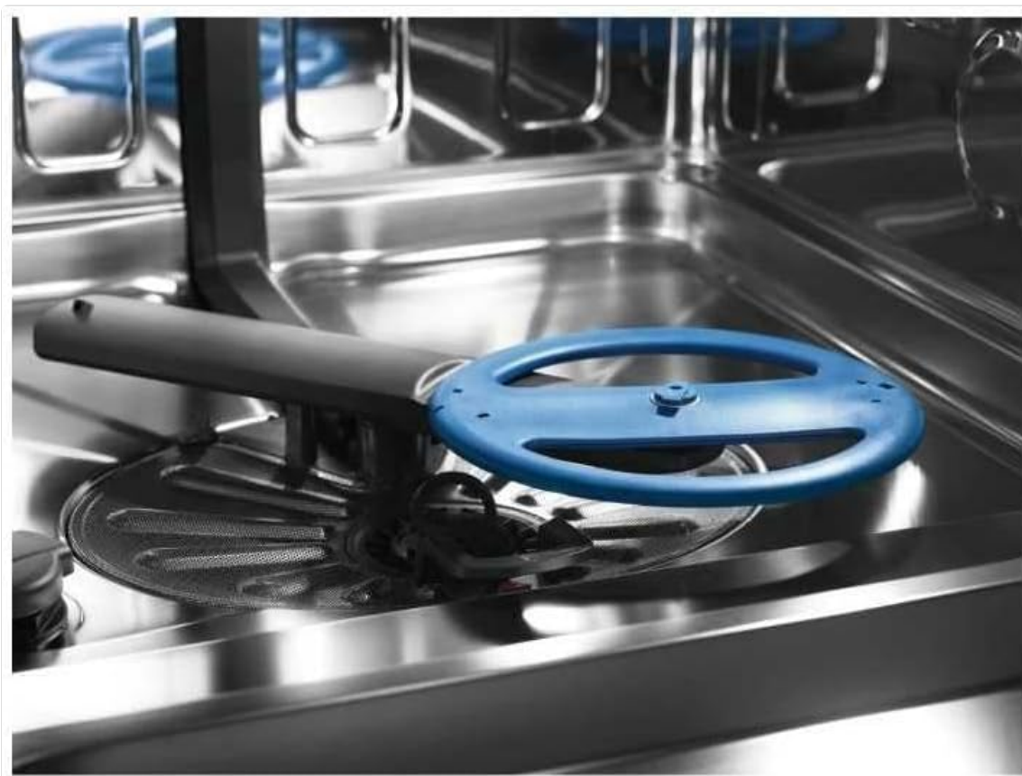
Figure 4: Interior view of the dishwasher, highlighting the lower basket, the rotating spray arm, and the filter system at the bottom. This area is crucial for effective cleaning and requires regular maintenance.

Proper loading ensures optimal cleaning results and prevents damage to dishes. Scrape off large food particles before loading. Place larger items in the lower basket and smaller, delicate items in the upper basket. Ensure spray arms can rotate freely.