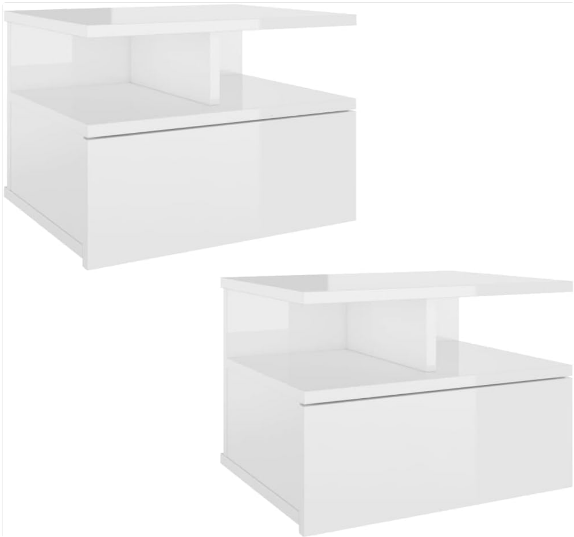
Image 1.1: Two vidaXL wall-mounted nightstands. This image displays two complete vidaXL wall-mounted nightstands, each featuring a drawer and an open top compartment, presented in a white glossy finish.