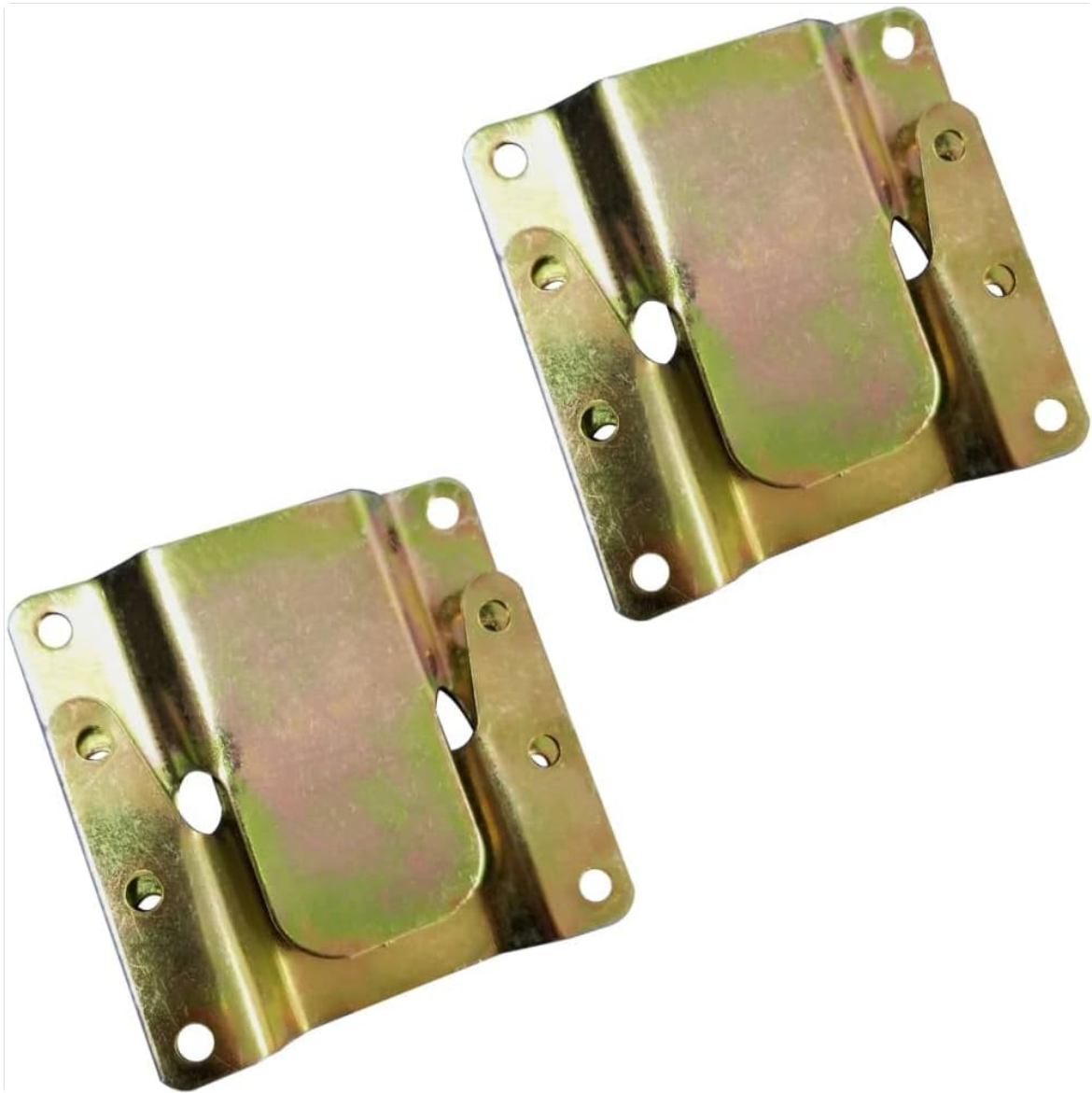
Image 3.1: Metal mounting brackets. This image shows the metal mounting brackets used for securely attaching the nightstand to the wall.