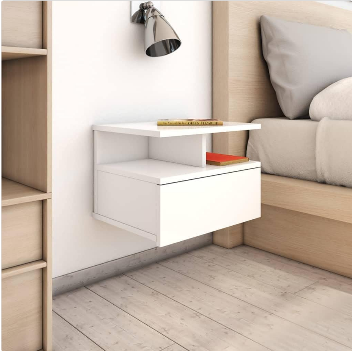
Image 4.1: Installed nightstand. A vidaXL wall-mounted nightstand is shown installed beside a bed, demonstrating its compact design and how it integrates into a bedroom setting. A lamp is visible above it.