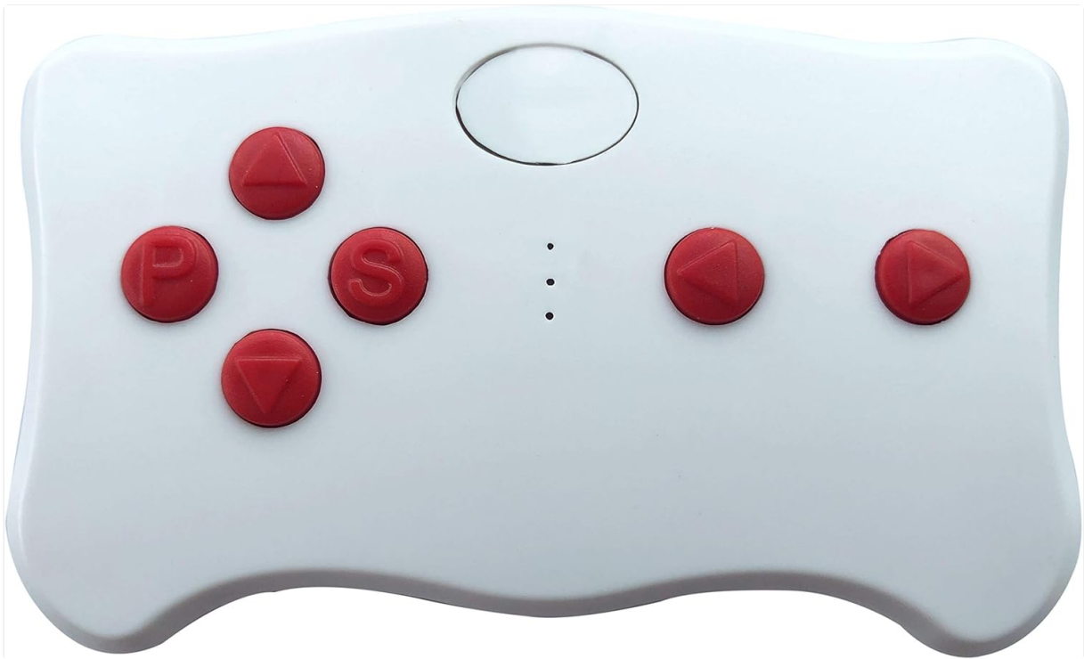
Front view of the FLHFULIHUA TX10 remote control, showing the red buttons and central pairing button.