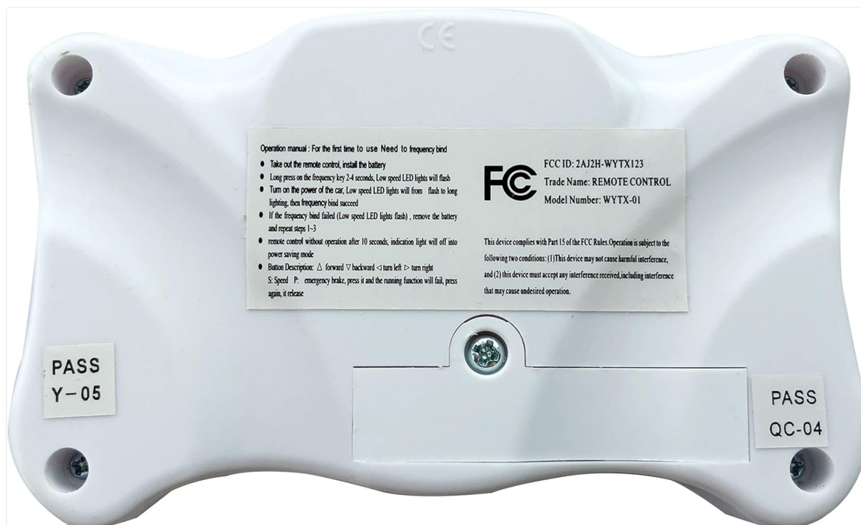
Back view of the FLHFULIHUA TX10 remote control, displaying the product label with FCC ID, trade name, and manufacturer model number.