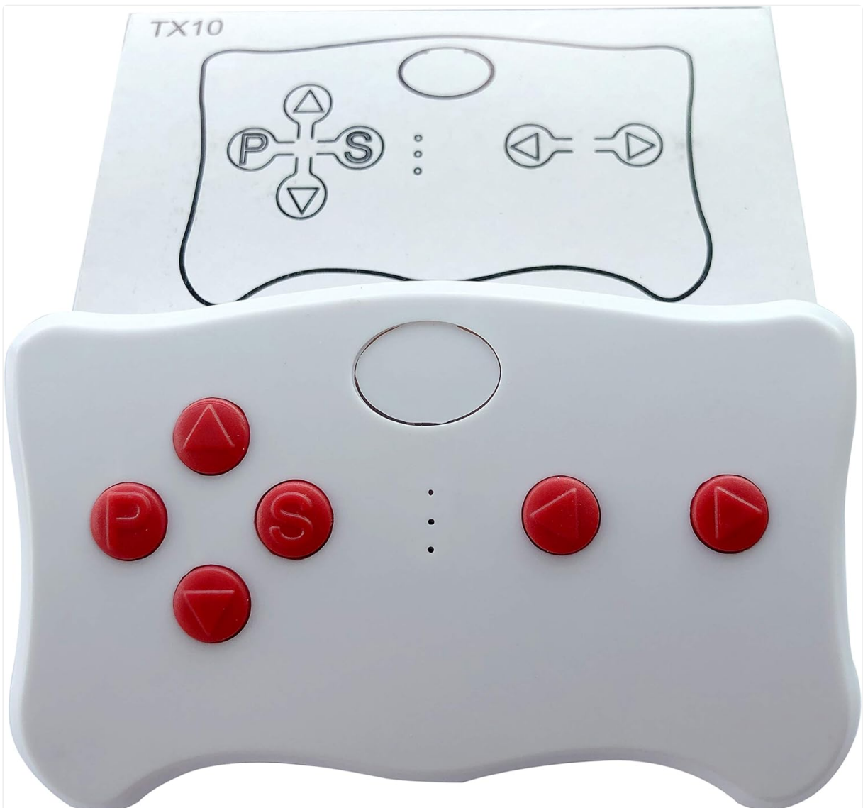
Top view of the FLHFULIHUA TX10 remote control, showing the button layout and the TX10 model designation.