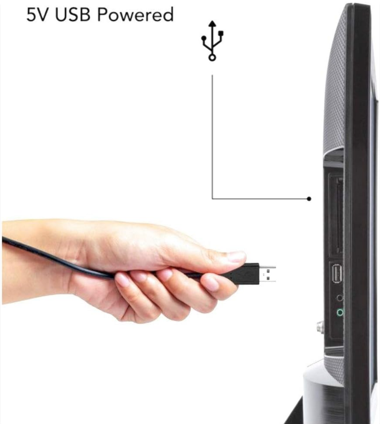
Image 4.1: A hand connecting the USB plug of the LED strip to a television's USB port for power.