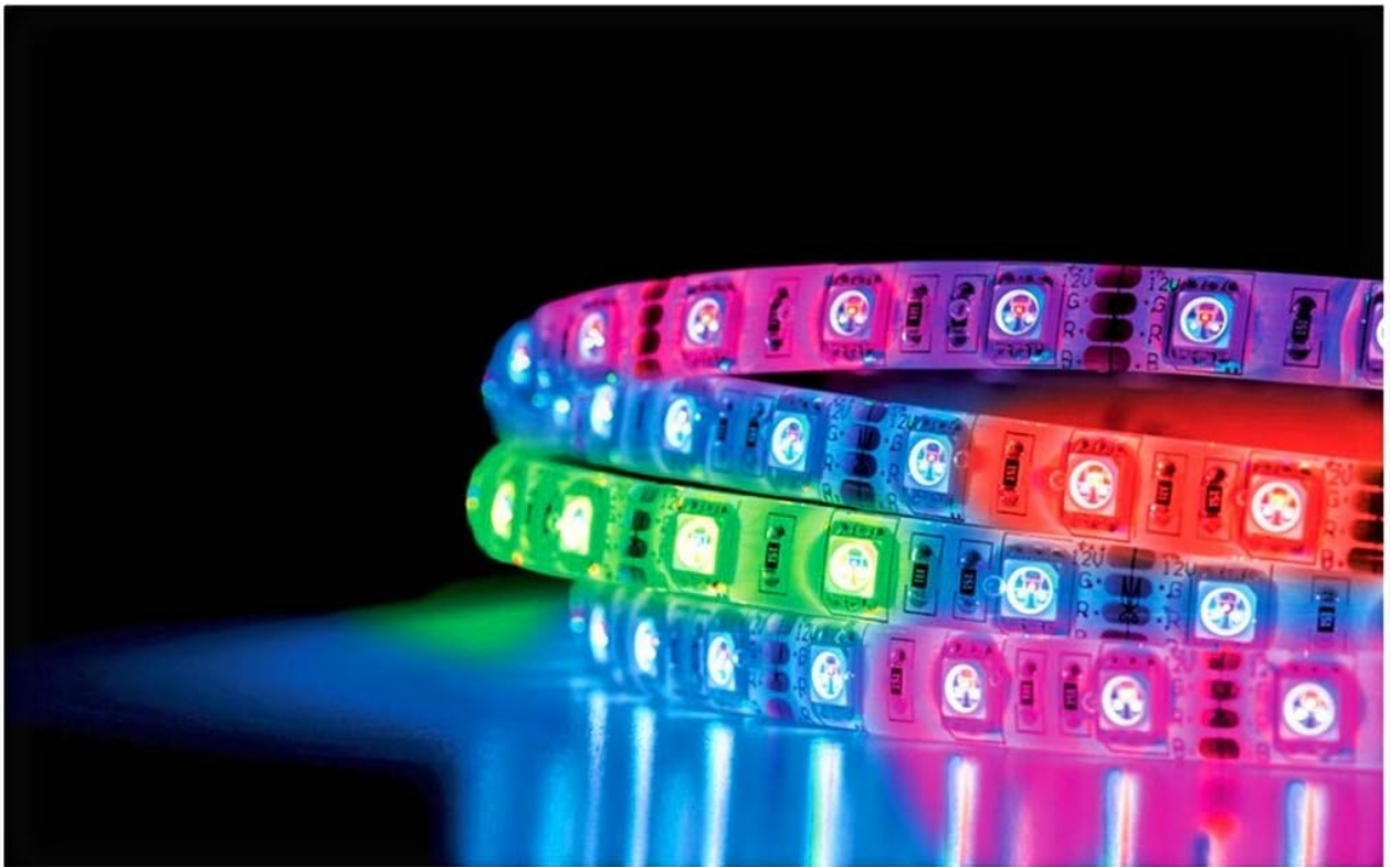
Image 1.1: The Tzumi Xtreme USB Multi Color Strip, shown coiled and illuminated in multiple colors.

Thank you for choosing the Tzumi Xtreme USB Multi Color Strip. This LED strip light kit is designed to provide vibrant accent lighting for various indoor applications. Powered conveniently via USB, it offers easy installation and customizable lighting effects to enhance your environment.