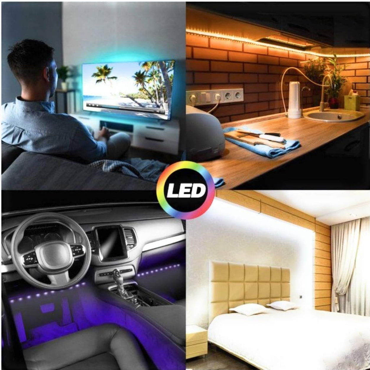
Image 4.2: Examples of LED strip light applications, including behind a TV, under kitchen cabinets, in a car interior, and as bedroom accent lighting.