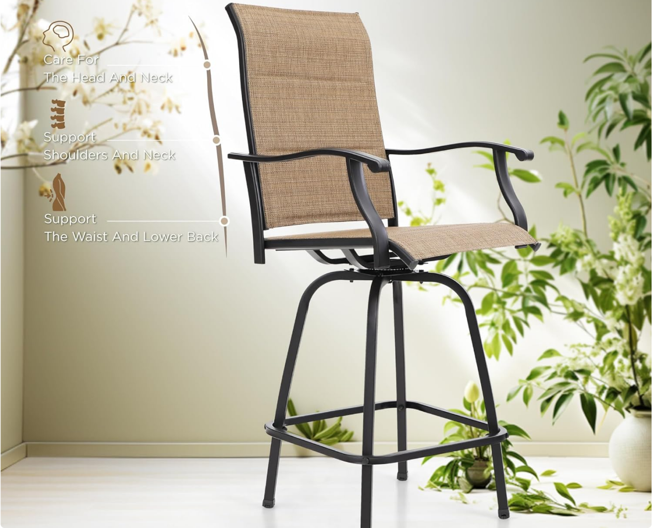
Image 5: High-Density Padded Textilene fabric for comfort and durability.

Ergonomic Back & Seat Smooth Armrest With Footrest