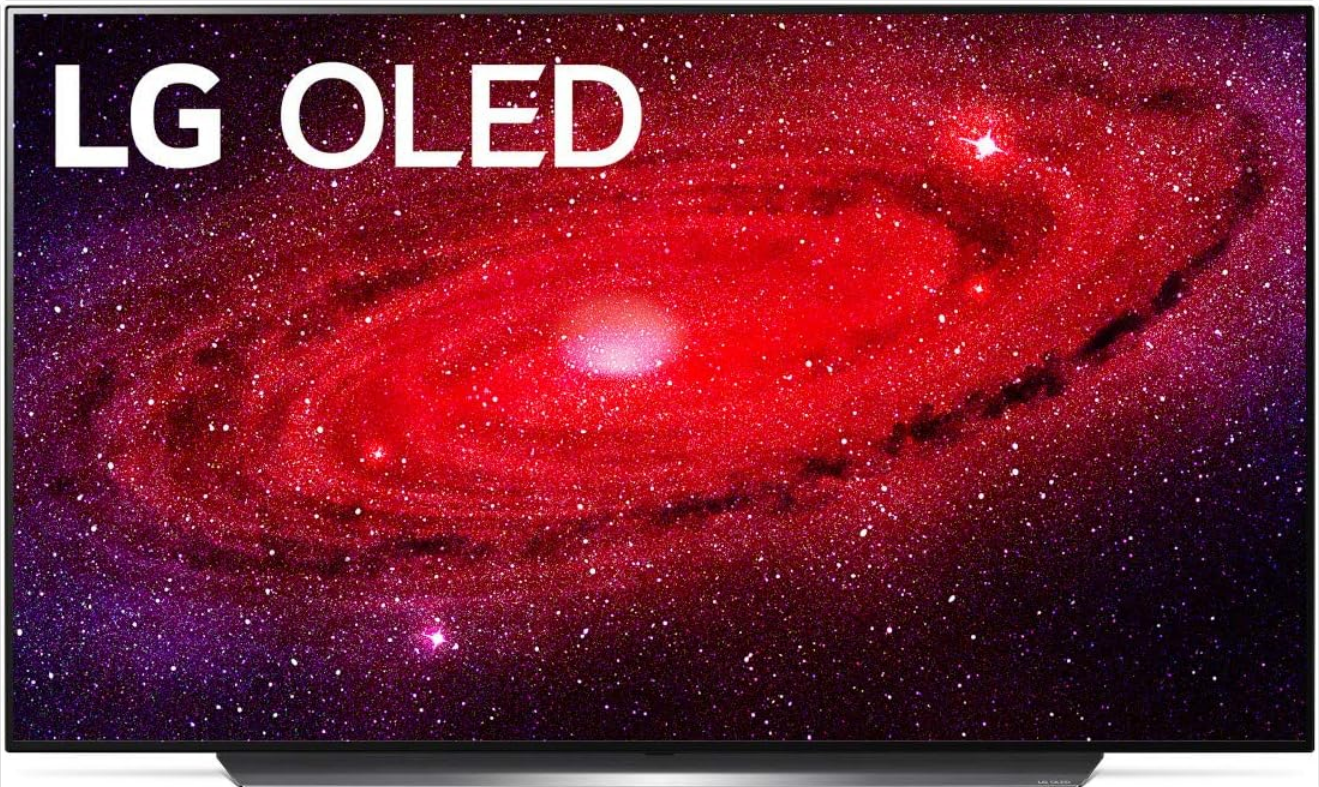
Figure 1: Front view of the LG OLED55CXPUA TV displaying a vibrant image.

The LG OLED55CXPUA is a 55-inch 4K Smart OLED TV designed to deliver exceptional picture quality and smart features. This manual provides essential information for setting up, operating, and maintaining your television, ensuring optimal performance and longevity.