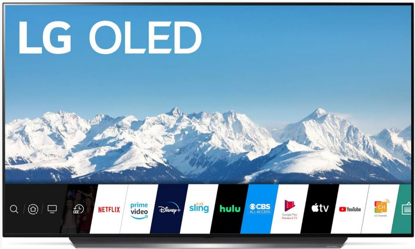
Figure 5: The LG webOS Smart TV interface, showcasing various streaming app icons.