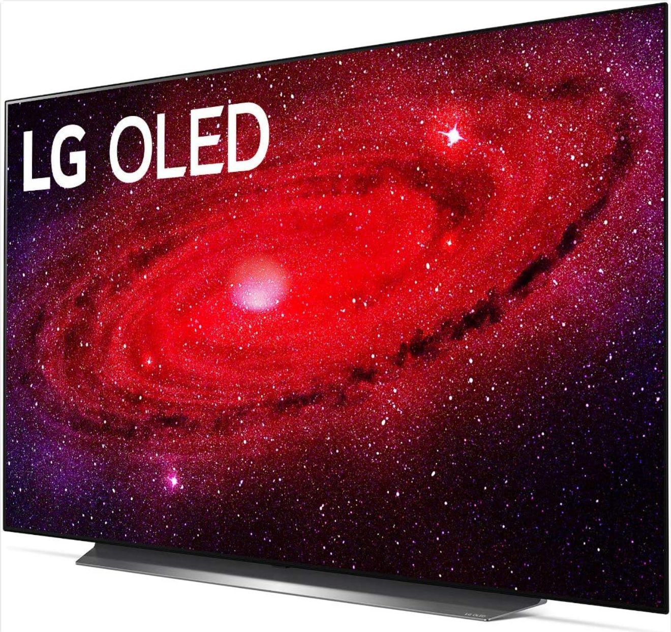
Figure 2: Side profile of the LG OLED55CXPUA, highlighting its ultra-thin OLED panel and integrated stand.

The LG OLED55CXPUA features a wide, low-slung stand designed for stability and integrated audio projection. The stand is designed to project audio towards the viewer, enhancing the sound experience. While assembly may require careful attention, once in place, it provides a stable base for the television.