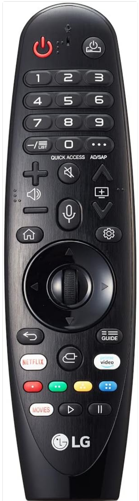
Figure 4: The LG Magic Remote, featuring a voice button and motion control capabilities.

The webOS Home Dashboard allows users to access smart home devices, functioning as a central hub for your connected home. The system is designed for straightforward content access: simply find what you want to watch and start playing.