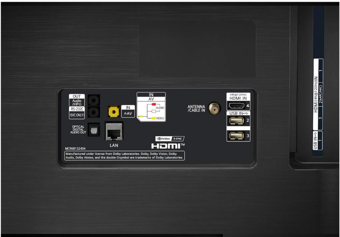
Figure 3: Detailed views of the rear and side input/output ports on the LG OLED55CXP UA.