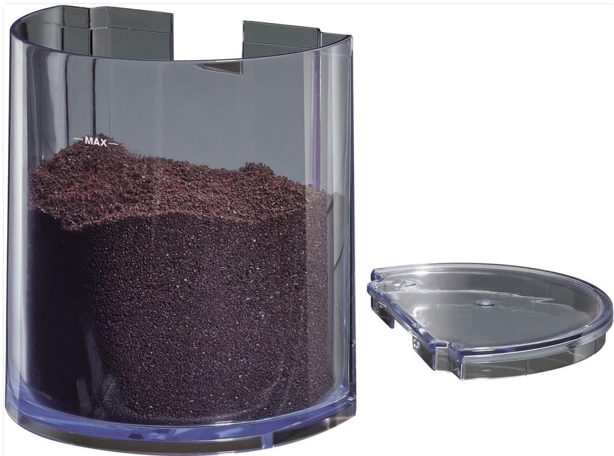
Image: The transparent grounds container, partially filled with ground coffee, shown next to its clear lid.