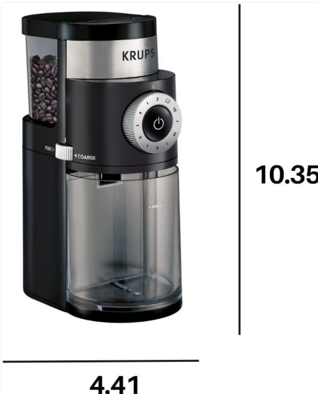
Image: A diagram showing the approximate dimensions of the KRUPS GX550850 coffee grinder, with a height of 10.35 inches and a width of 4.41 inches.