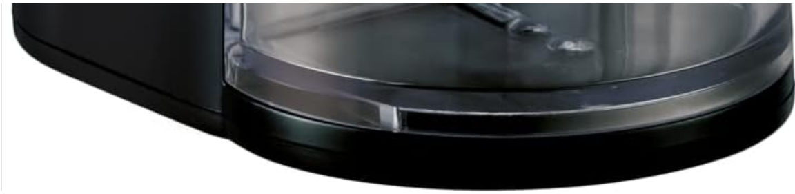
Image: KRUPS GX550850 Precision Burr Coffee Grinder showing its main components including the 8 oz. coffee bean container, flat disc burrs, 12 grind settings, 2-12 cup selector, ON/OFF button, and large capacity ground coffee container.