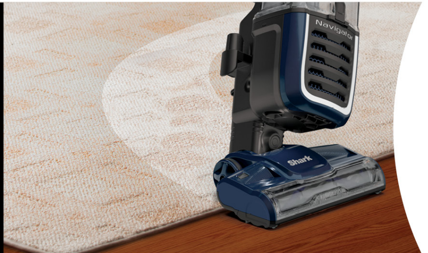
Image: A close-up view of the Shark Navigator vacuum's base demonstrating its swivel steering capability on a carpeted floor, allowing for easy maneuverability.

Easily maneuver your upright vacuum in and out of tight spaces, in corners, around furniture, and more.