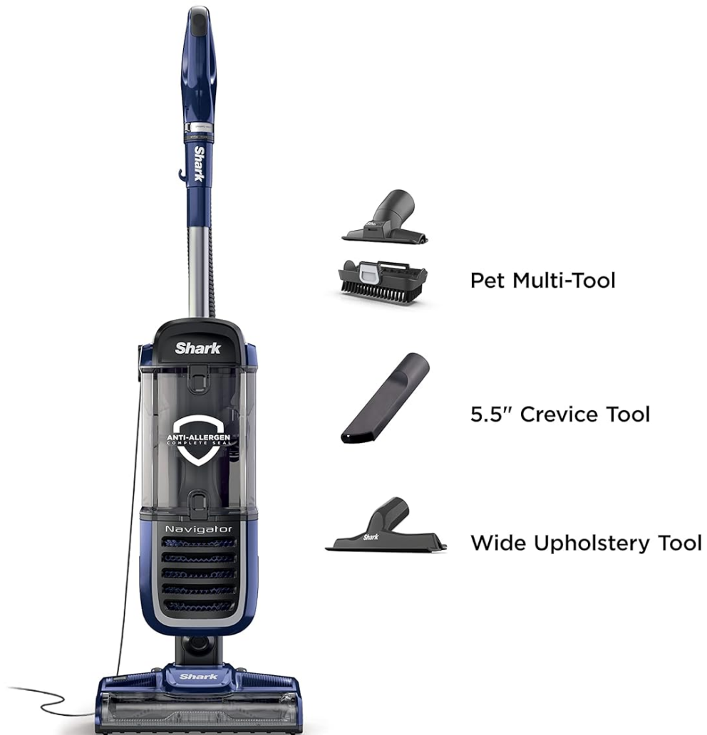
Image: A visual representation of the Shark NV151 vacuum alongside its included accessories: the Pet Multi-Tool, 5.5" Crevice Tool, and Wide Upholstery Tool.