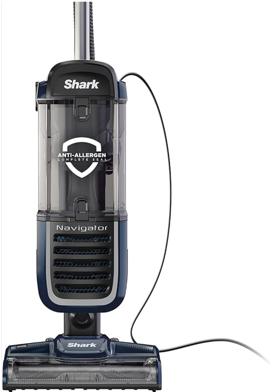
Image: Front view of the Shark NV151 Navigator Swivel Pro Complete Upright Vacuum in navy color, showcasing its sleek design and upright form factor.