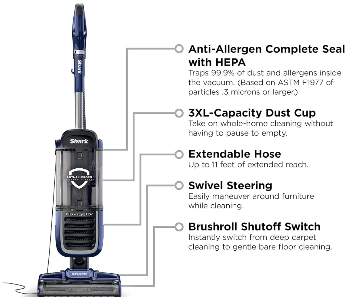
Image: A diagram illustrating the main components of the Shark Navigator vacuum, including the Anti-Allergen Complete Seal with HEPA, 3XL-Capacity Dust Cup, Extendable Hose, Swivel Steering, and Brushroll Shutoff Switch.