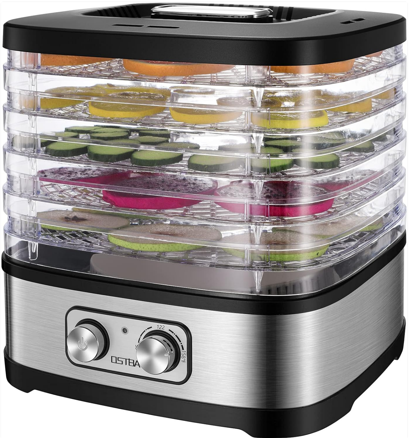
Figure 2.1: OSTBA Food Dehydrator with 5 clear trays.