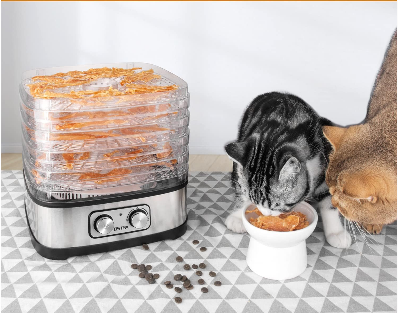
Figure 2.2: Key features including automatic shutoff, food-grade materials, ETL listing, overheat protection, and low noise operation.

Make healthy and inexpensive snacks for your cute pets