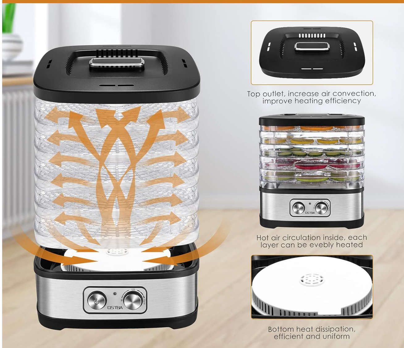
Figure 4.2: Illustration of the 360° circulation airflow for even drying.