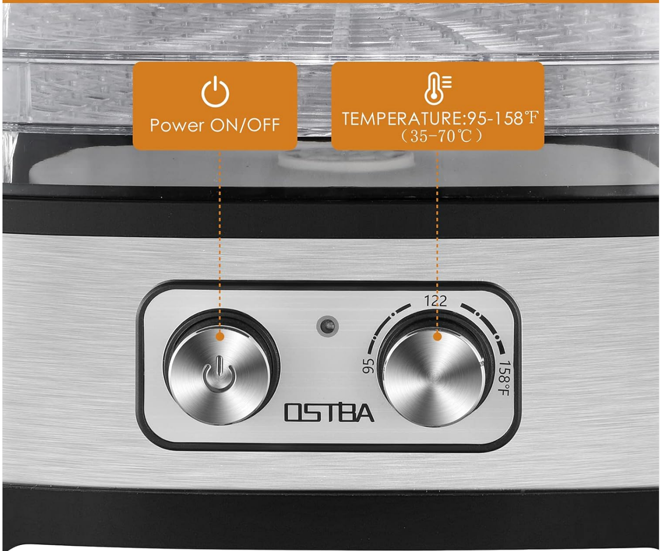
Figure 3.2: Easy-to-use knob controls for power and temperature.