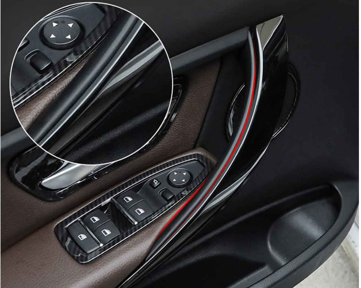
Image: Detailed view highlighting the precise and seamless fit of the installed handle cover.