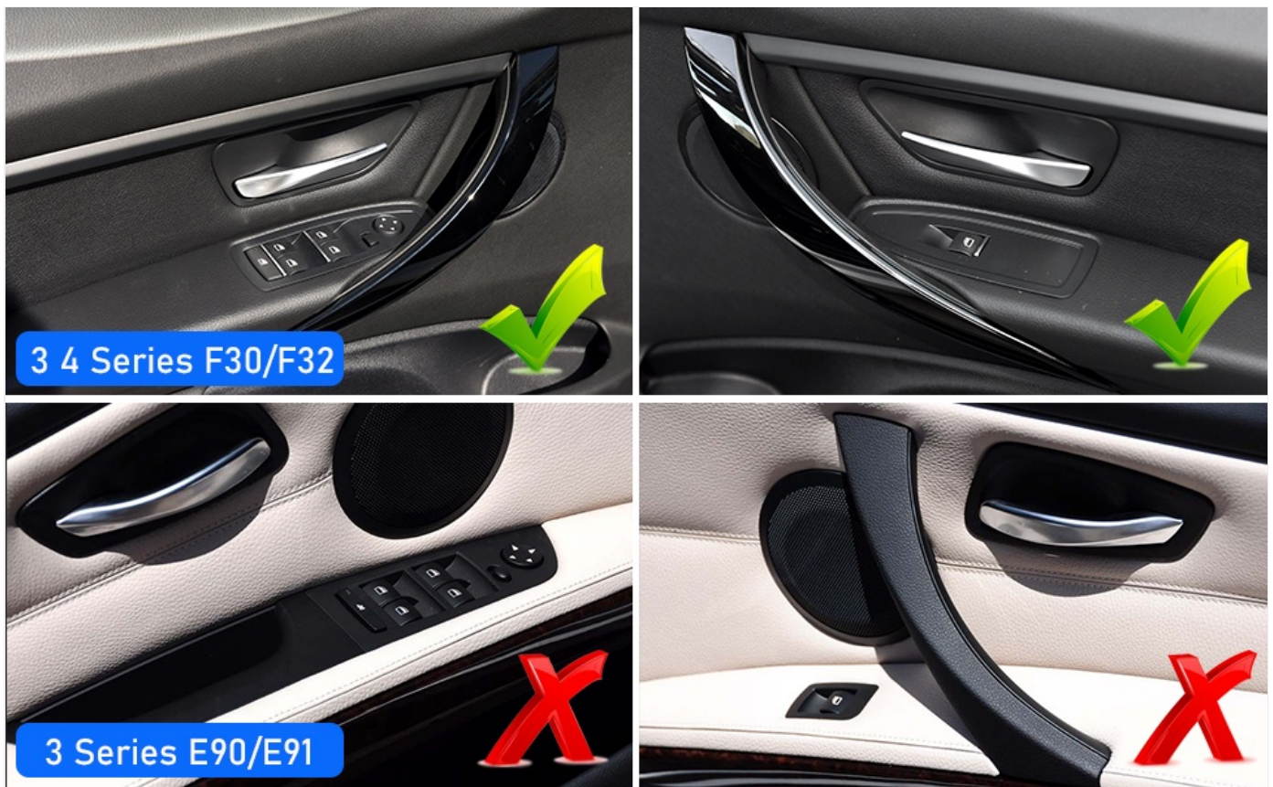
Image: Visual guide indicating compatibility with BMW 3 & 4 Series (F30/F32) and incompatibility with 3 Series E90/E91 models.