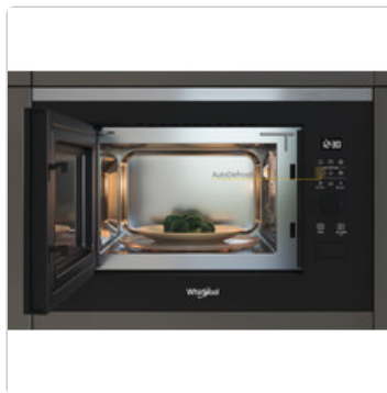
Figure 4: Interior view of the microwave oven, showing the turntable and cavity walls.

Regular cleaning and maintenance will ensure the longevity and optimal performance of your microwave oven.