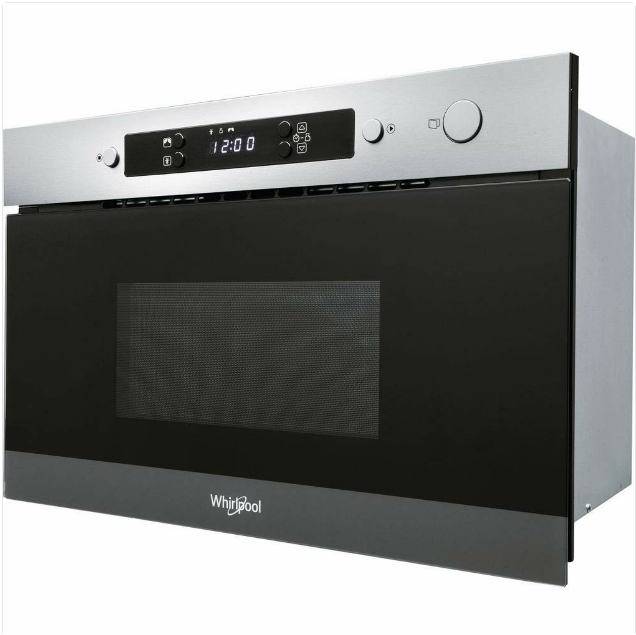
Figure 1: Whirlpool AMW 4900/IX Built-in Microwave Oven with key dimensions (Height: 38.2cm, Width: 59.5cm, Depth: 32cm).