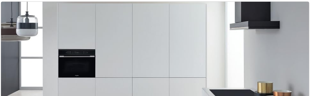
Figure 2: The Whirlpool AMW 4900/IX microwave seamlessly integrated into a modern kitchen setting.