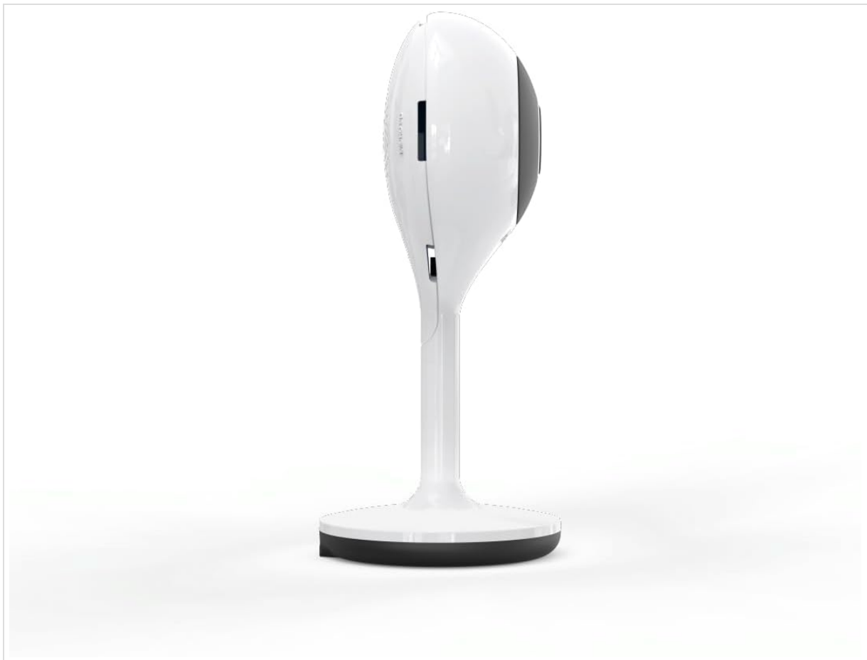
Figure 2.2: Side view of the Hama WiFi Camera. This view highlights the side profile of the camera head, revealing a MicroSD card slot and a power port for connectivity. The design is sleek and minimalist.