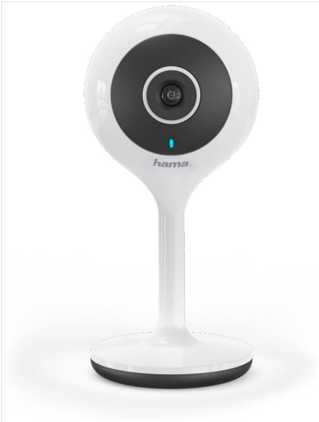
Figure 2.1: Front view of the Hama WiFi Camera. The camera features a central lens, a blue status LED below it, and the 'hama' brand logo at the base of the camera head. The camera is white with a black lens housing, mounted on a slender white stand with a round base.