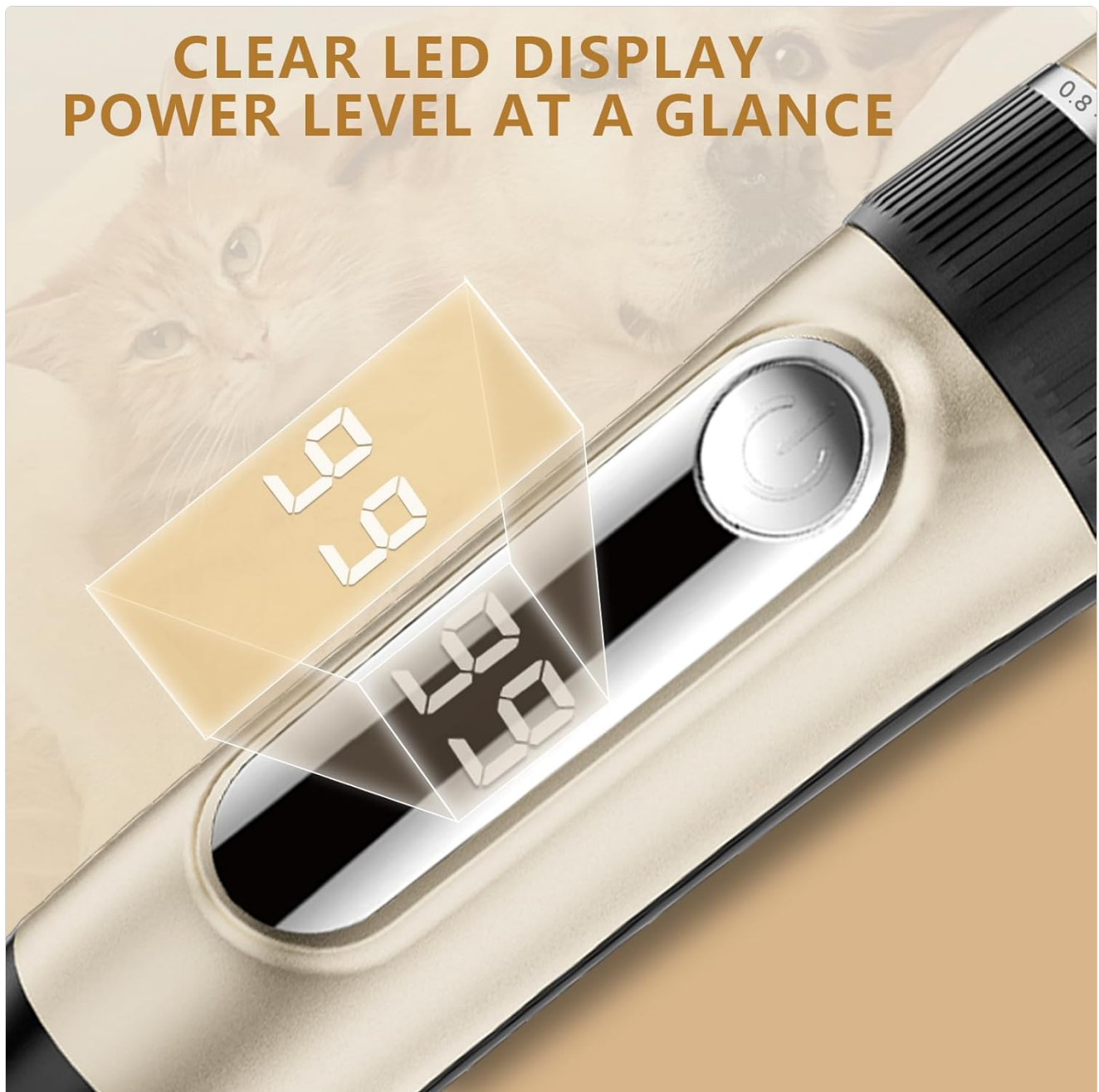
Figure 4.1: Clear LED display showing power level.