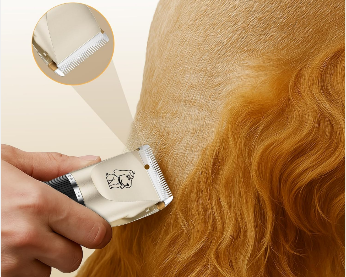
Figure 5.3: Safe and sharp ceramic blades for effective trimming.