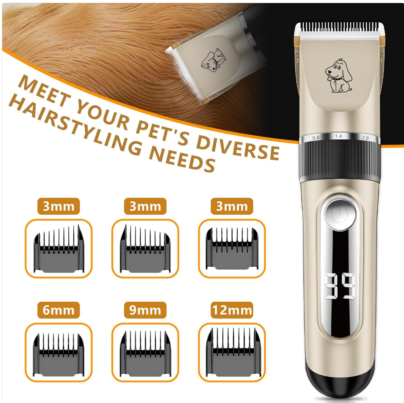
Figure 4.2: Guide combs for diverse hairstyling needs.