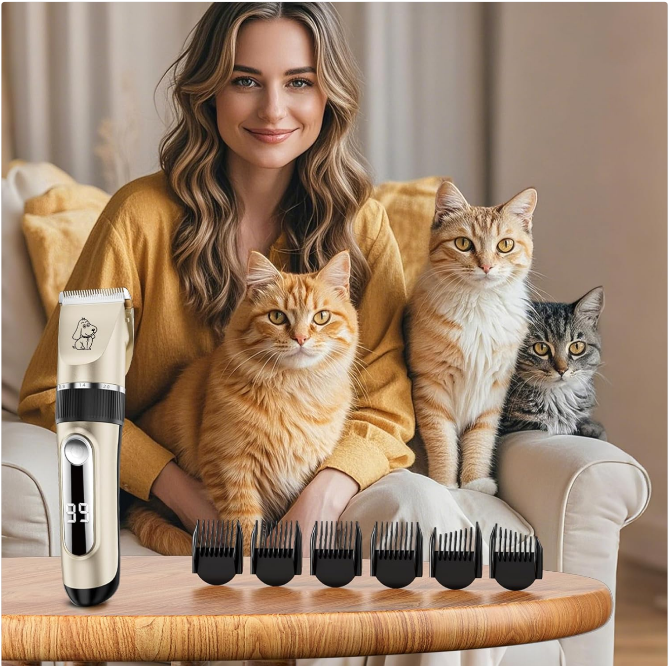
Figure 3.1: All included components of the NWOUIIAY Pet Hair Trimmer set.