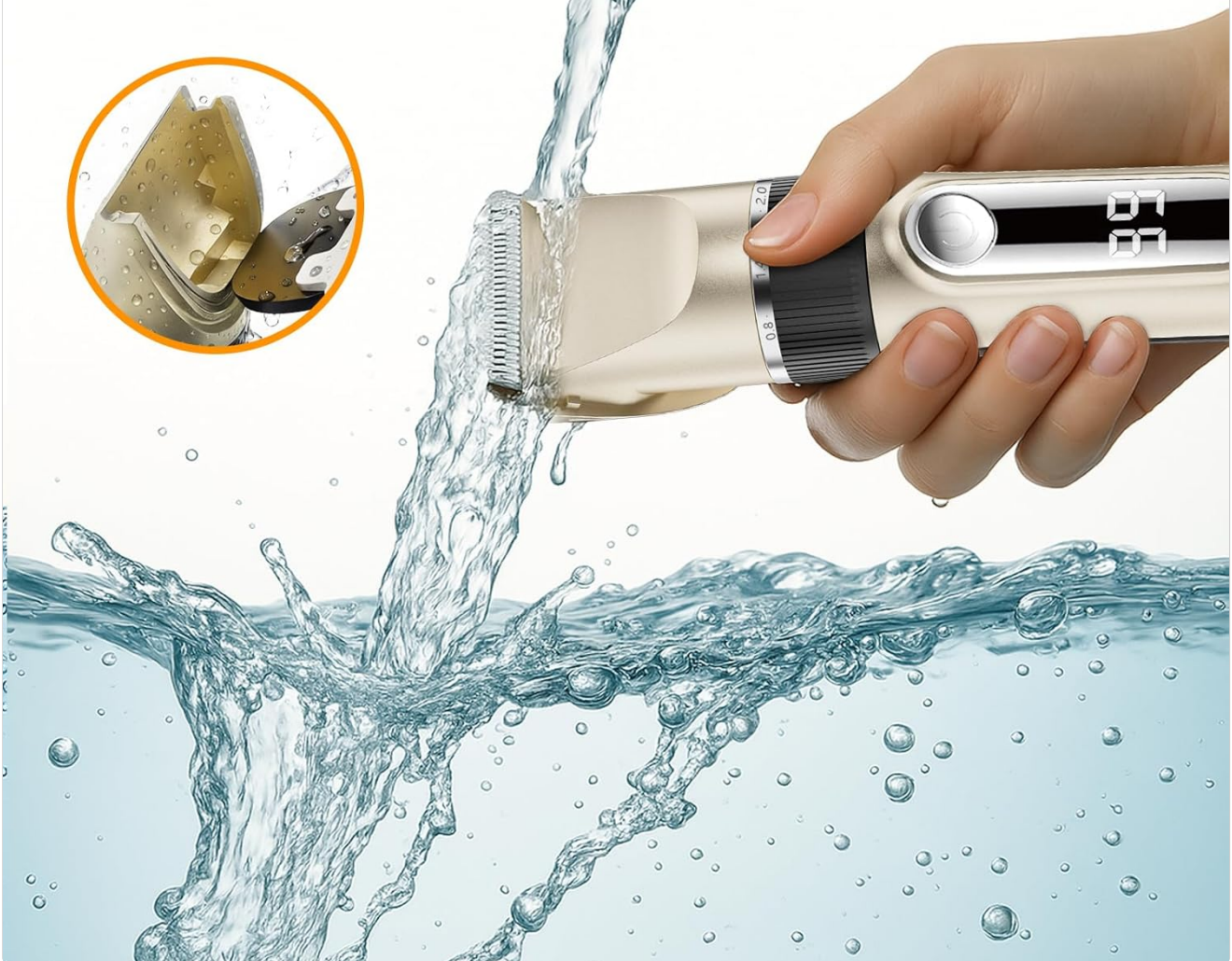
Figure 6.1: Waterproof IPX7 design for easy and quick cleaning.