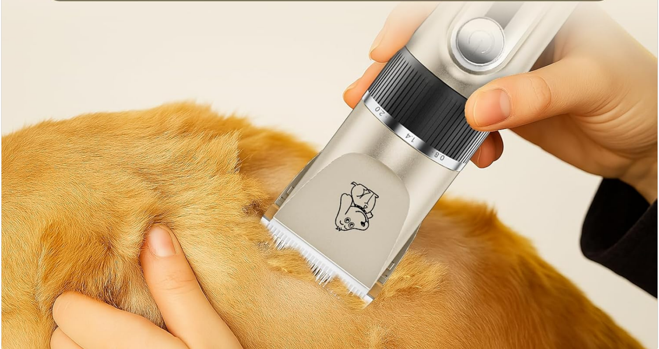
Figure 5.2: Trimming a pet's fur with the clipper, highlighting its long battery life.