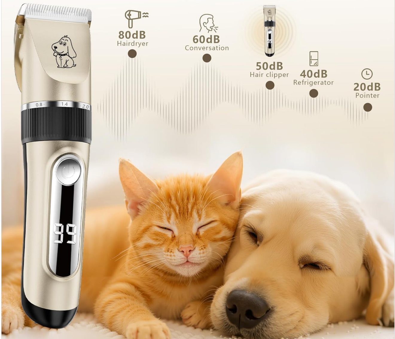
Figure 5.1: Gentle trimming for pet's peace of mind with low noise operation.