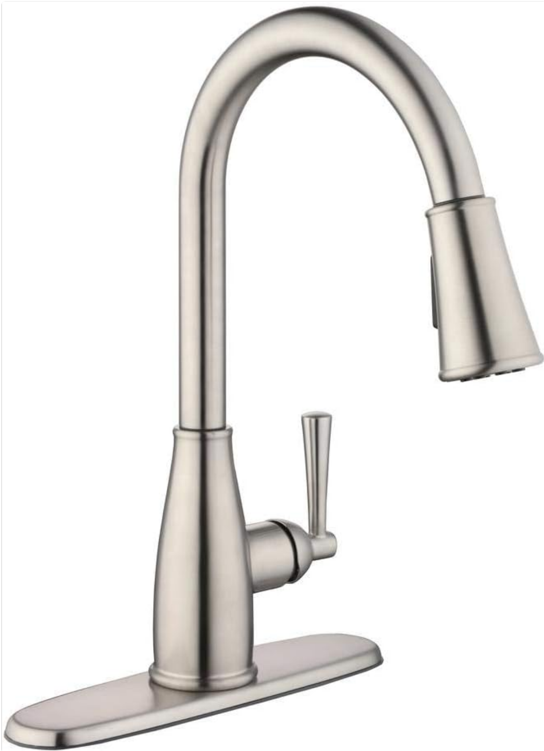
Image: The complete Fairhurst Single-Handle Pull-Down Sprayer Kitchen Faucet assembly, showcasing the high-arc spout, single lever handle, and pull-down sprayer in a stainless steel finish.