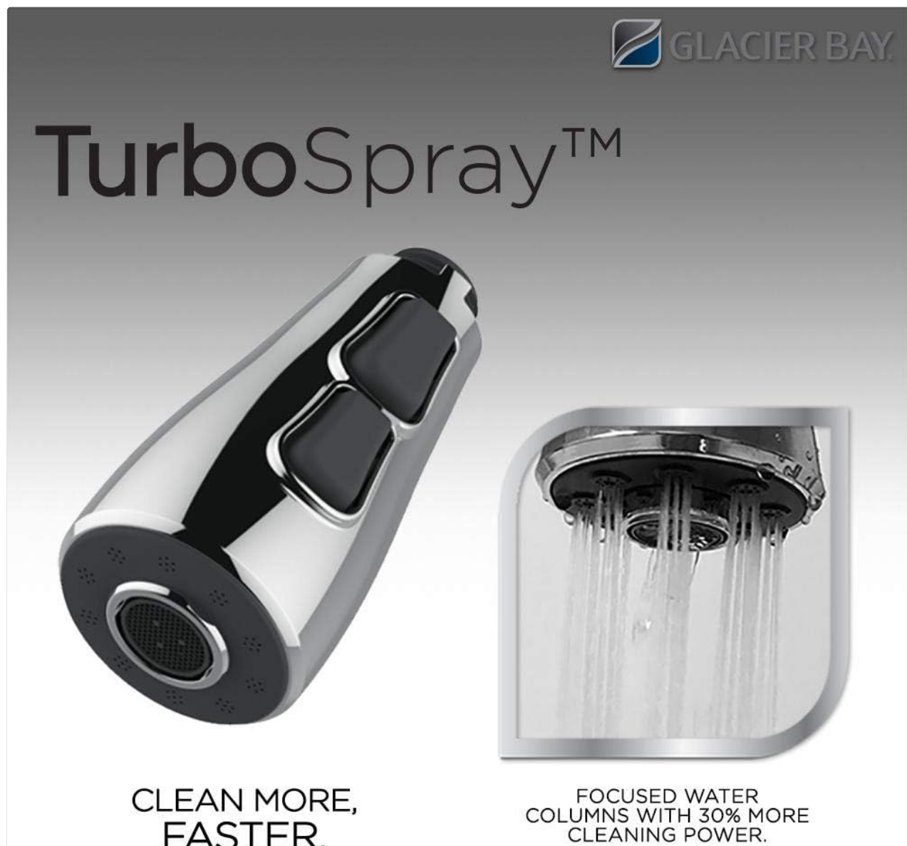
Image: Diagram illustrating the TurboSpray™ technology. It shows a close-up of the sprayer head and a visual representation of focused water columns delivering 30% more cleaning power compared to a standard spray.