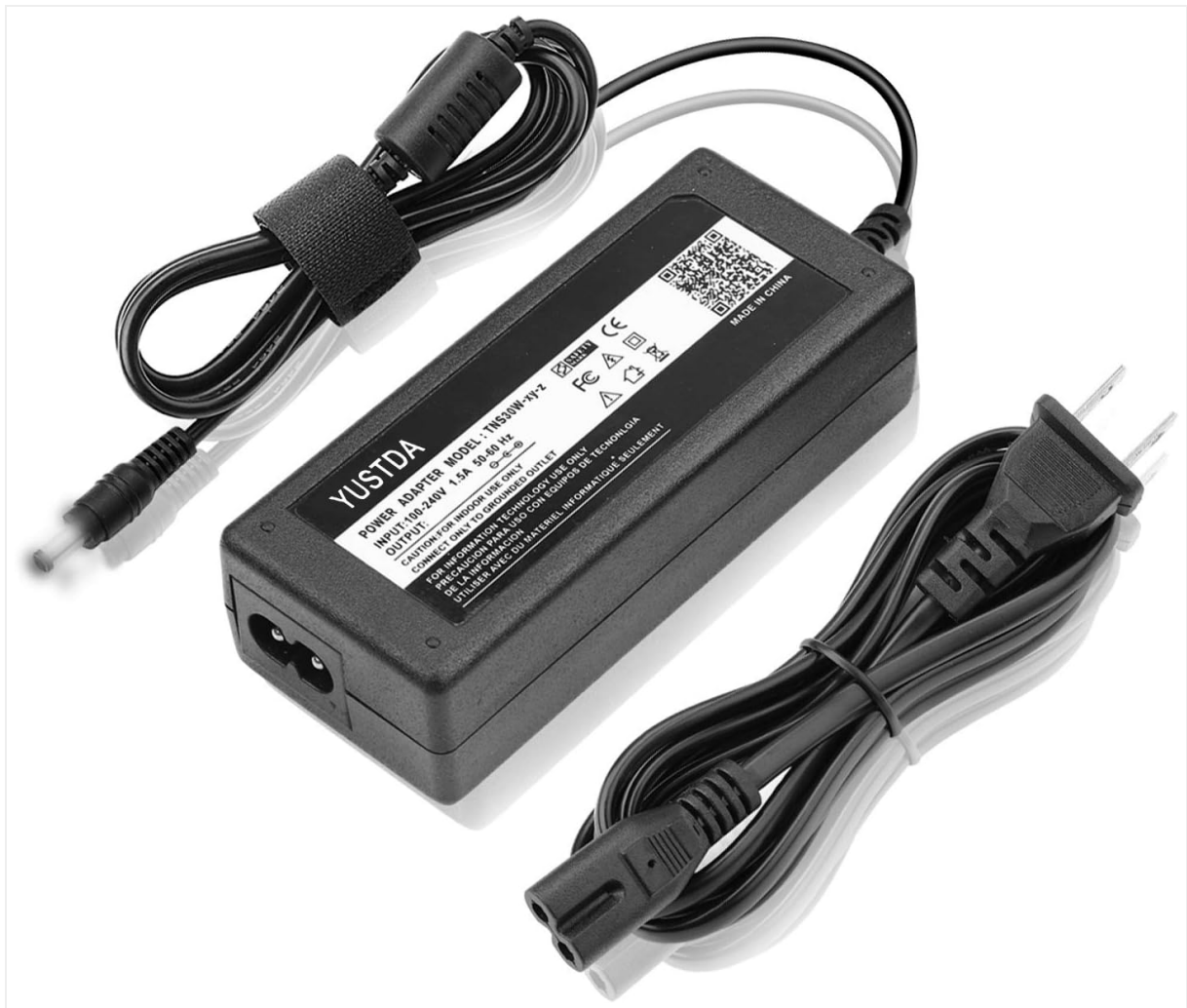
Figure 1.1: Overview of the YUSTDA AC/DC Adapter, showing the main unit, input power cable, and output DC connector.