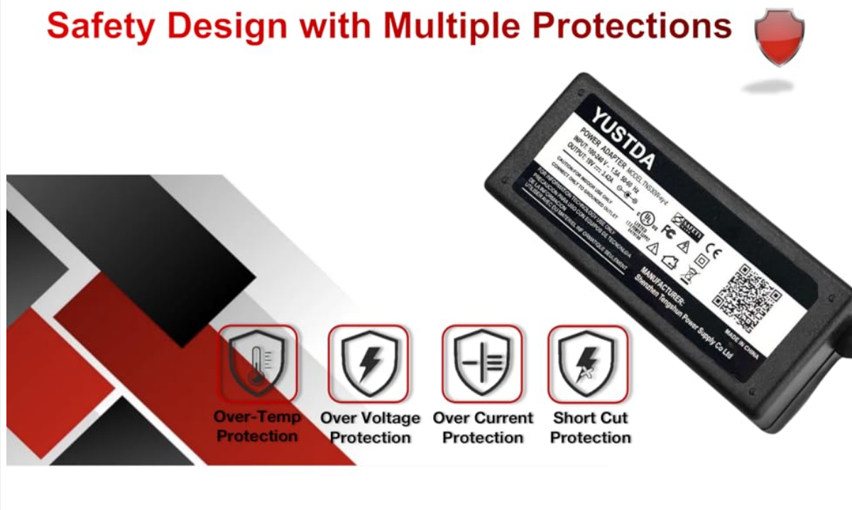
Figure 4.2: The adapter's durable and compact design ensures safe, reliable operation and portability for home, office, and travel.