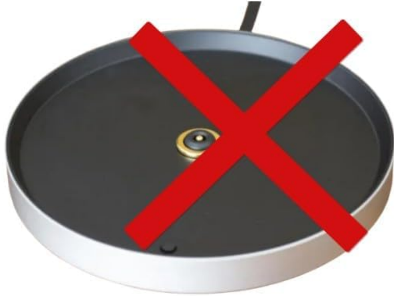
Figure 3.1: Clarification that the product is an AC/DC adapter for power supply, not a charging base for devices.