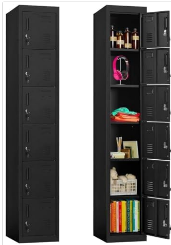
Figure 1: Front view of the INTERGREAT 6-Door Metal Employee Locker.