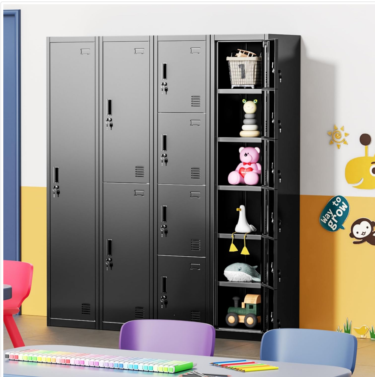
Figure 5: Examples of suitable items for storage within the locker compartments.