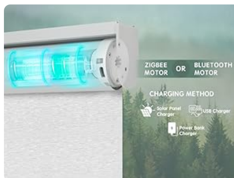
Figure 9: Bluetooth Motor compatibility with Yoolax Home App and optional Smart Bridge.