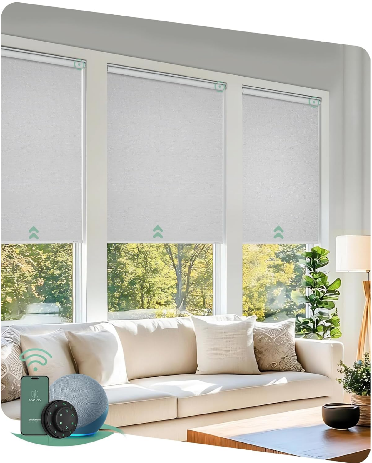
Figure 1: Yoolax Motorized Blackout Smart Blinds in a modern living room setting.