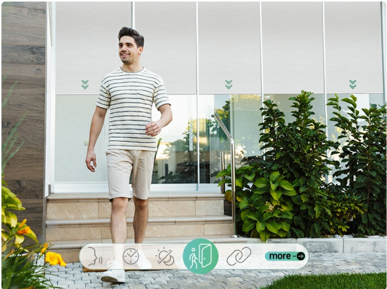
Figure 5: The Yoolax Lightwirl Remote for convenient blind operation.

The Yoolax Lightwirl Remote can control up to 9 blinds, offering advanced functions like group control and precise opening adjustments. A 16-Channel Remote is also available, compatible exclusively with Zigbee and Bluetooth motors, capable of controlling up to 16 blinds.