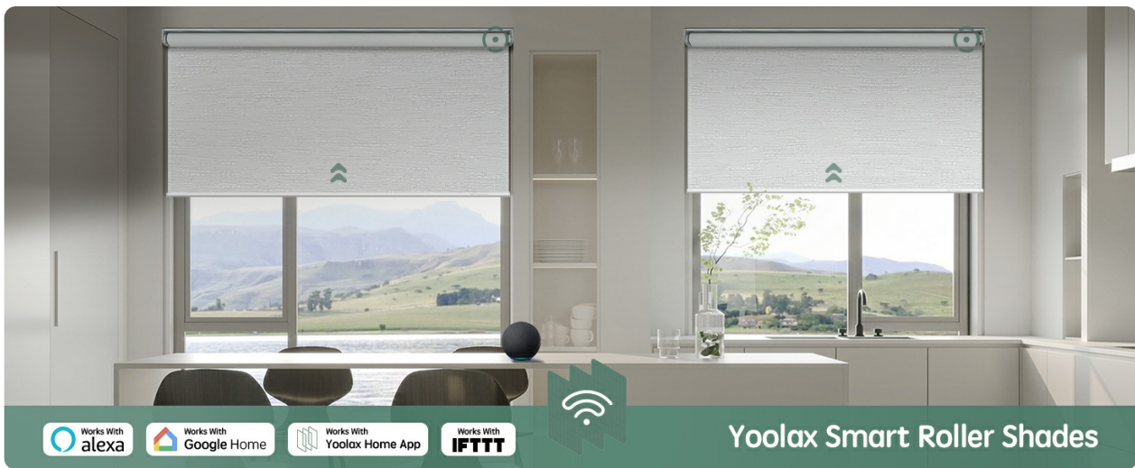
Figure 7: Voice control integration with Alexa for hands-free operation.