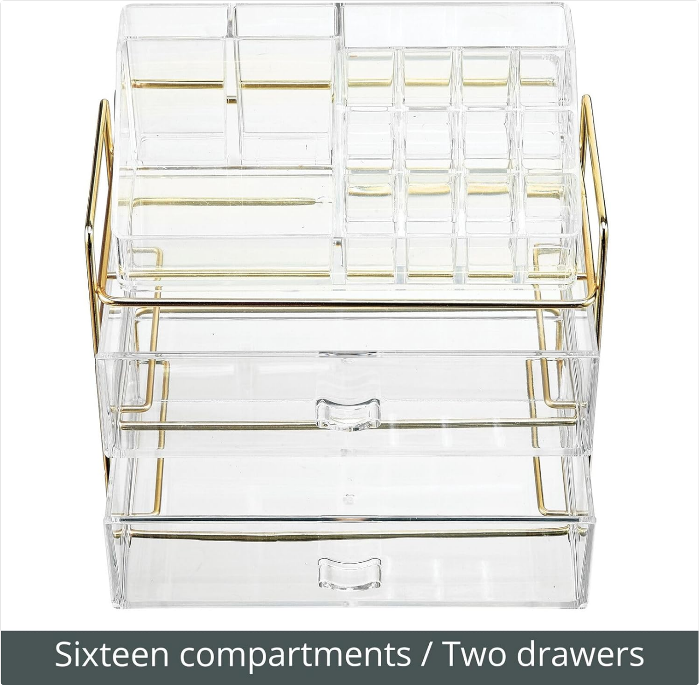
Image 4: A clear view of the top section's 16 compartments, designed for various cosmetic sizes.