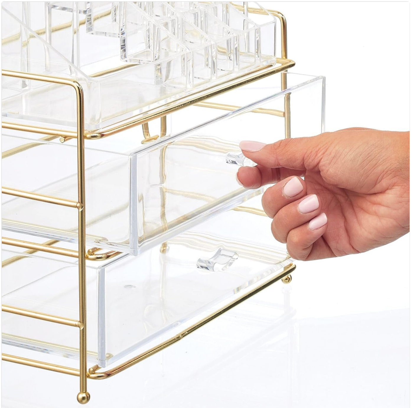
Image 2: Demonstrates the smooth operation of the sliding drawers, ideal for storing larger palettes or enclosed items.