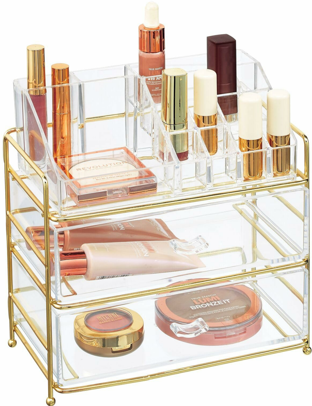
Image 1: The mDesign Cosmetic Storage Unit, showcasing its clear design and how it can hold a variety of makeup items like lipsticks, brushes, and palettes.