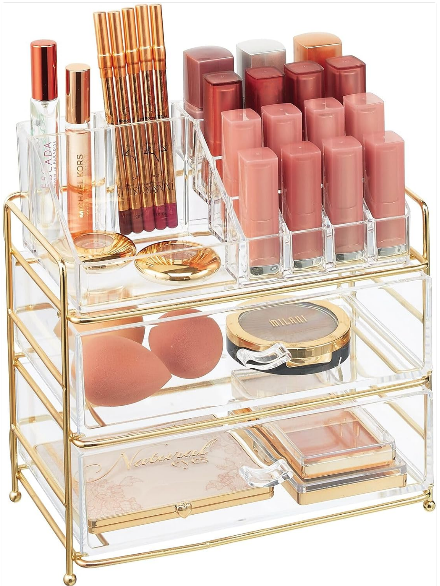
Image 5: The organizer in practical use, holding numerous makeup items efficiently.