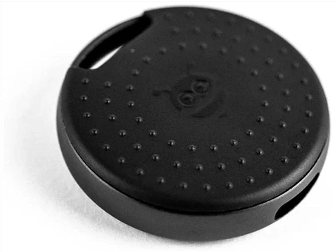
Image: A detailed view of a single Pebblebee Finder 2.0, highlighting its textured surface and integrated loop for attaching to items.