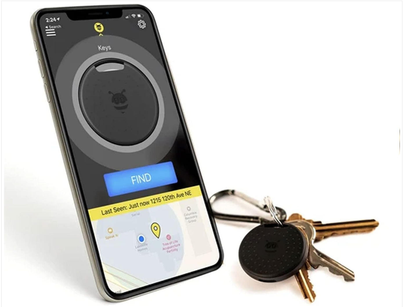
Image: A smartphone displaying the Pebblebee app, showing the location of a tracker on a map and a large "FIND" button. A Pebblebee Finder 2.0 attached to keys is visible next to the phone.