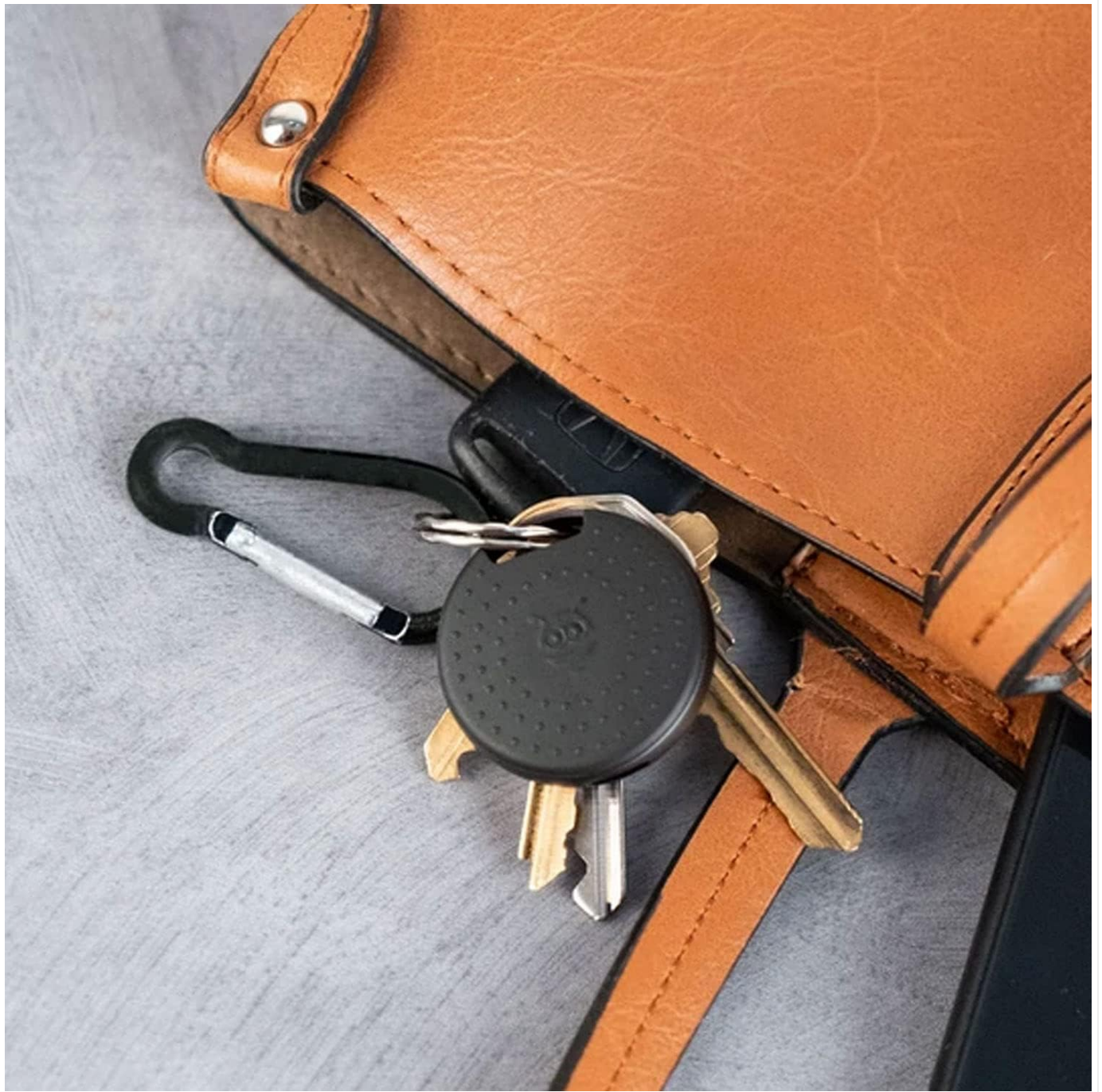
Image: A Pebblebee Finder 2.0 attached to keys, with the keys partially tucked into a brown leather bag, illustrating how the device can be used to track items within bags.