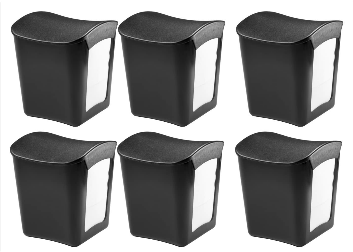
Image: Front view of the GARNET Evolution Napkin Dispenser, showcasing its sleek black design and the napkin opening.