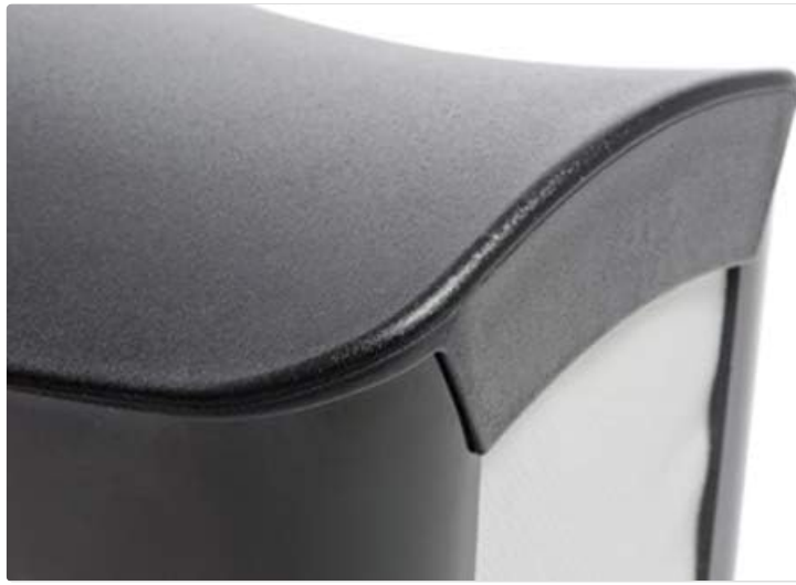
Image: A detailed view of the top section of the napkin dispenser, showing its curved design.