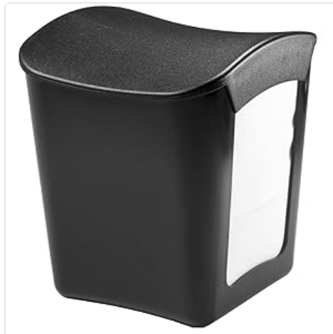
Image: A close-up view of the napkin dispenser, highlighting the double entry design for napkins.