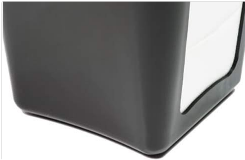
Image: A detailed view of the base of the napkin dispenser, illustrating its sturdy construction.