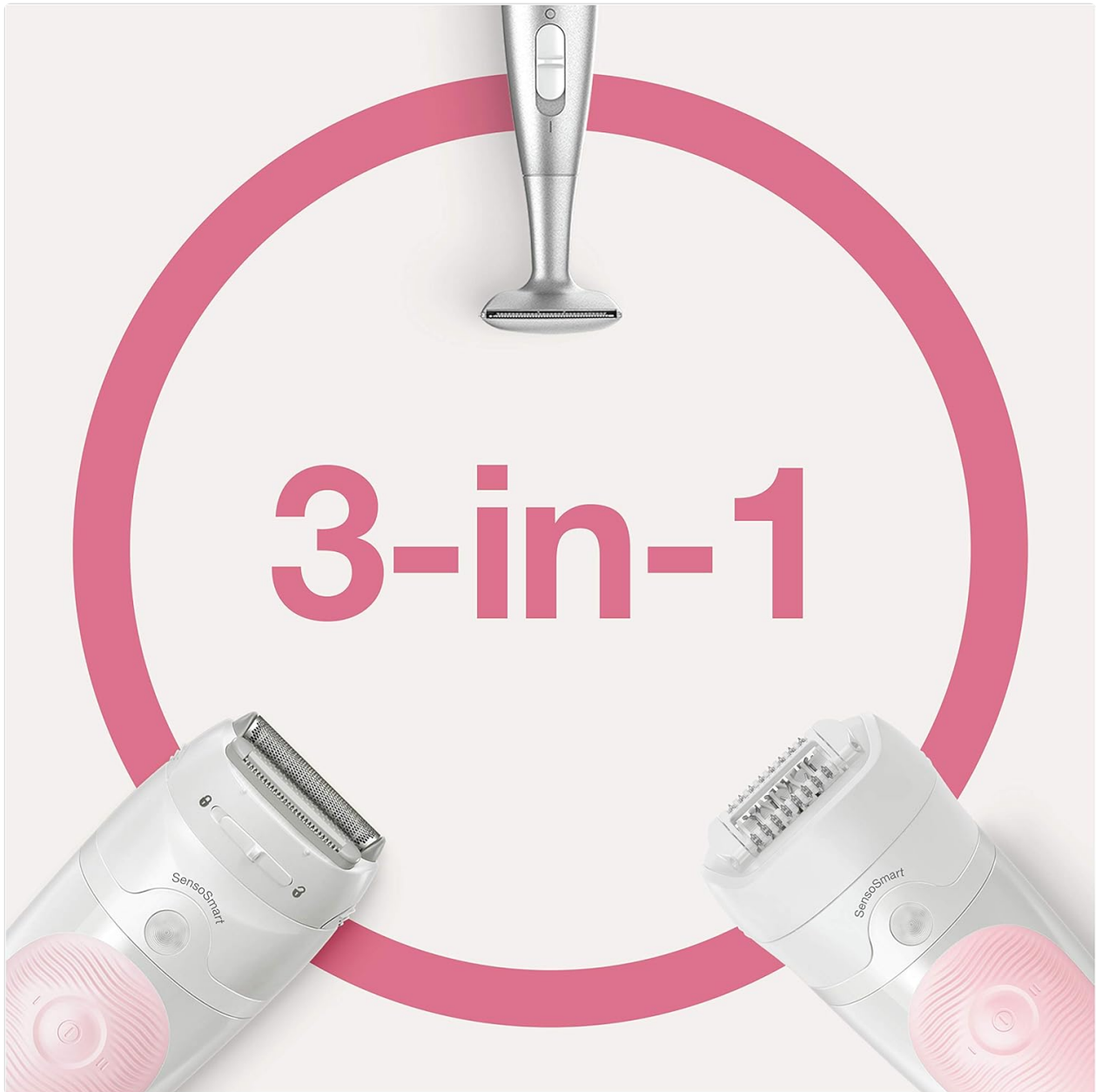
Image 4: An overhead view showcasing the Braun Silk-épil 5 main unit with both the epilator head and the shaver/trimmer head attached, emphasizing its 3-in-1 functionality. The bikini styler is also visible at the top.