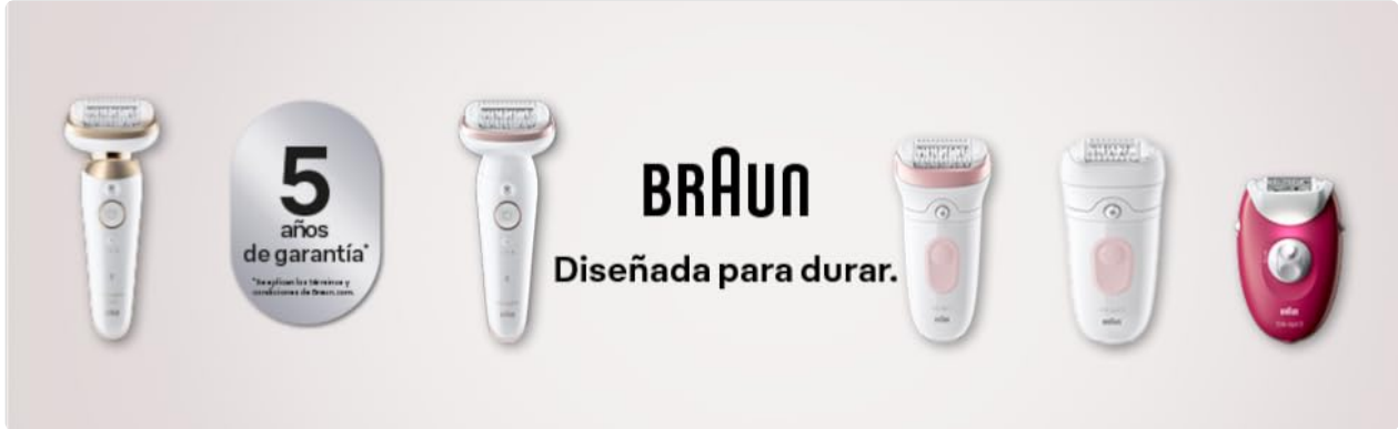
Image 5: A banner displaying various Braun epilators and highlighting a "5 years warranty" logo, emphasizing the brand's commitment to durability.

For further assistance, product registration, or to find authorized service centers, please visit the official Braun website or contact their customer support.