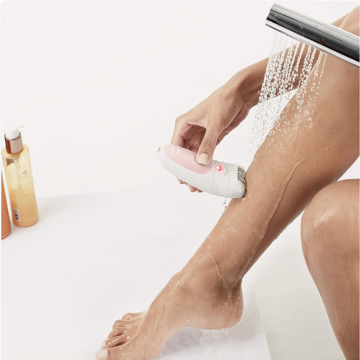
Image 3: A person using the Braun Silk-épil 5 epilator on their leg under running water in a shower, demonstrating its wet use capability.