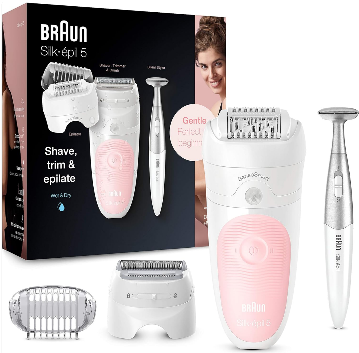
Image 1: The Braun Silk-épil 5 SES5-820 epilator with its included shaver head, bikini styler, and comb. The packaging is also visible, highlighting the "Gentle Perfect for beginners" feature.