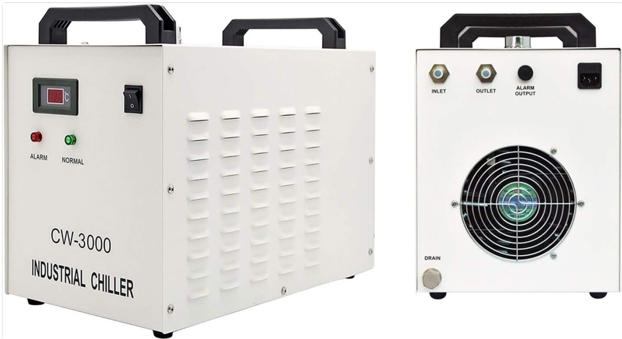
Image: Front and rear views of the CW-3000DK Industrial Chiller. The front panel shows the temperature display, power switch, and alarm/normal indicators. The rear panel displays the inlet, outlet, alarm output, power socket, radiator fan, and drain.