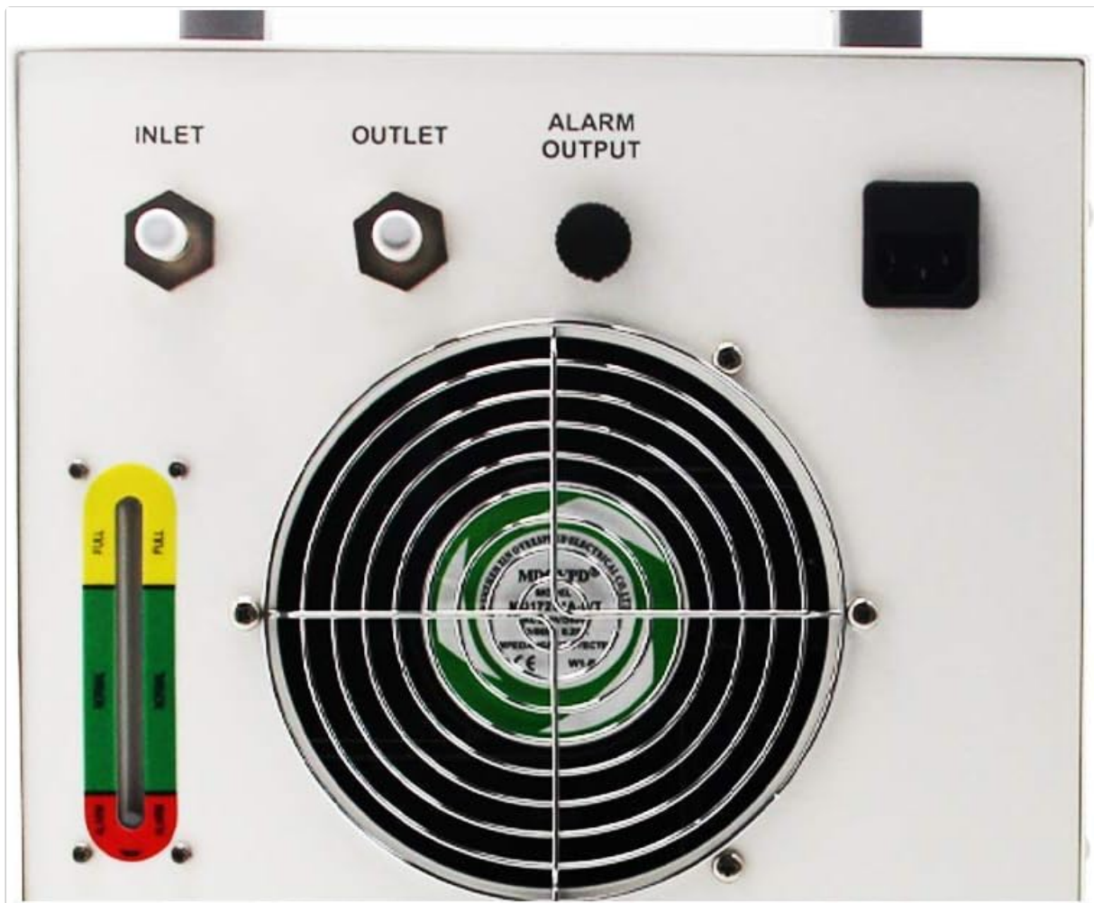
Image: A close-up view of the water level indicator located on the rear panel of the chiller. The indicator shows 'FULL' and 'PULL' markings, with green and red sections to denote appropriate water levels.