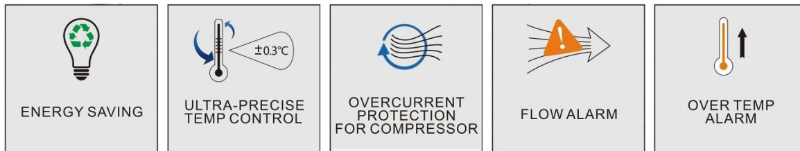
Image: Icons illustrating the advantages of the CW-3000 chiller, including Energy Saving, Ultra-Precise Temperature Control ( \pm 0.3^{\circ}\text{C} ), Overcurrent Protection for Compressor, Flow Alarm, and Over Temperature Alarm.