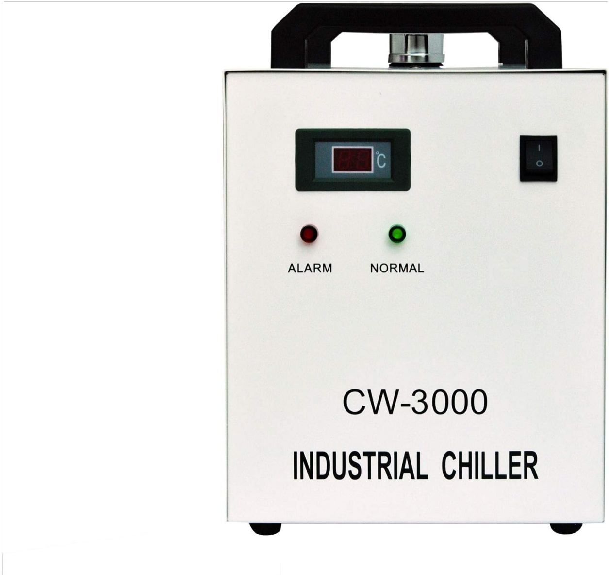
Image: A close-up view of the chiller's front panel, featuring a digital temperature display, a red 'ALARM' indicator light, a green 'NORMAL' indicator light, and the main power switch.