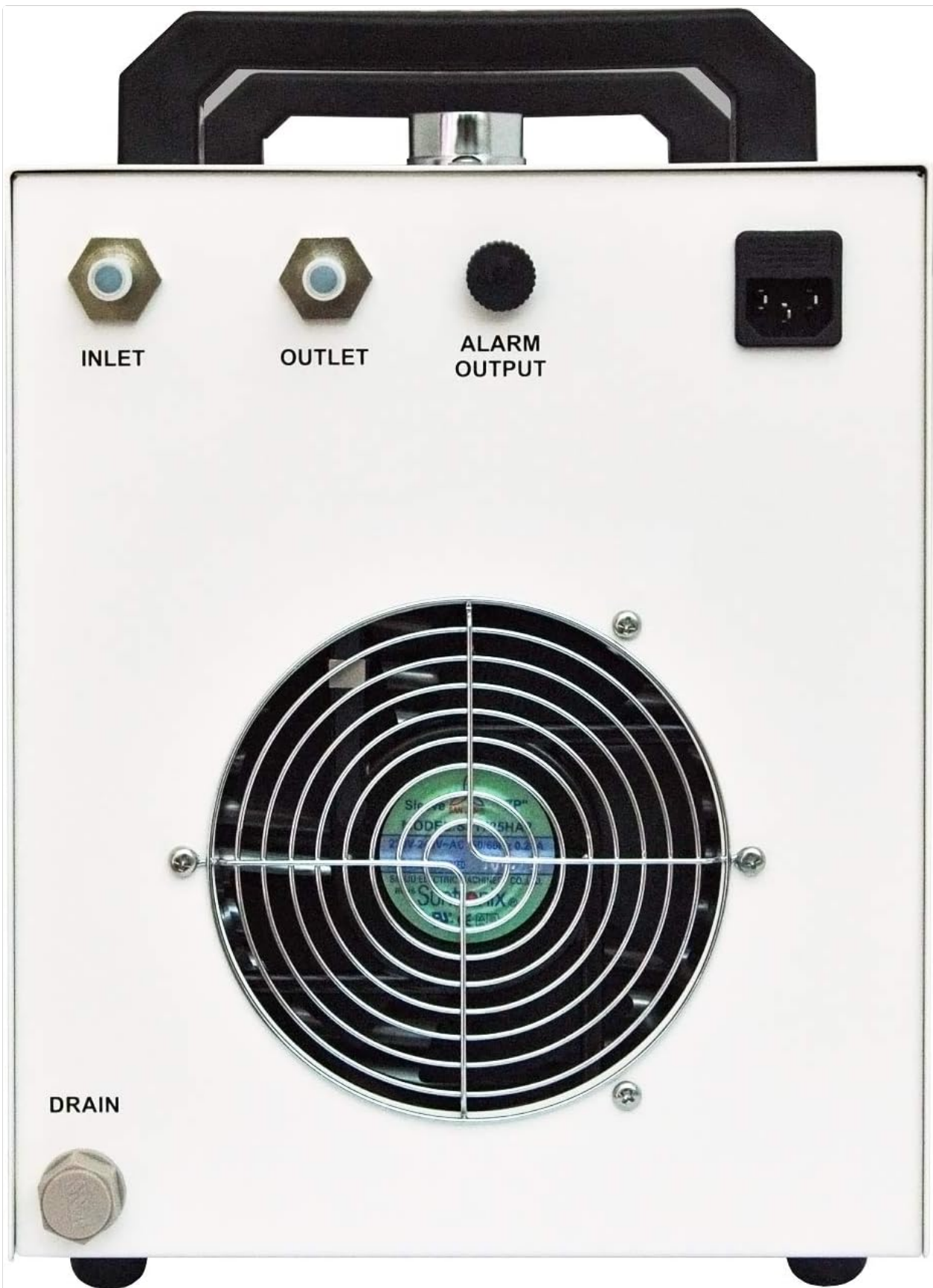
Image: A detailed view of the rear panel connections, showing the 'INLET' and 'OUTLET' water ports, the 'ALARM OUTPUT' terminal, the power socket, and the 'DRAIN' valve at the bottom. The radiator fan is also visible.