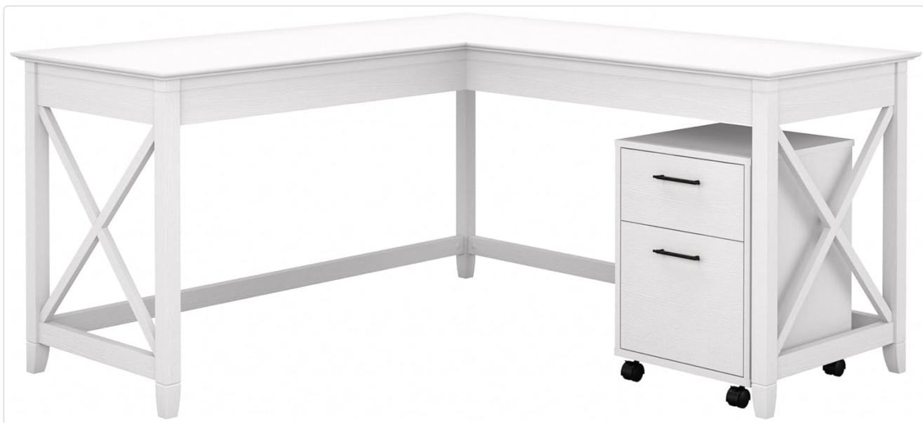
Image 1: The Bush Furniture Key West L-Shaped Desk and Mobile File Cabinet in Pure White Oak.

The Key West L-Shaped Desk and Mobile File Cabinet combine to create a functional and stylish workspace. The desk offers a spacious work surface, while the mobile file cabinet provides convenient storage for documents and office supplies.