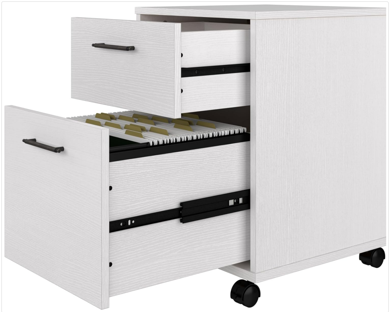
Image 4: The two drawers of the mobile file cabinet shown open, illustrating the storage capacity for files and supplies.

To secure the file cabinet in place, engage the front-locking casters. To move the cabinet, unlock the casters and gently roll it to the desired position.