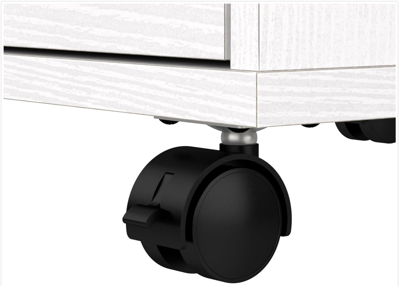
Image 5: A close-up view of the mobile file cabinet's casters, highlighting the locking mechanism for stability.