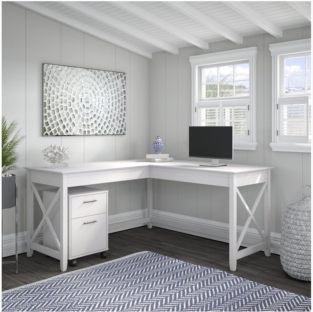
Image 2: The L-Shaped Desk and Mobile File Cabinet arranged in a home office environment.

Your browser does not support the video tag.