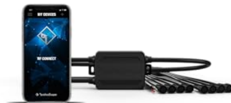
Image: The Rockford Fosgate PMX-RGB Color Optix Controller, sold separately, for managing LED lighting.