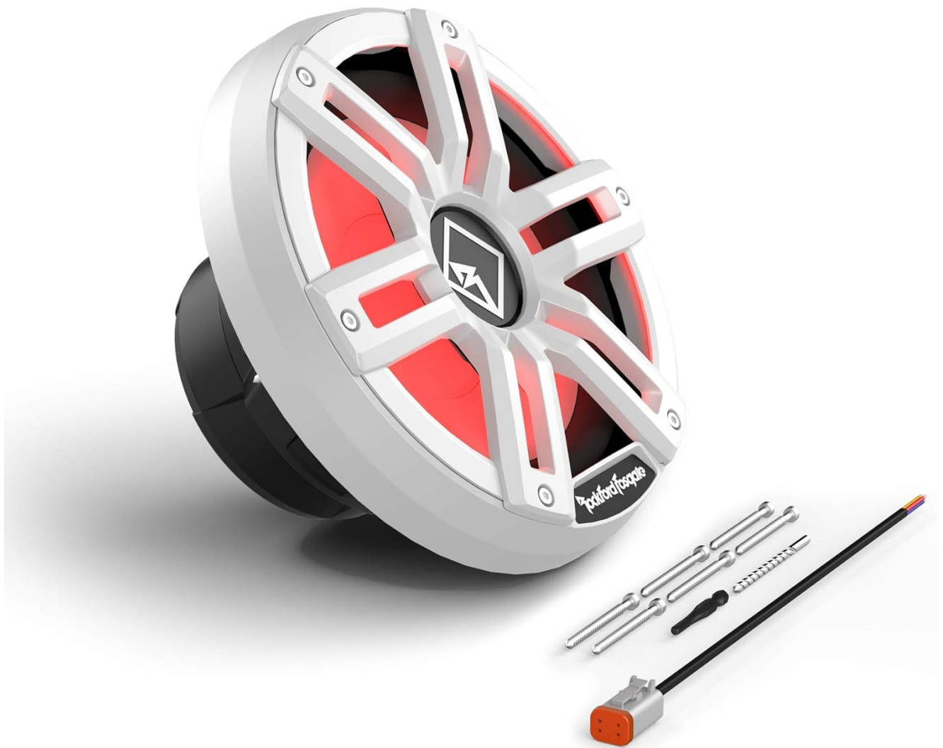
Image: The M2D4-10I subwoofer shown with its wiring harness and mounting hardware.