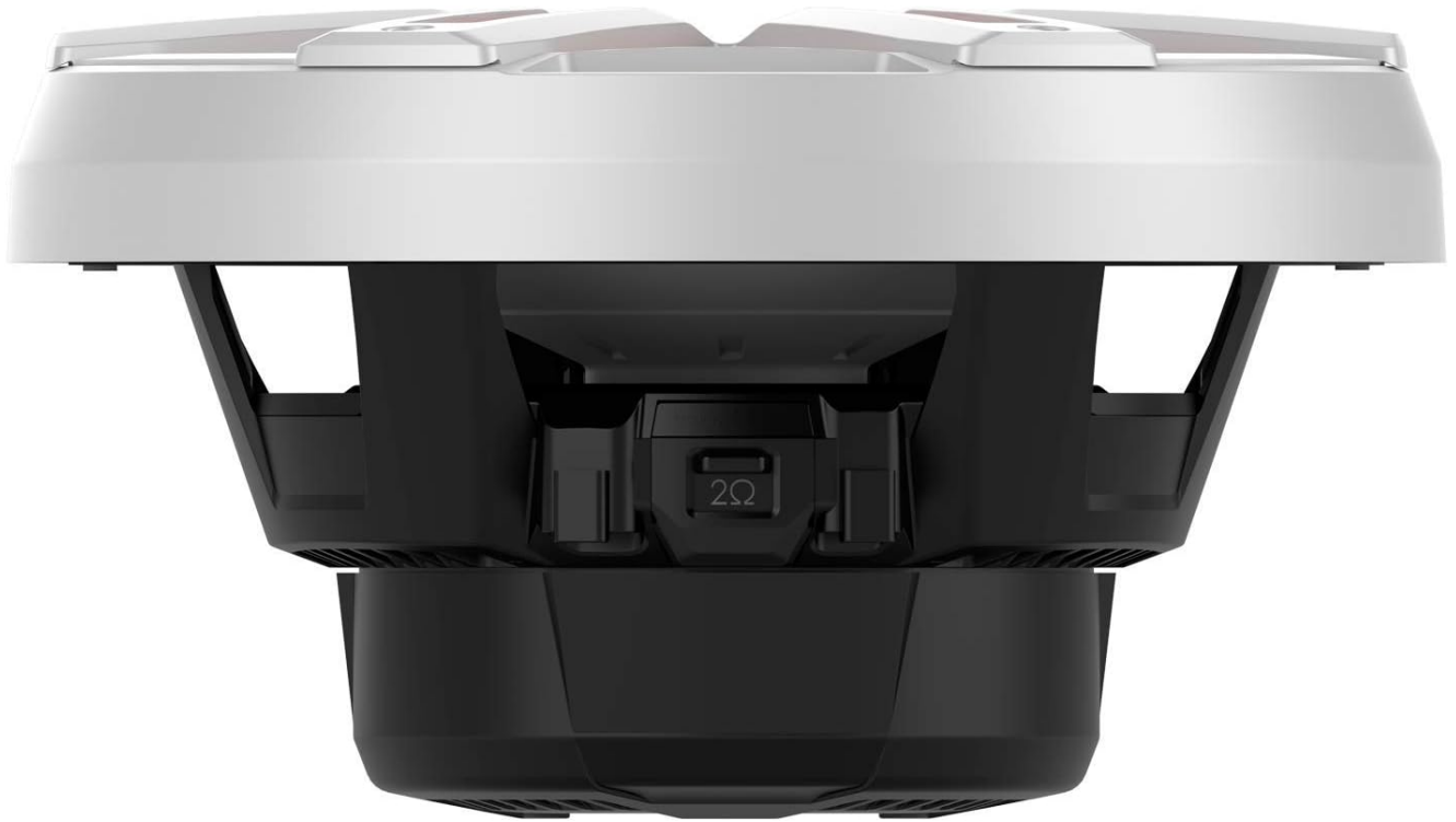
Image: Detail of the VersaSwitch for impedance selection on the subwoofer.