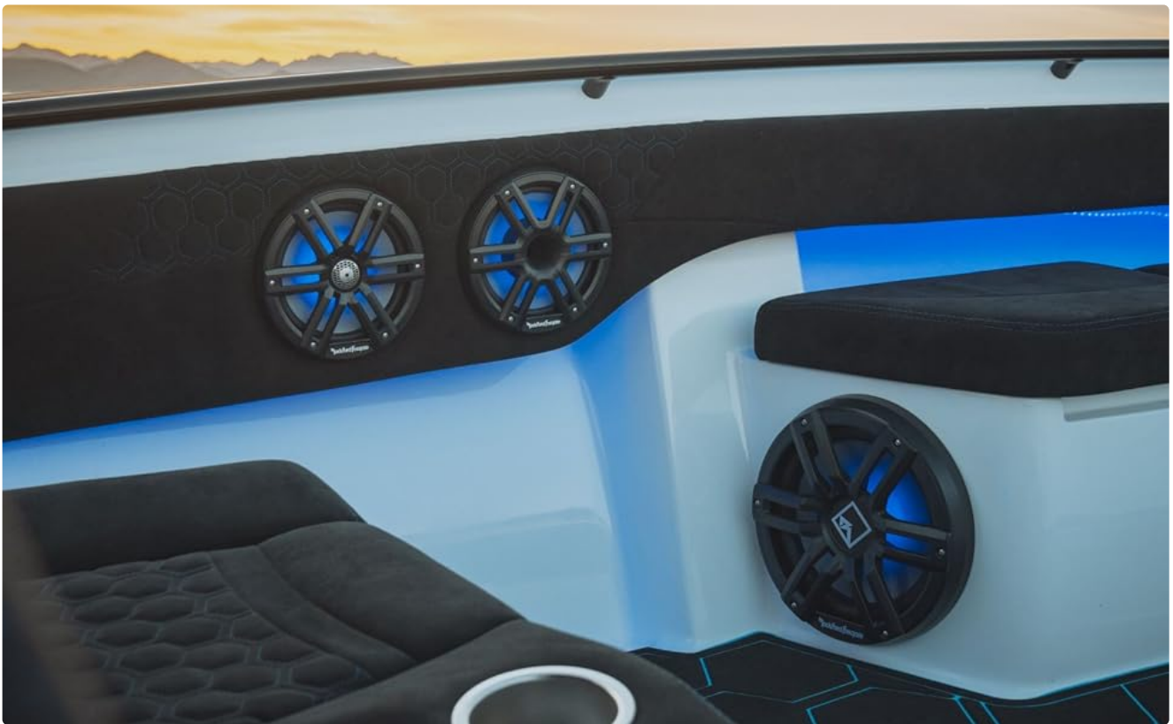
Image: Example of Color Optix lighting in a marine audio setup.

To customize the multicolor LED lighting, use the Rockford Fosgate RF Connect App in conjunction with the PMX-RGB Color Optix Controller (sold separately). The app allows you to select various colors, patterns, and brightness levels for your subwoofer's lighting.