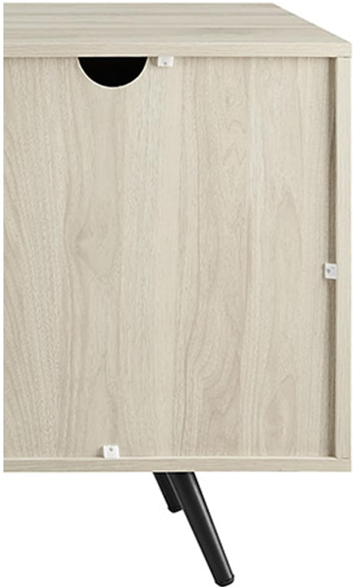
Detail of the simple cord management system, featuring cut-outs at the back for organizing wires.

Easily organize messy wires with cut-outs for overall cord management.