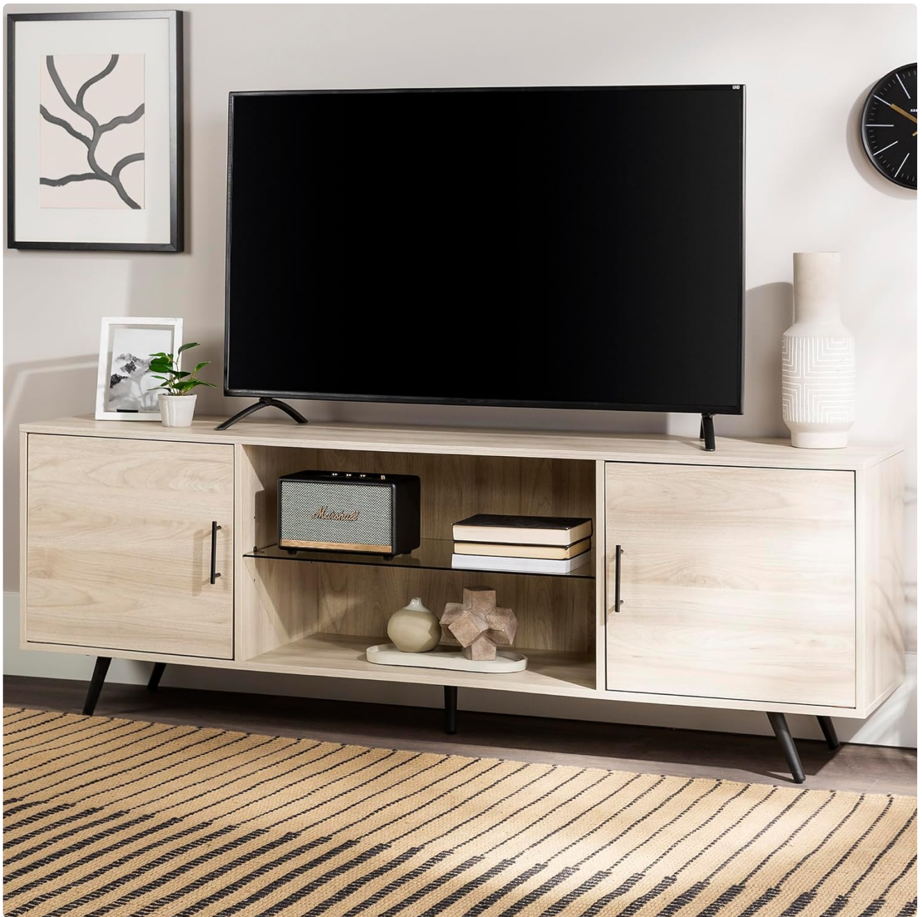
The Walker Edison Saxon TV Stand, shown here in a living room setting, accommodates a large television and provides integrated storage.