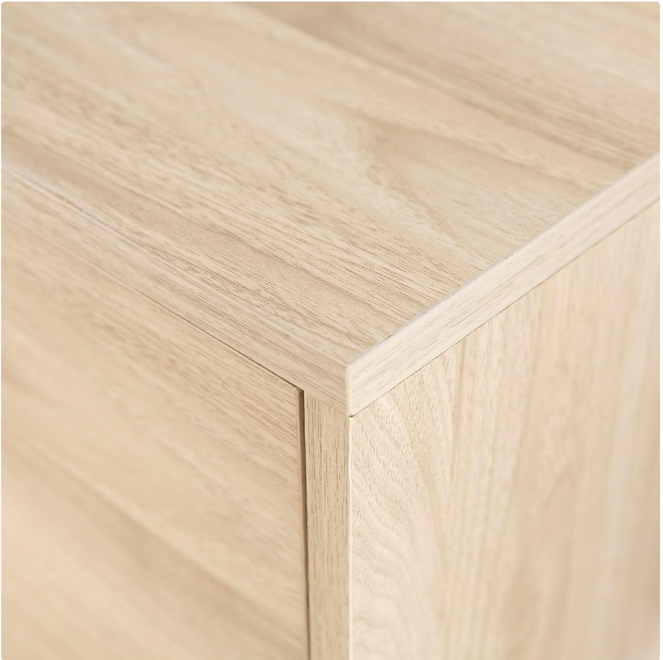
A close-up view of the birch wood grain finish, highlighting the texture and quality of the material.