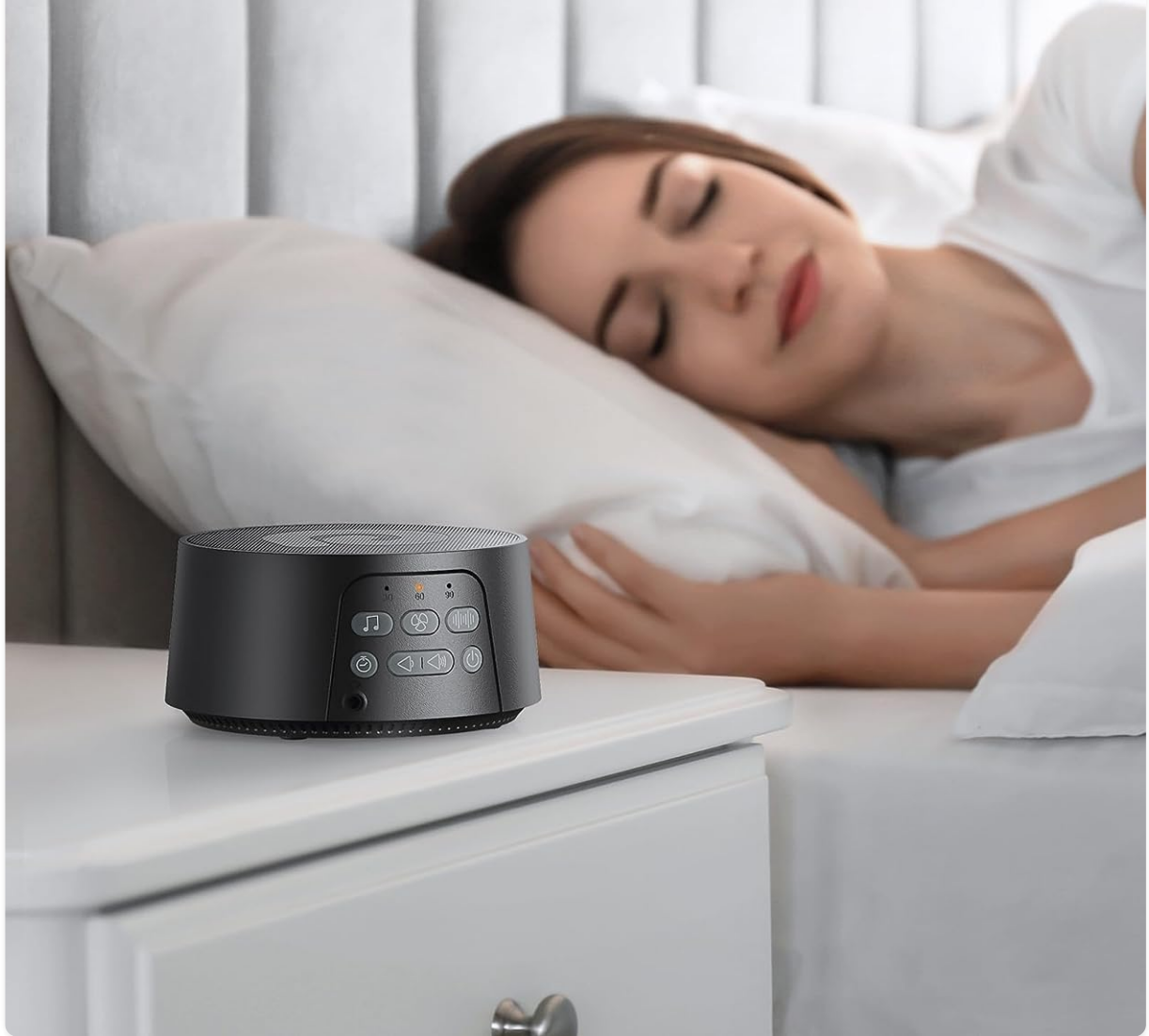
Image: The Dreamegg D3Pro-Black White Noise Machine with its adjustable timer settings (30, 60, 90 minutes) visible, placed on a bedside table next to a sleeping person.

Please be careful not to cause a shutdown when setting by mistake