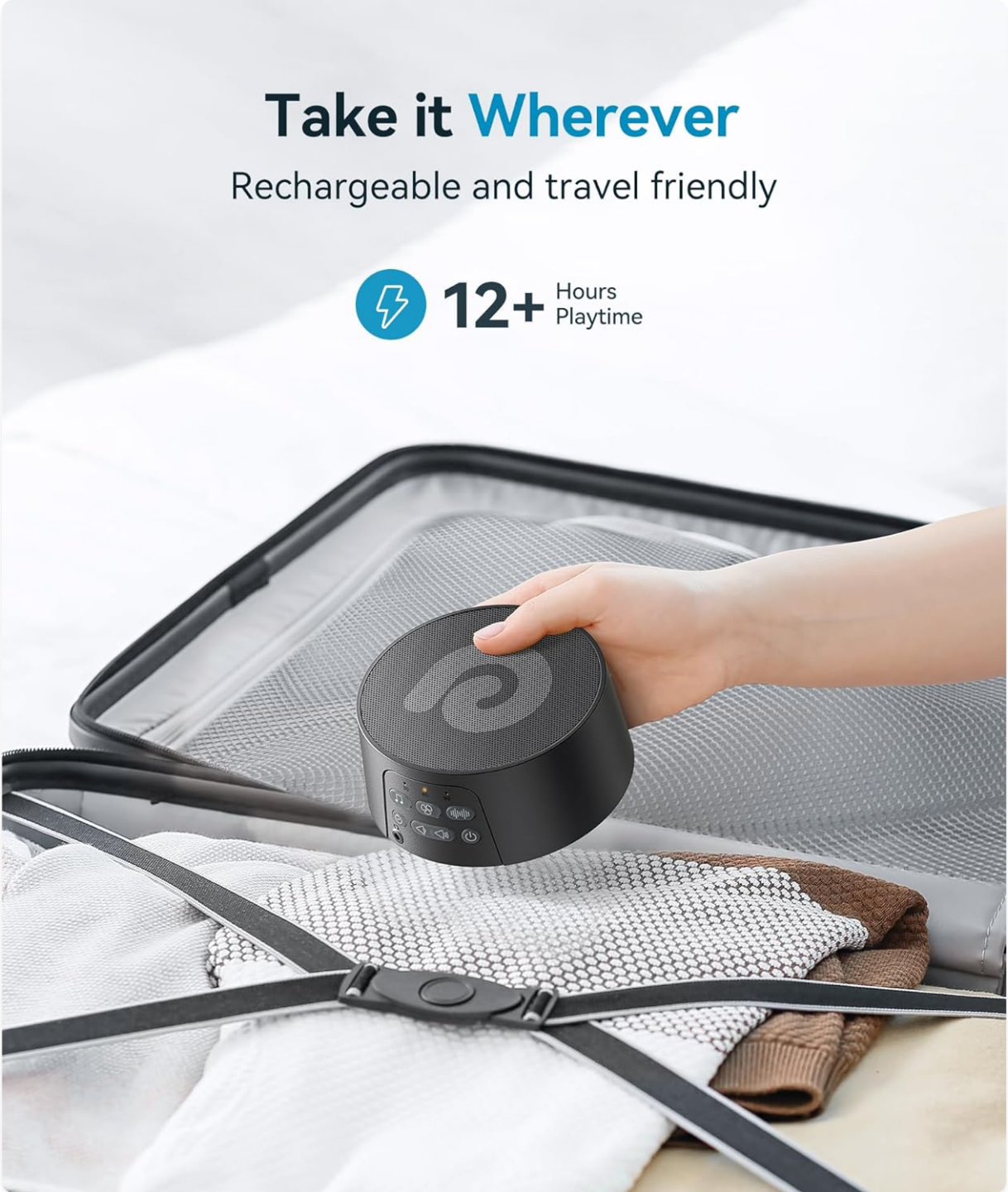
Image: The Dreamegg D3Pro-Black White Noise Machine being packed into a suitcase, emphasizing its compact size and suitability for travel.

battery provides up to 12 hours of continuous playtime on a single charge. It comes with a convenient wall plug and USB cable for charging from electrical outlets or other USB power sources. Its compact dimensions (4 x 4 x 2.3 inches; 11.52 ounces) make it an ideal travel companion, easily fitting into bags or luggage.