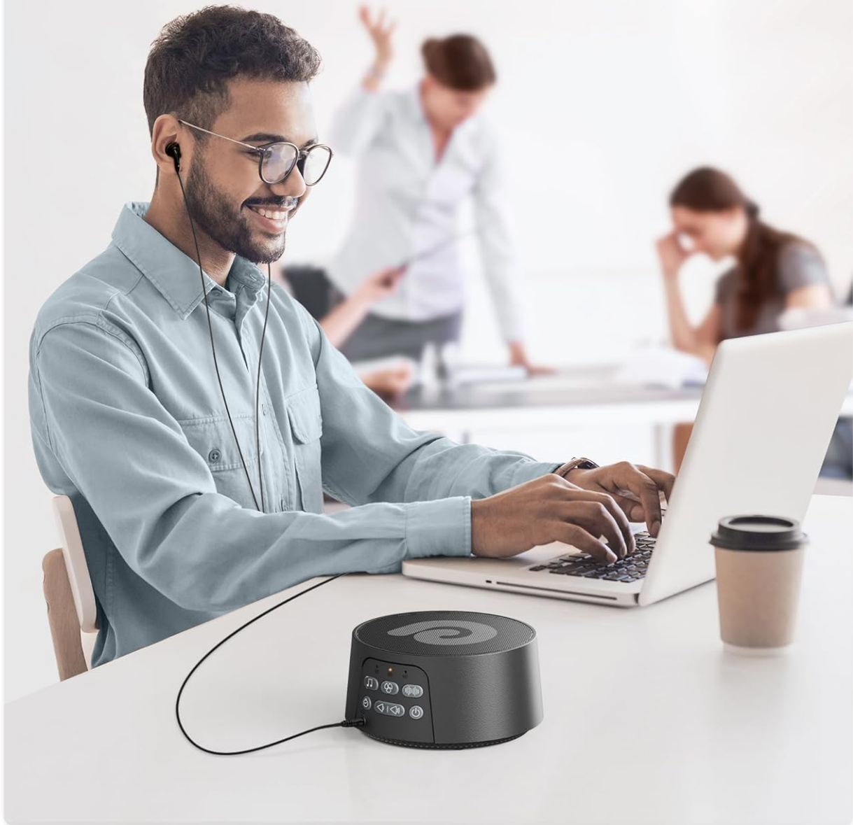
Image: A user demonstrating the headphone jack feature of the Dreamegg D3Pro-Black White Noise Machine, allowing for private listening in a busy environment.