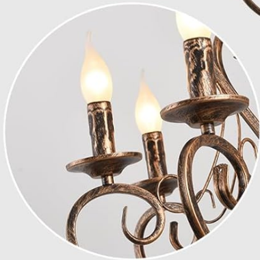
Classic candlestick style