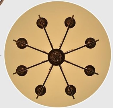
Retro and vintage home decor

Detailed view of the chandelier's features, including the adjustable chain and candlestick design.