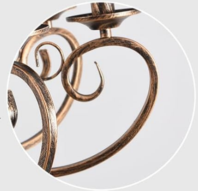
Elegantly curved light arms