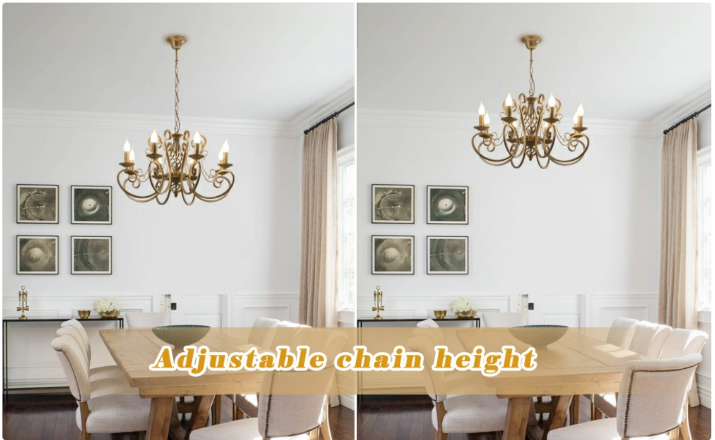
Visual guide for the installation process.