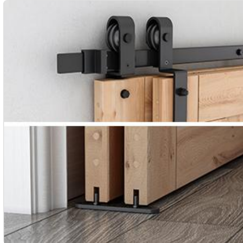
Figure 5: Detail of the rollers on the track.