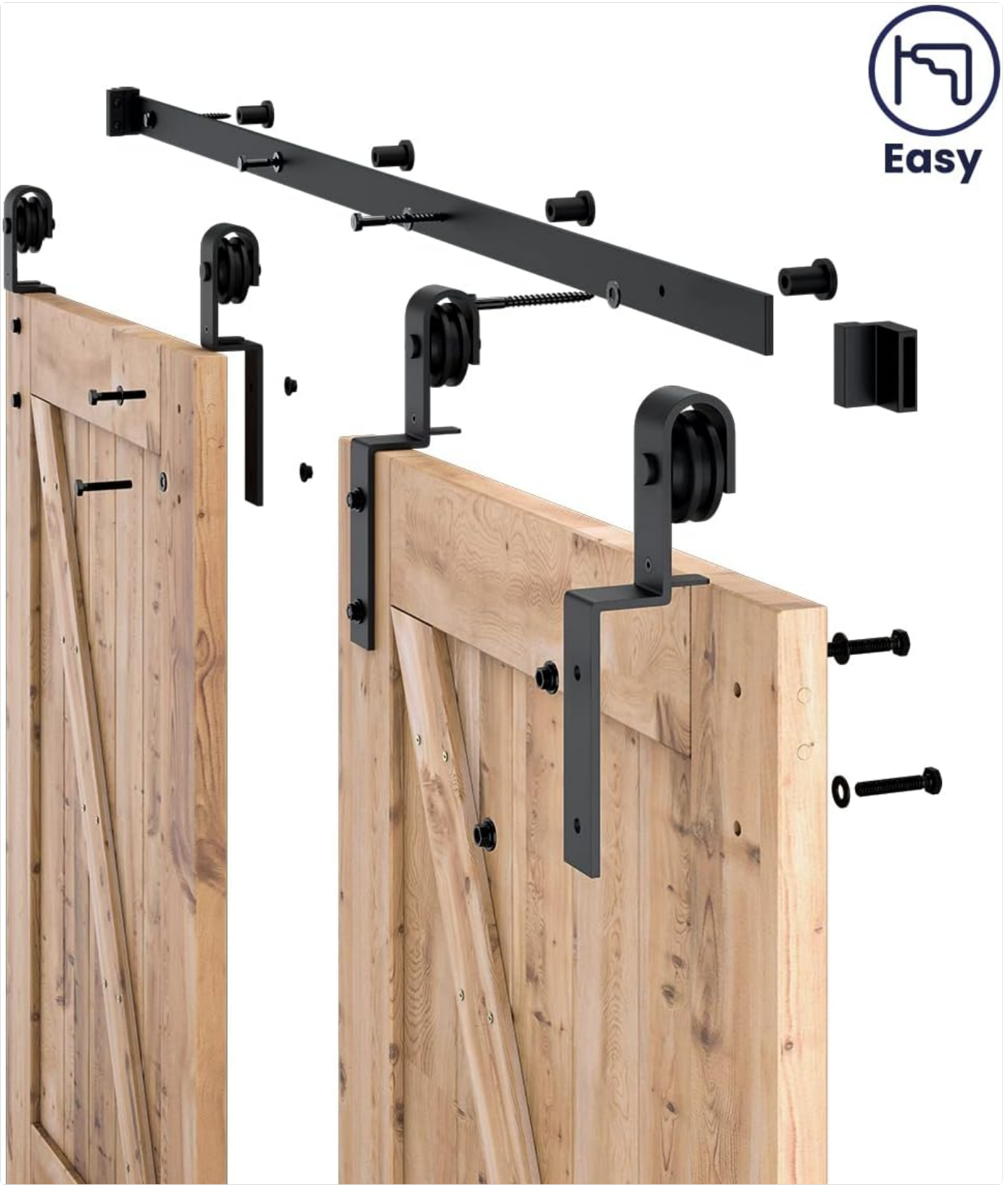
Figure 6: Exploded view of the hardware, illustrating assembly steps.