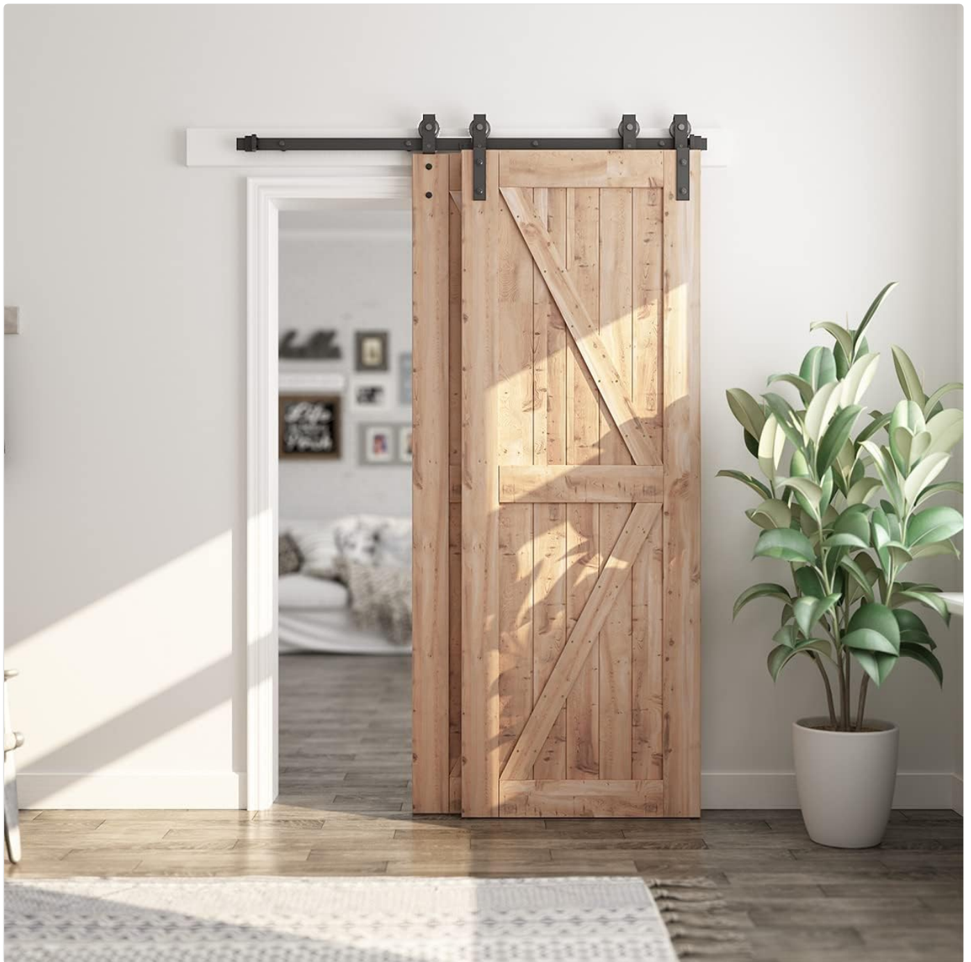
Figure 8: Example of the bypass doors in an open position.