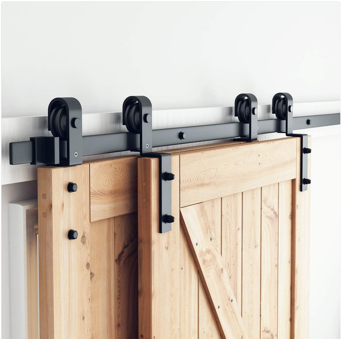
Figure 1: Fully installed SMARTSTANDARD Bypass Sliding Barn Door Hardware Kit.