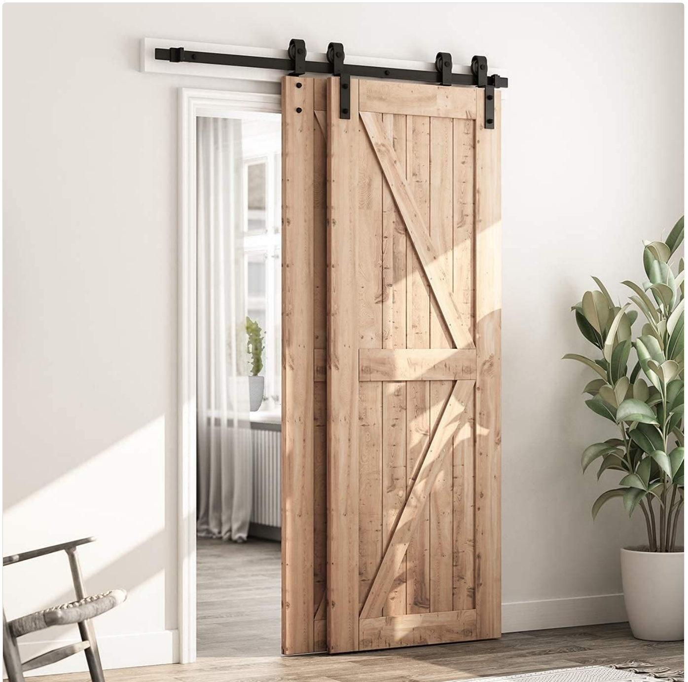
Figure 9: Example of the bypass doors in a closed position.