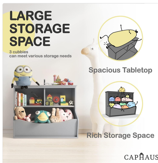
Figure 5.2: Visual representation of the storage capacity, including the tabletop and cubbies.