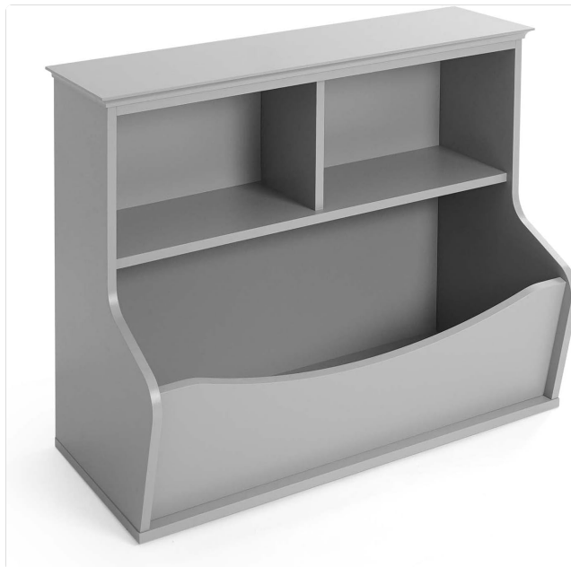
Figure 4.1: The CAPHAUS Kids' Toy Storage Cubby, ready for assembly or use.