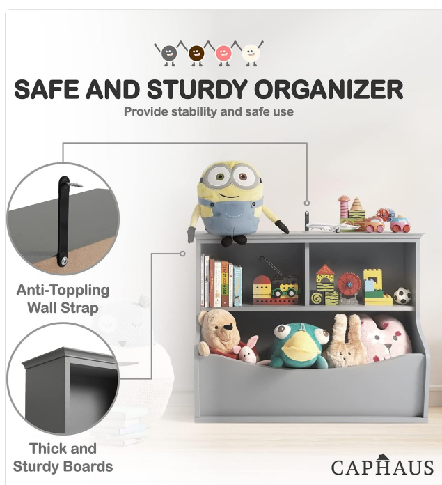
Figure 2.1: Illustration of the anti-toppling wall strap and thick