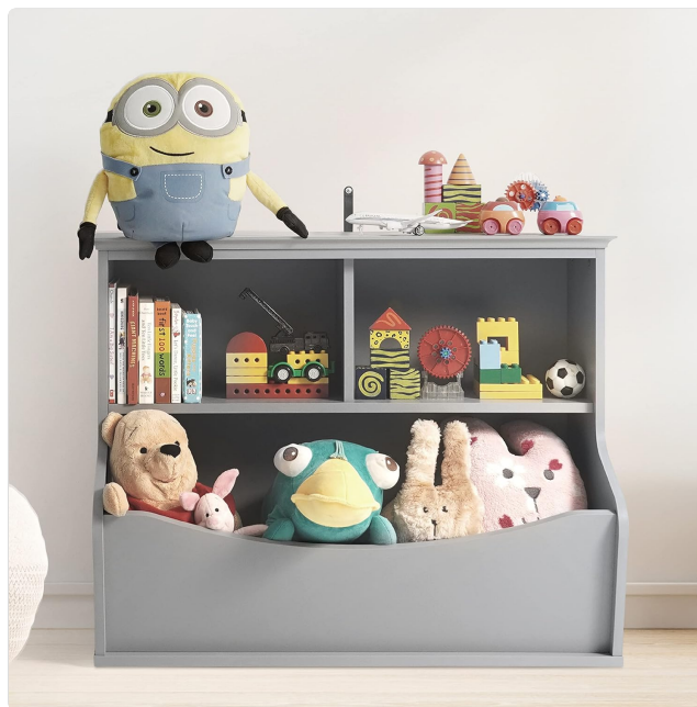
Figure 5.1: The storage cubby in use, demonstrating its capacity for books and toys.