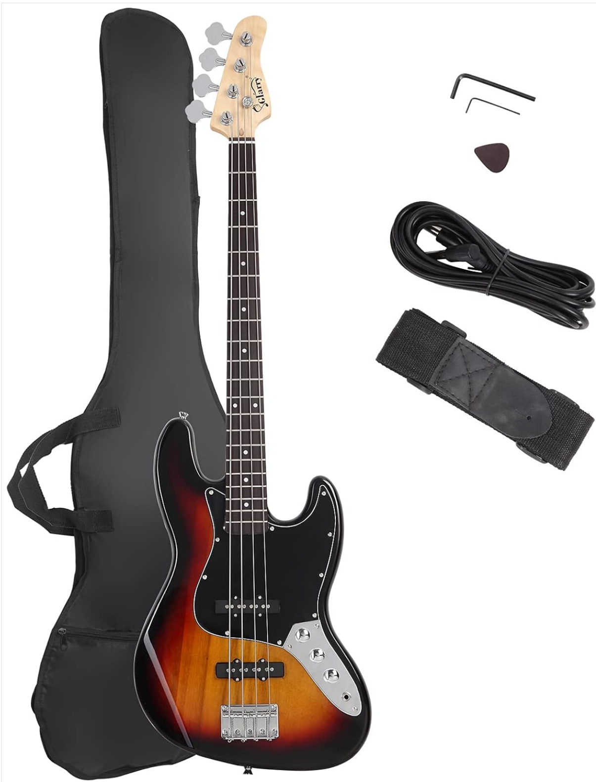
The GLARRY GJazz Electric Bass Guitar package, showing the bass, gig bag, strap, pick, and amp cord.