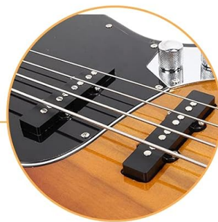
Two Single-Coil Pickups