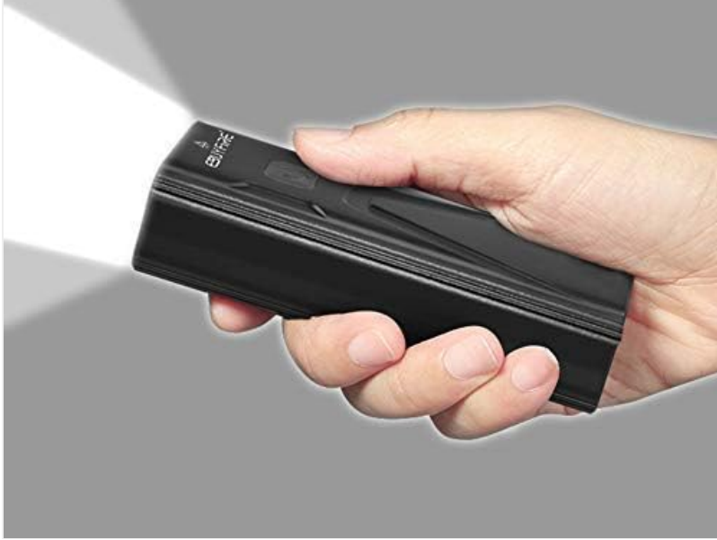
Image Description: This image shows the EBUYFIRE front bike light being held in a hand, illustrating its secondary function as a portable flashlight. The bright beam of light indicates its effectiveness for various non-cycling uses.