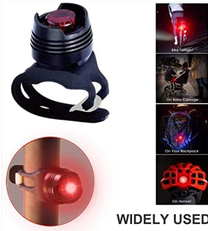
Image Description: This image displays the compact EBUYFIRE rear bike light and its flexible silicone strap. It visually demonstrates multiple ways to mount the taillight, including on a bicycle's seat post, a baby carriage, a backpack, and a helmet, highlighting its versatility.