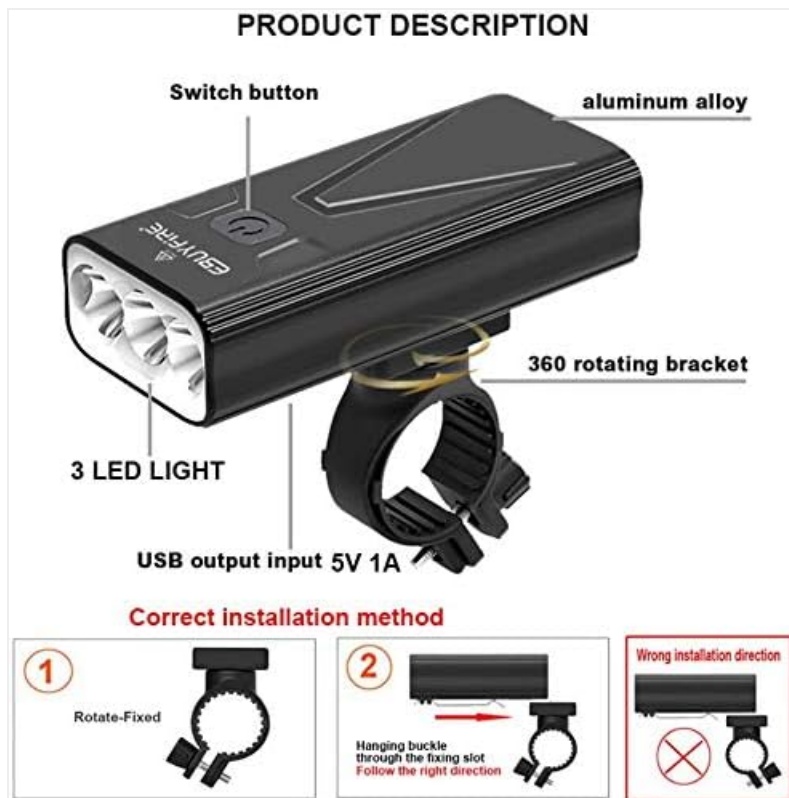
Image Description: This image illustrates the components of the EBUYFIRE front bike light, including the switch, 3 LEDs, USB port, and aluminum body. It also provides a visual guide for correctly installing the light onto the handlebar bracket, emphasizing the 360-degree rotation and secure attachment.