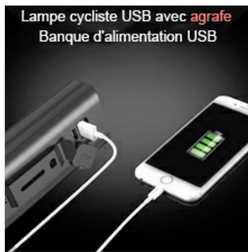
Image Description: This image shows a smartphone being charged by the EBUYFIRE front bike light via its USB output port, demonstrating the light's capability to act as a portable power bank.