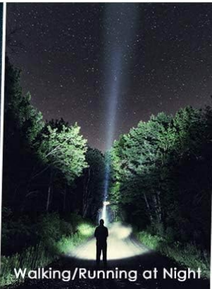
Walking/Running at Night