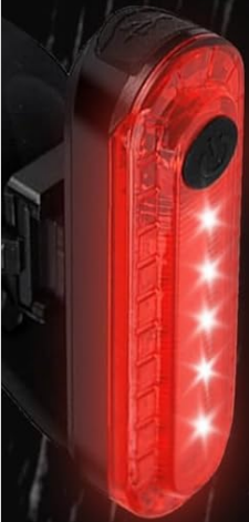
Figure 3: Headlight and Taillight Mode Options