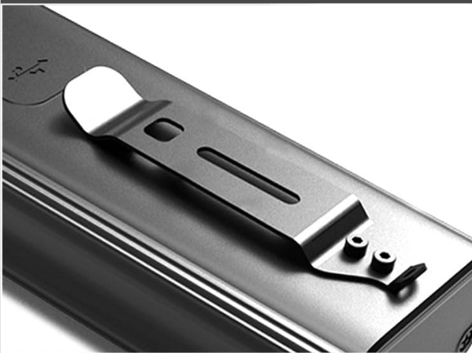
Stainless Steel Clip