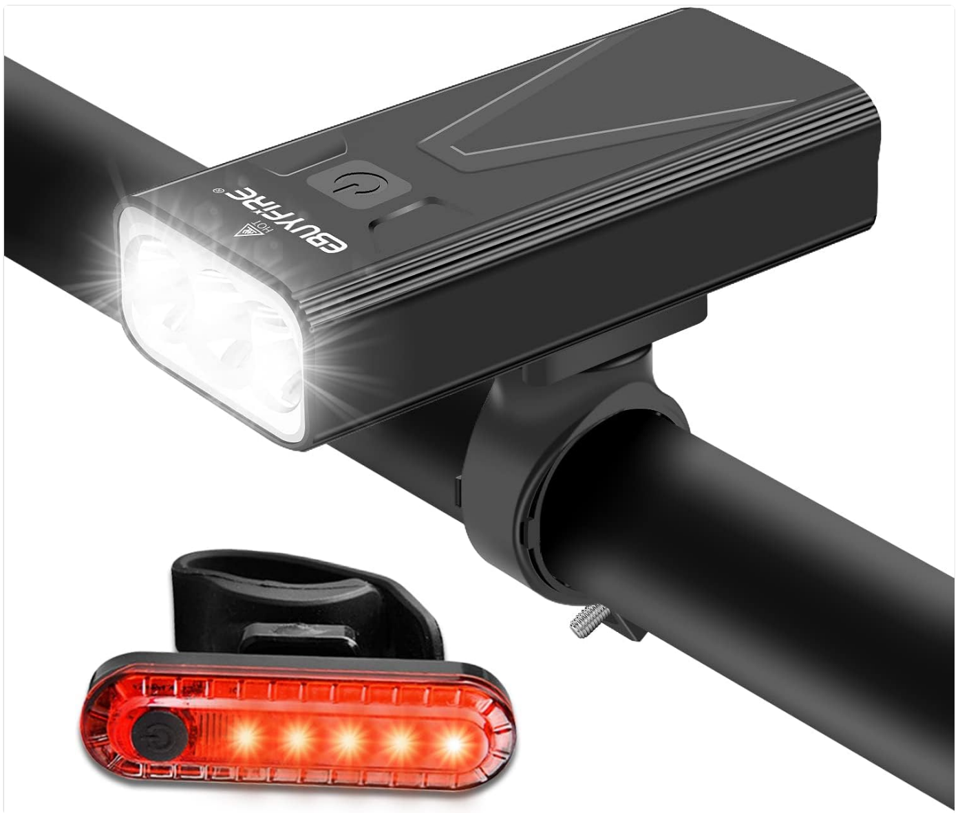
Figure 1: EBUYFIRE 3 LEDs Bike Lights Set