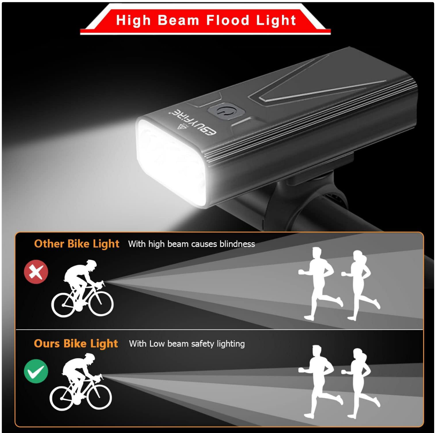
Figure 2: Key Features of the EBUYFIRE Headlight