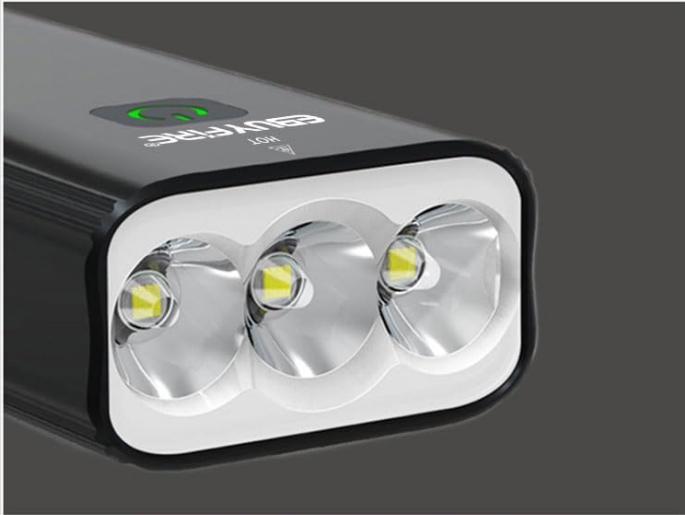
3LED Super Bright