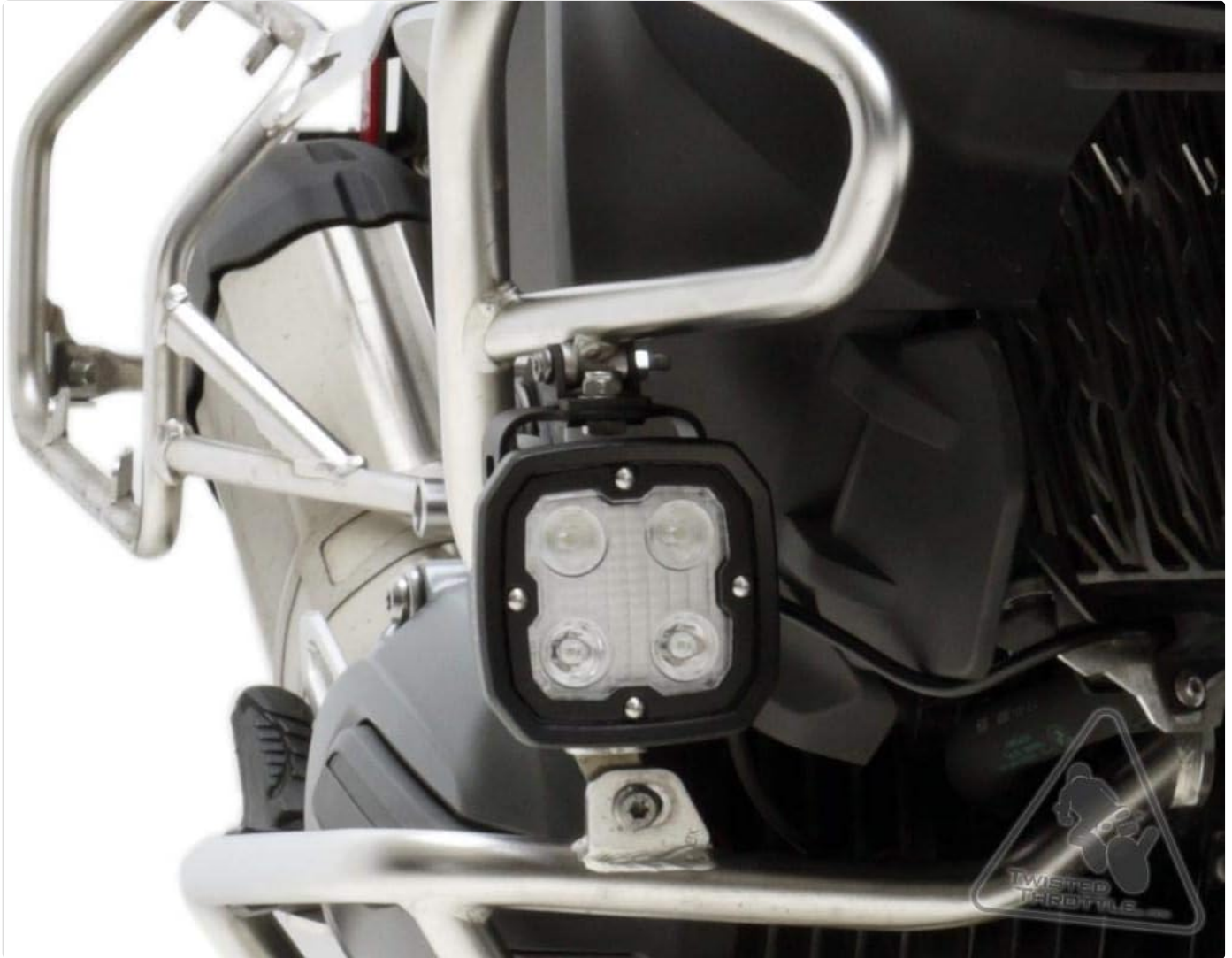
Image: The DENALI Driving Light Mount Adapter shown installed on a BMW motorcycle's crash bar, with a square-shaped driving light securely attached. This illustrates the typical mounting position and appearance of the adapter in use.