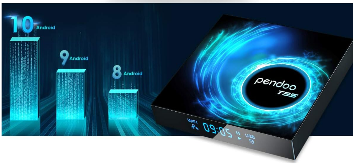
Image: The Pendoo T95's home screen, showcasing the Android 10.0 operating system and pre-installed applications for streaming and entertainment.