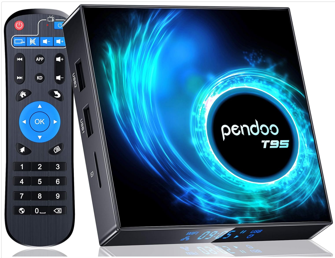
Image: The Pendoo T95 Android TV Box and its accompanying remote control, showcasing the main unit and its primary input device.