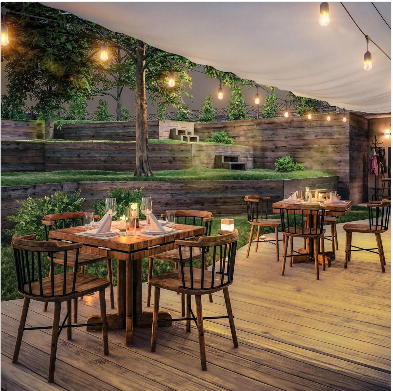
Figure 6.2: An example of the Volteck SL-7L LED String Lights illuminating an outdoor patio area, demonstrating their aesthetic effect.