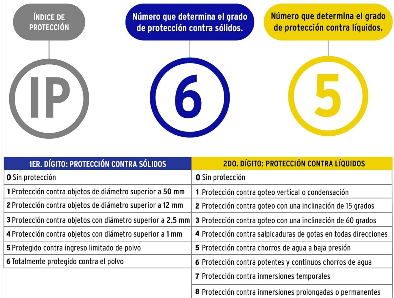
Figure 5.1: Explanation of the IP65 protection rating. The first digit '6' indicates total protection against dust. The second digit '5' indicates protection against low-pressure water jets from any direction.