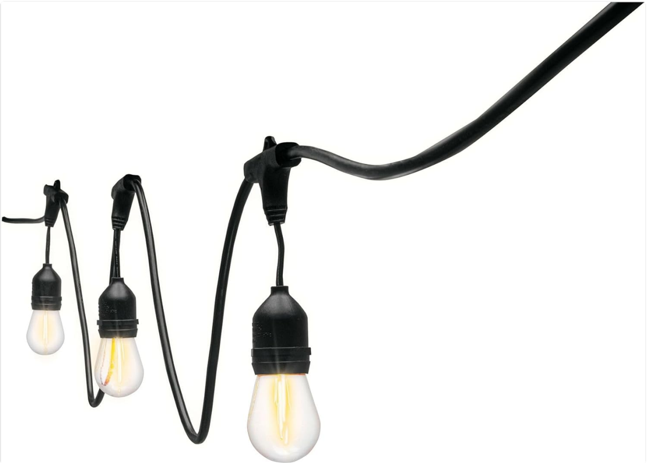
Figure 6.1: The Volteck SL-7L LED String Lights installed, showcasing the design and bulb appearance.