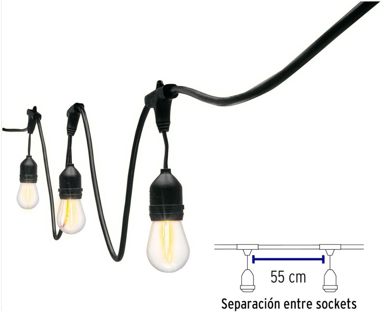
Figure 4.2: Dimensions of the Volteck SL-7L LED String Lights. The total length is 7.3 meters, with a separation of 55 cm between each socket.