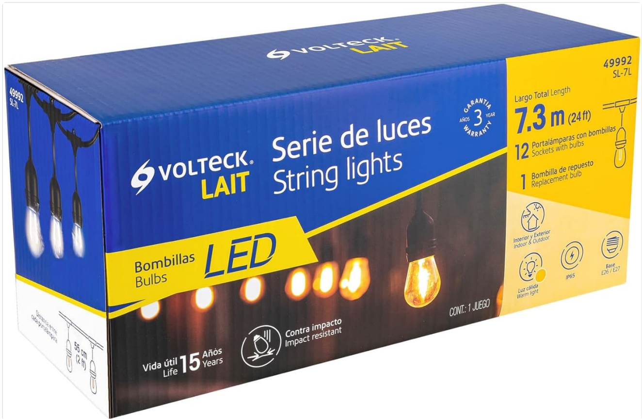
Figure 3.1: Packaging of the Volteck SL-7L LED String Lights. The box displays key features such as 7.3m length, 12 sockets, LED bulbs, and a 3-year warranty.