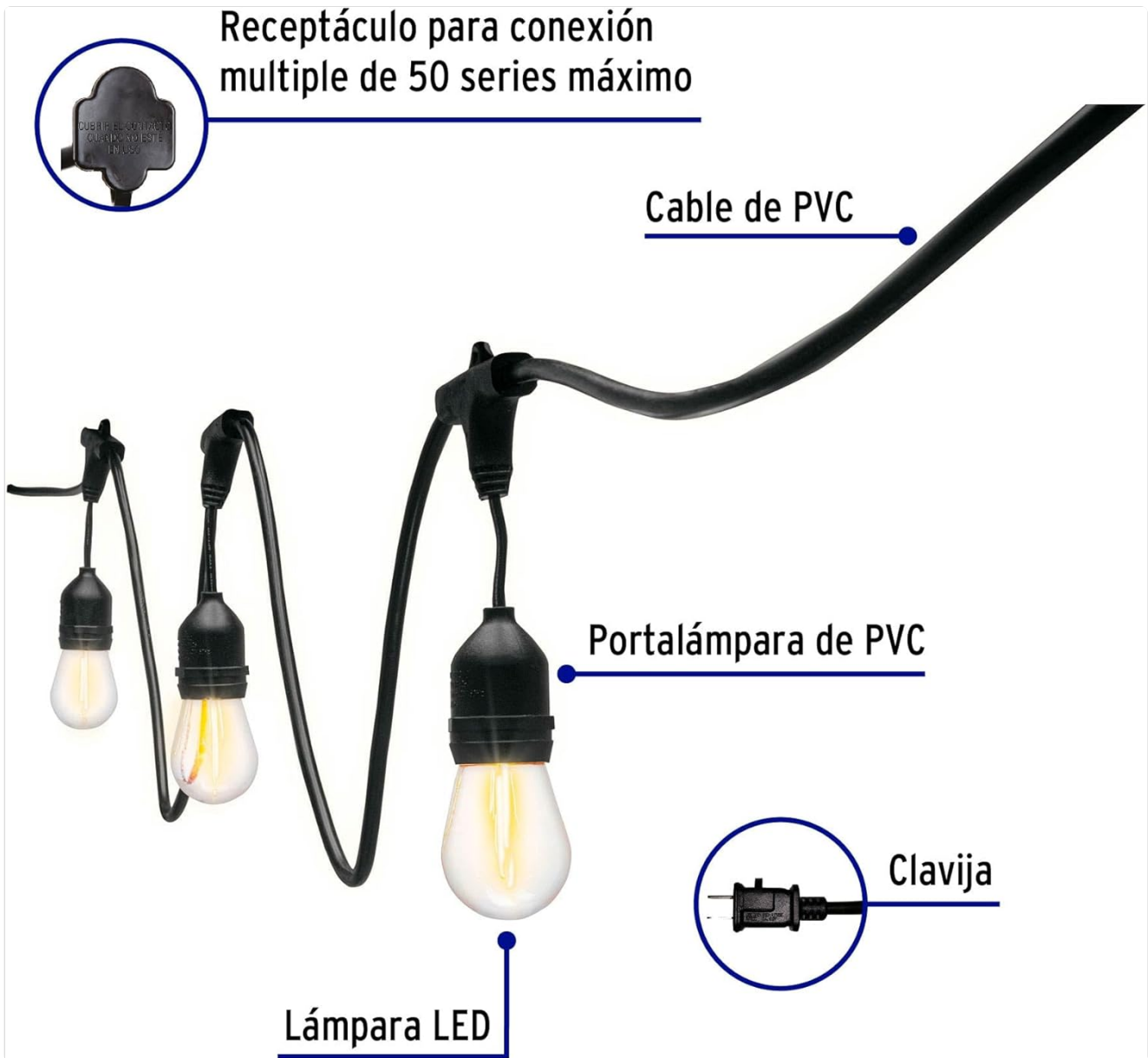
Figure 4.1: Labeled components of the Volteck SL-7L LED String Lights. This image shows the PVC cable, PVC lamp holders, LED lamps, the main plug, and a receptacle for connecting multiple series (up to 50 maximum).