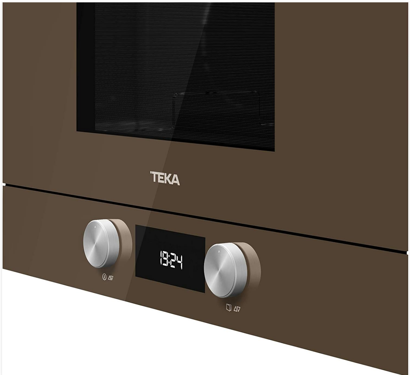
Figure 3.3: Detailed view of the control panel, showing the digital time display and the two rotary knobs for setting functions and time.