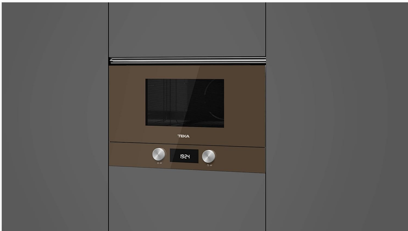
Figure 3.4: The microwave oven seamlessly integrated into a kitchen cabinet, demonstrating its built-in design.