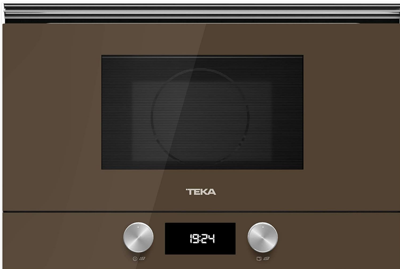
Figure 3.1: Front view of the Teka ML 8220 Bis L-Lb Microwave Oven, showcasing its brown finish and digital display with two control knobs.