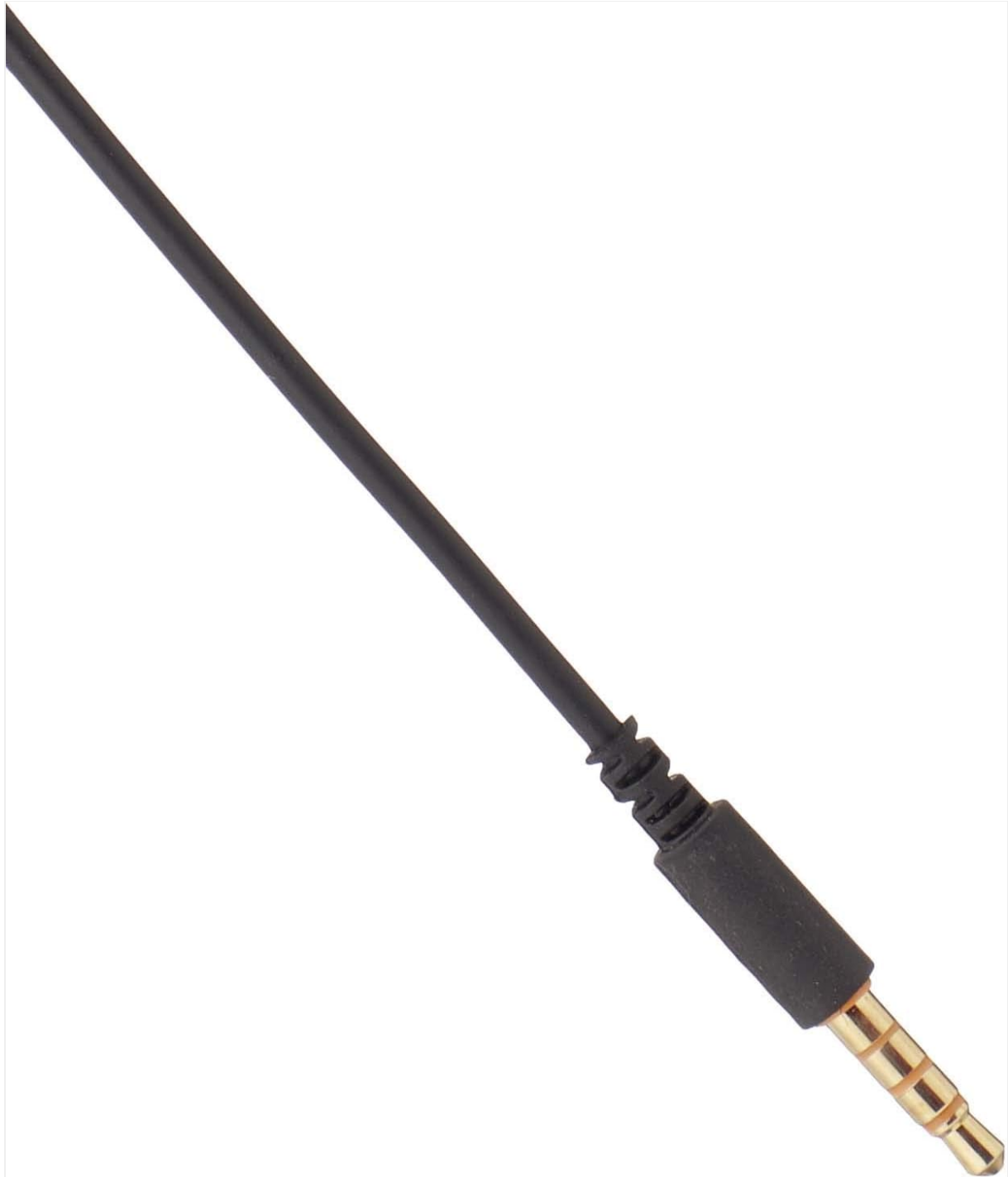
Figure 3: 3.5mm Audio Jack. A close-up view of the standard 3.5mm connector used to plug the headphones into compatible audio devices.