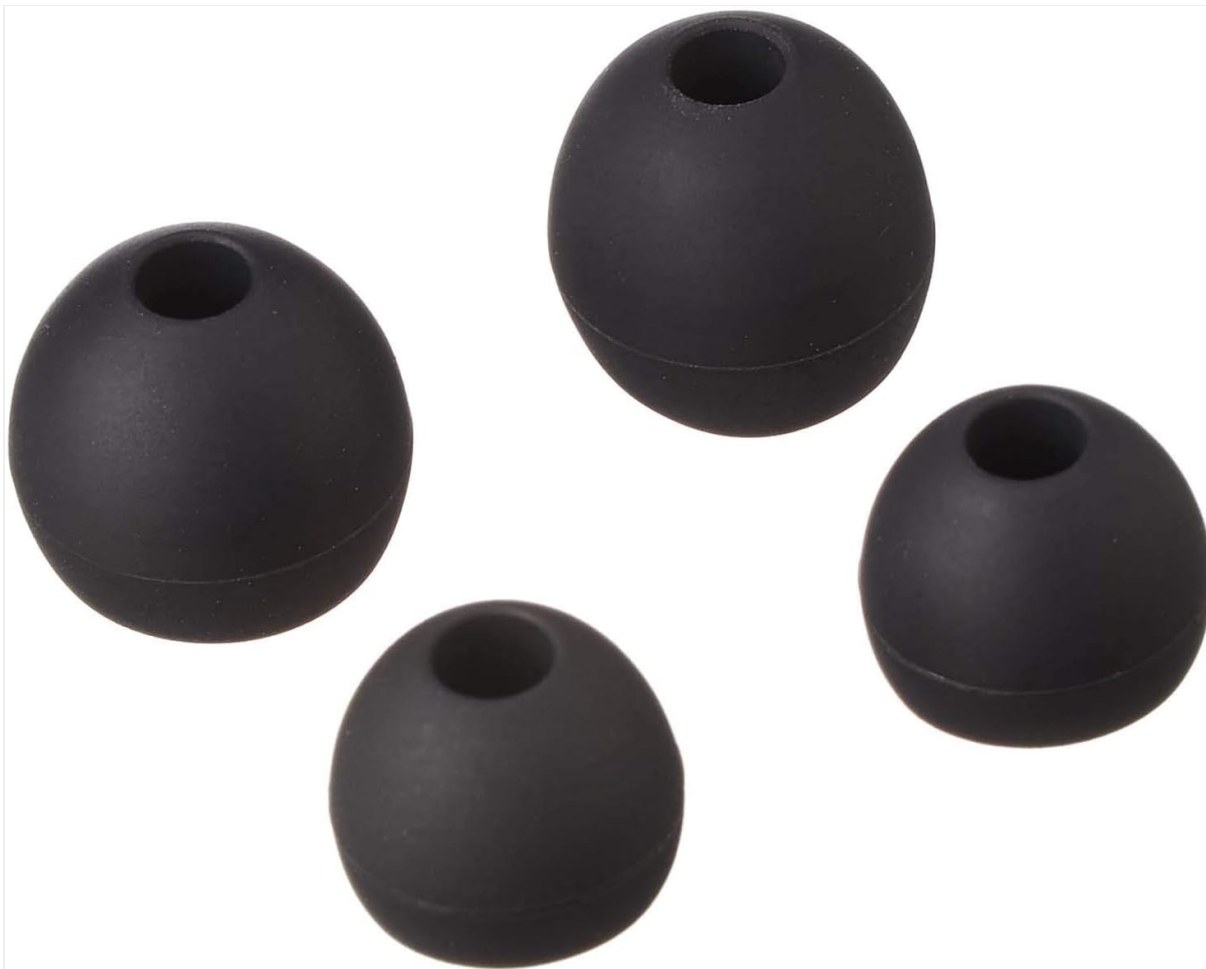
Figure 4: Replacement Ear Cushions. This image displays the various sizes of silicone ear cushions provided for a comfortable and secure fit.