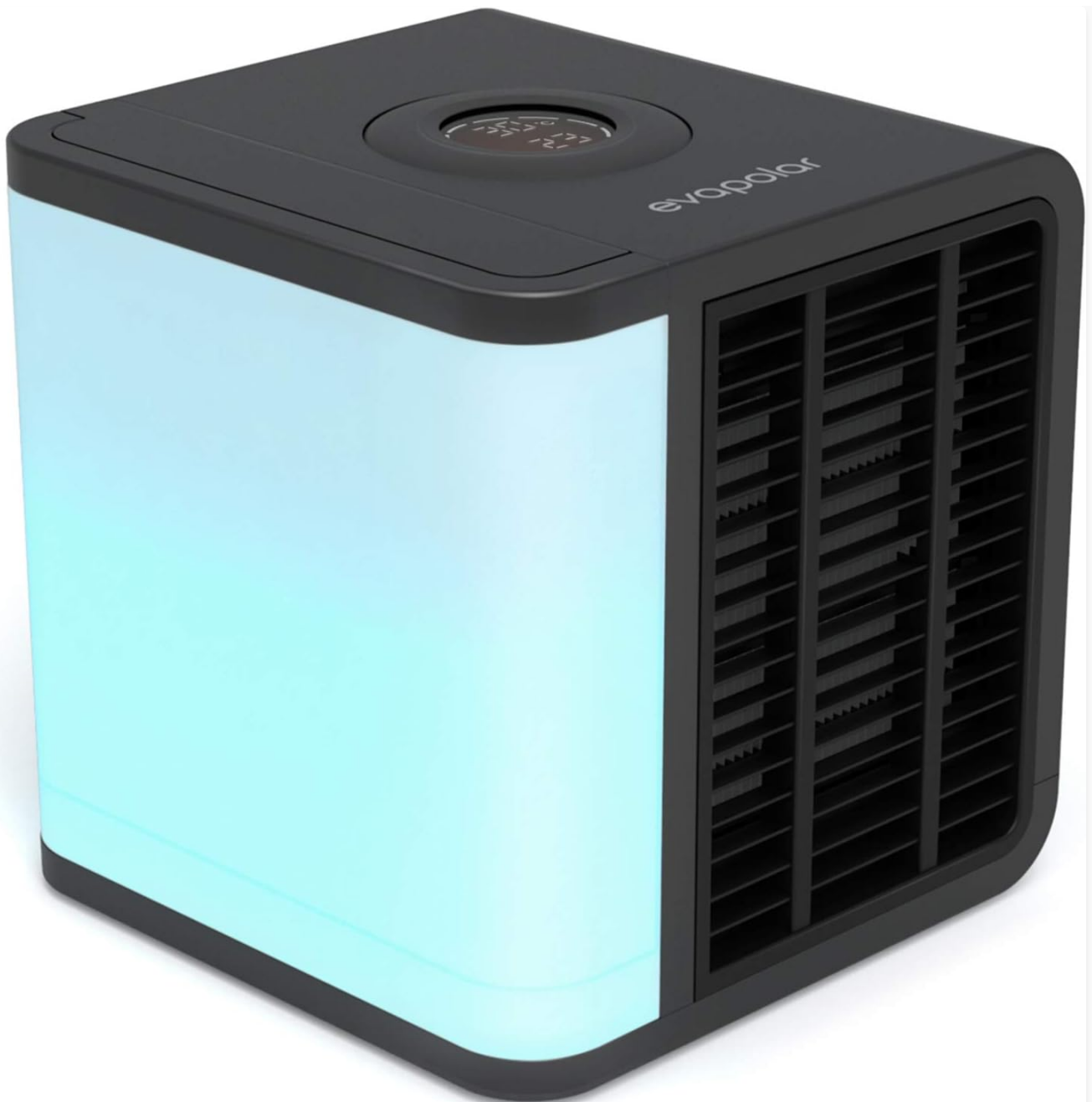
Figure 1: Evapolar evaLIGHT Plus Personal Air Cooler