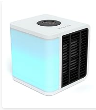
Figure 2: Quick Setup Steps