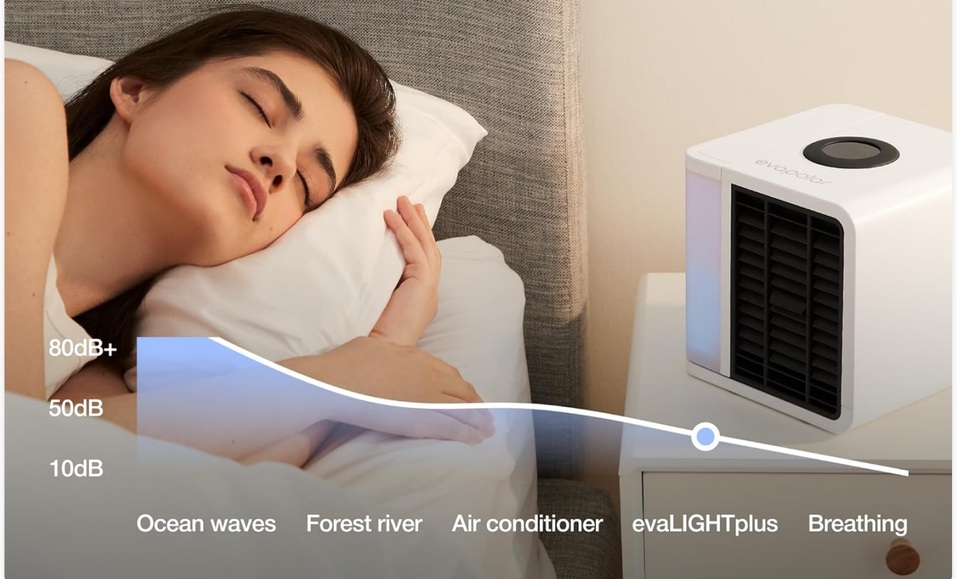
Figure 4: Quiet Operation for Restful Sleep