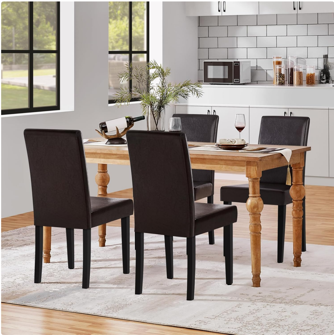
Image: Yaheetech dining chairs arranged around a dining table, illustrating their integration into a home environment.