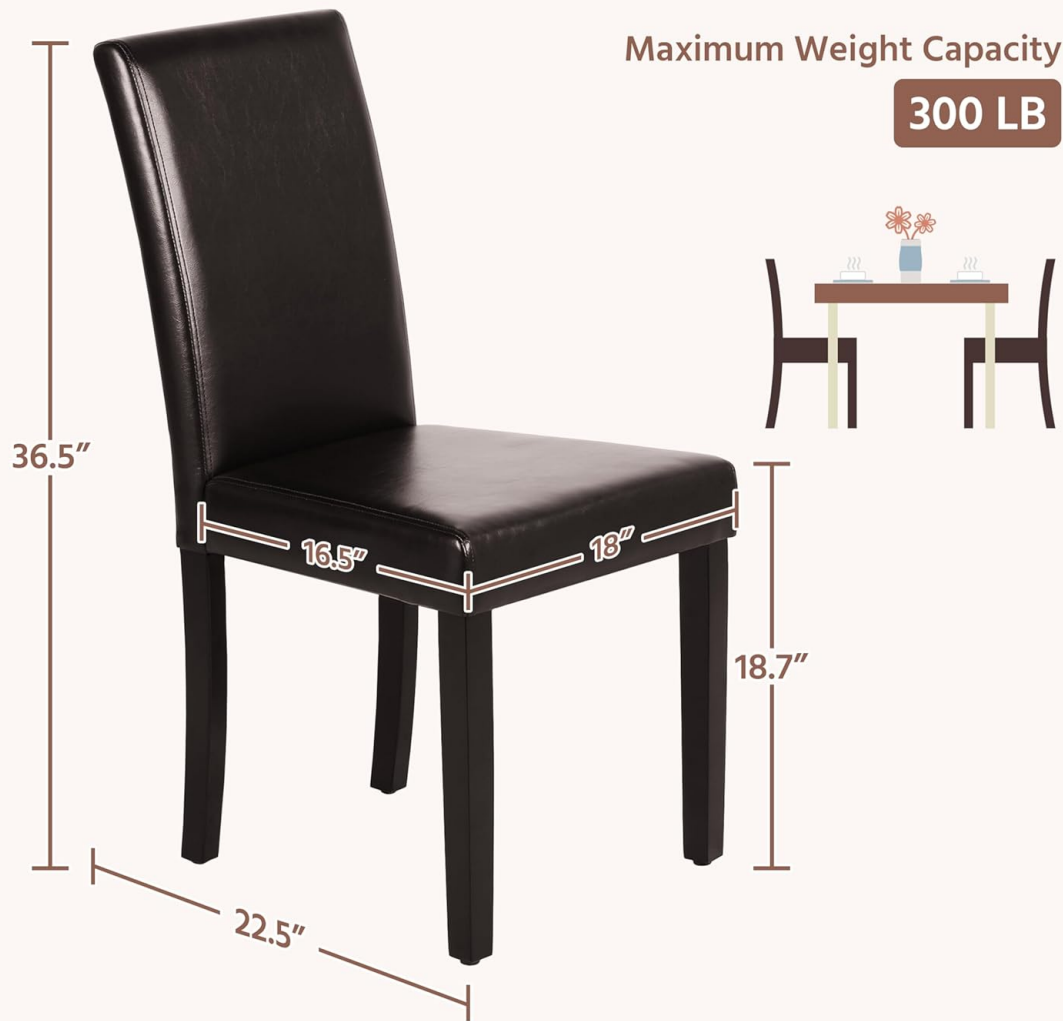
Image: Product dimensions and maximum weight capacity, useful for assembly and placement.