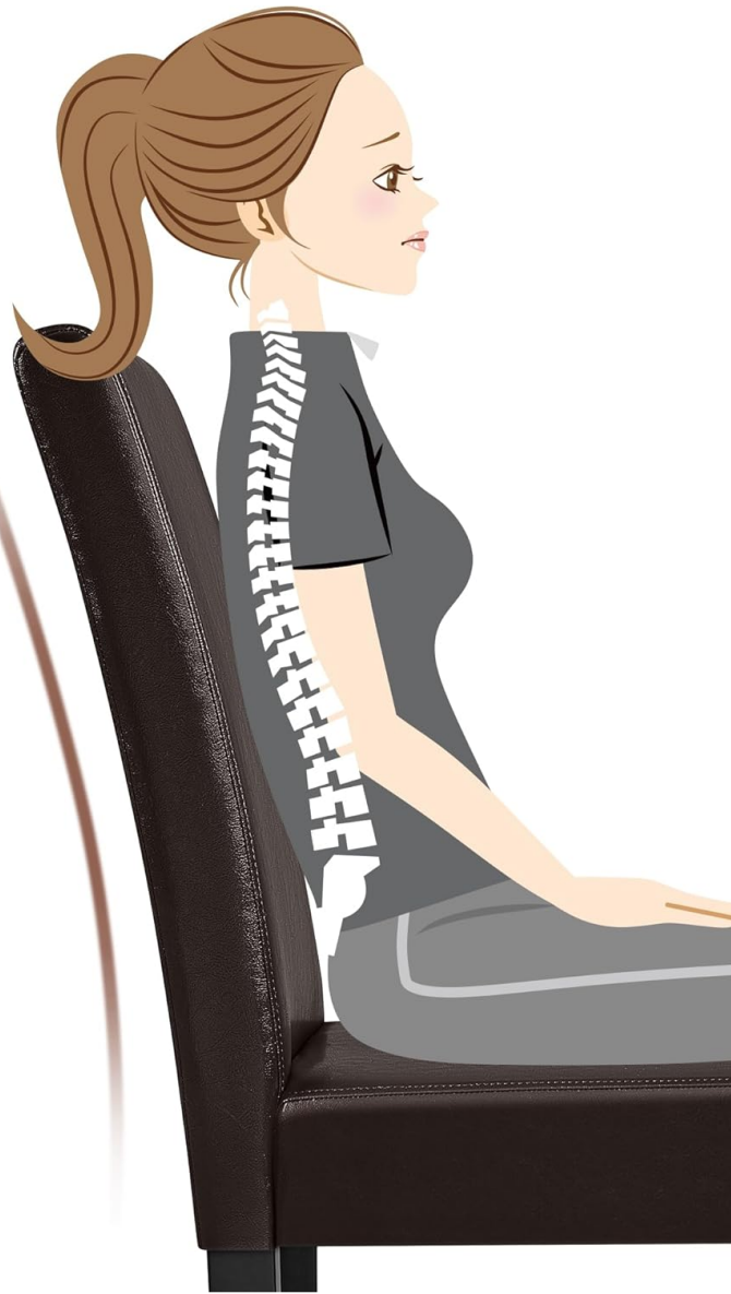
Image: Illustration demonstrating the ergonomic high-back design, emphasizing comfort and support for the user's back.

Ergonomic backrest ensures lasting comfort