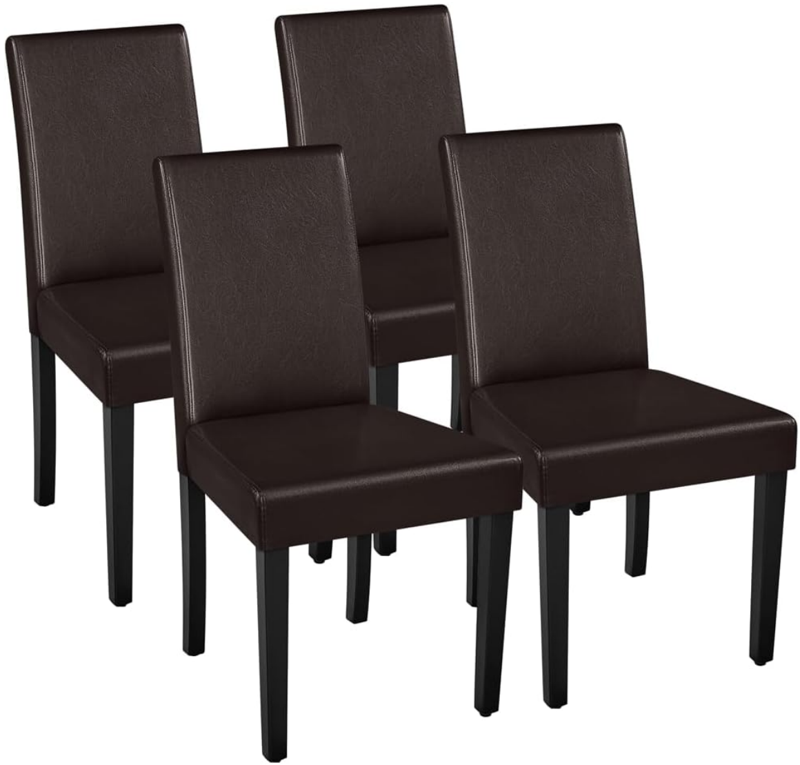
Image: A complete set of four Yaheetech dining chairs in dark brown, showcasing their sleek design.