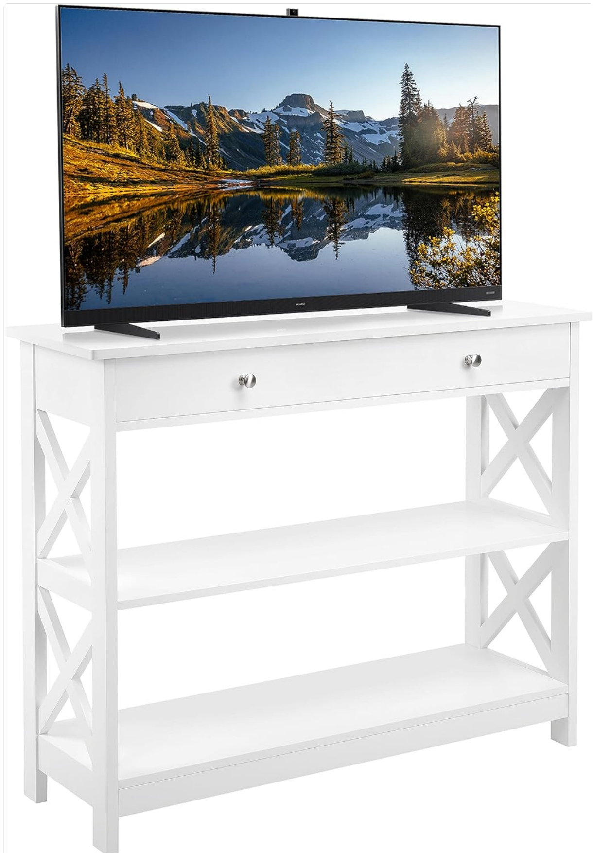
Figure 1: Yaheetech TV Stand with a television on top, showcasing its primary function as a media console.