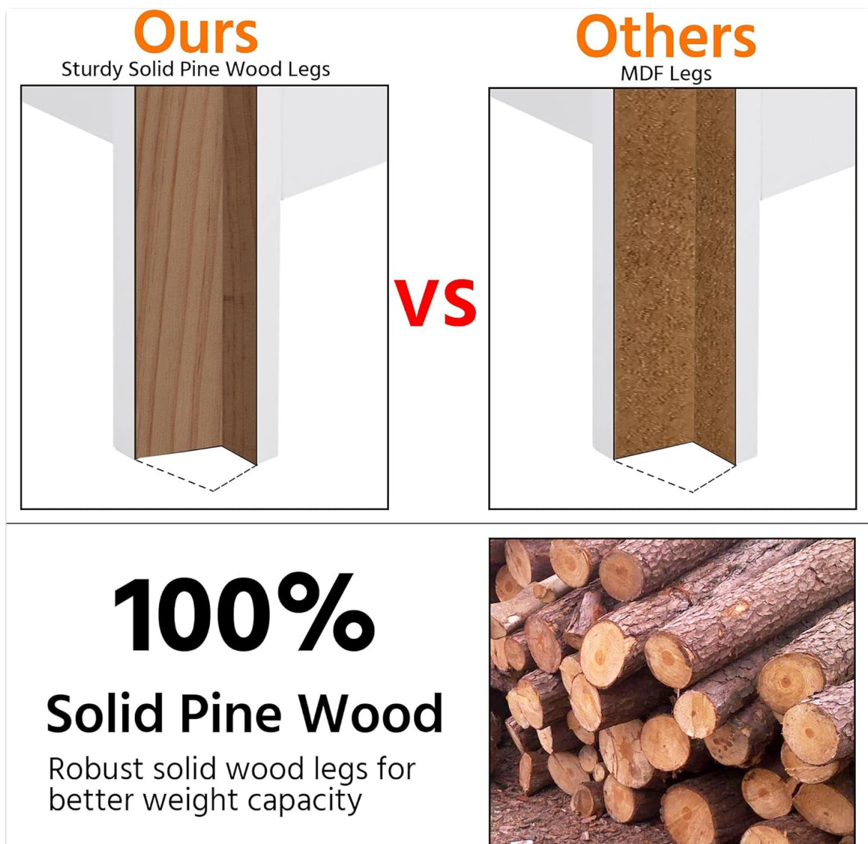
Figure 6: Visual comparison emphasizing the use of 100% solid pine wood for robust legs, contributing to better weight capacity and durability.