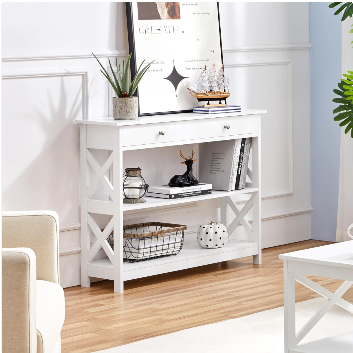
Figure 4: The TV stand functioning as a versatile console table, demonstrating its adaptability in different home environments.