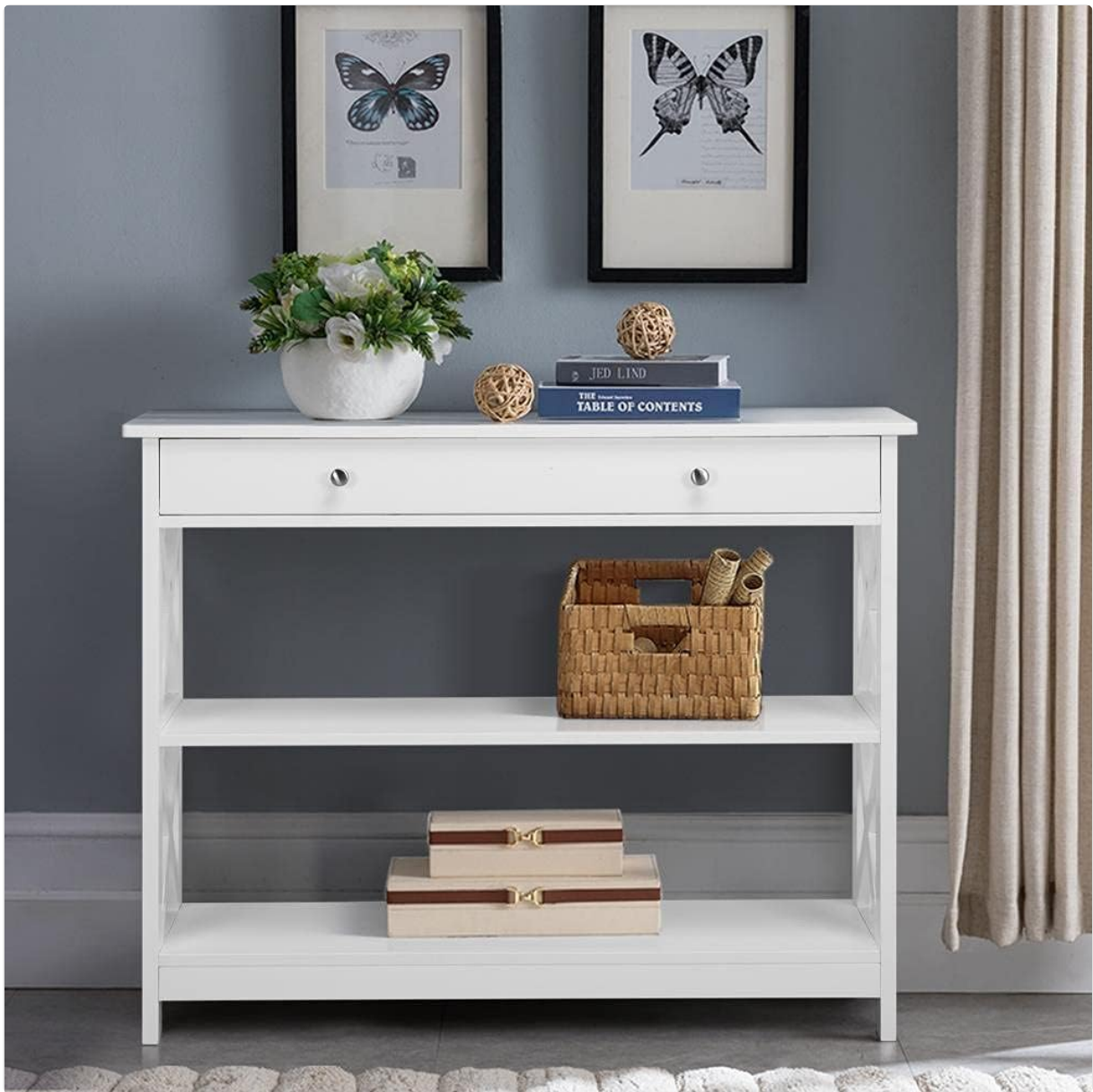
Figure 3: Detailed view of key components, including the smooth, protective corners, elegant metal drawer pulls, and the robust X-shaped side panels, highlighting the quality of construction.