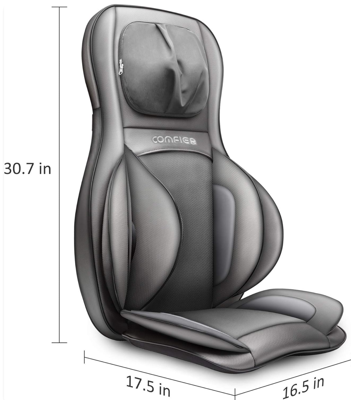
Figure 10: Key dimensions of the massager for proper fit and placement.