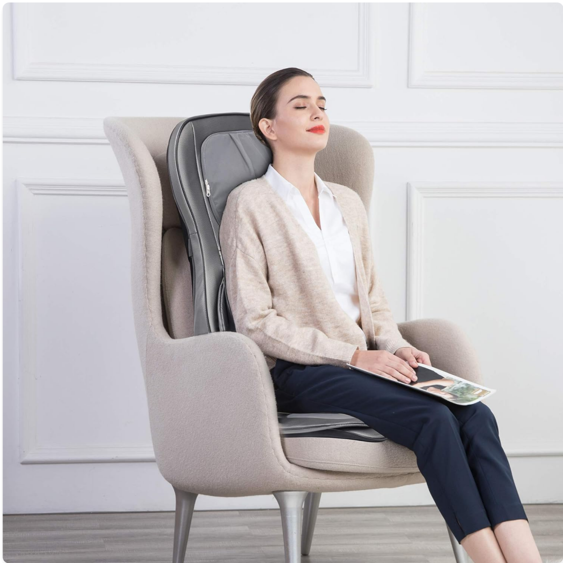
Figure 8: The massager is versatile and can be used on various types of chairs for ultimate comfort.