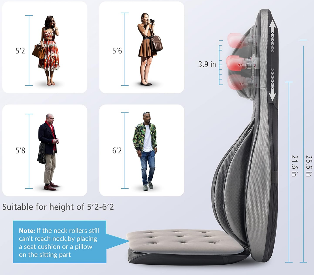
Figure 7: The neck massage nodes are adjustable to accommodate users of different heights.

Is suitable for Women/ Men of different Heights