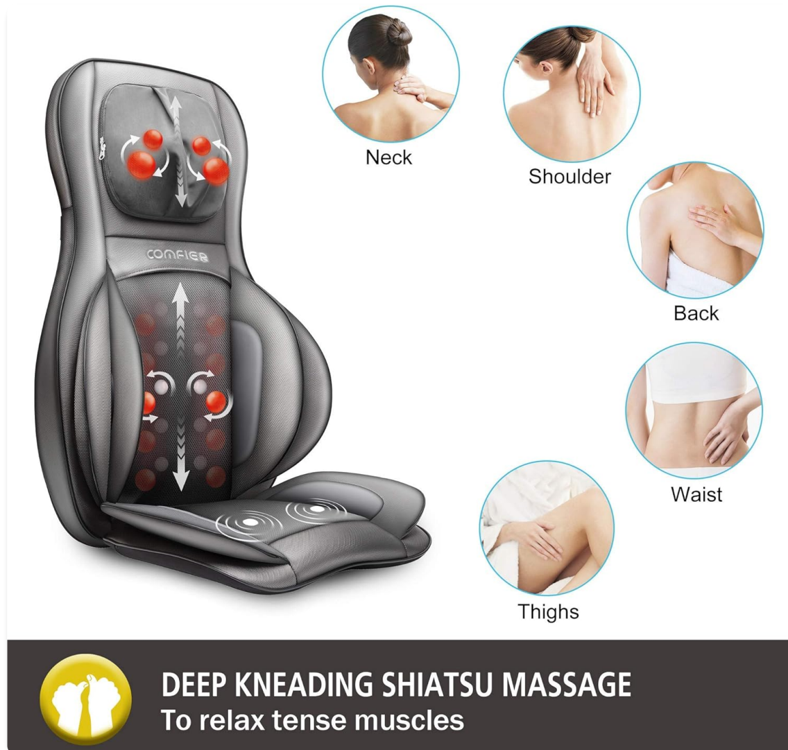
Figure 4: Deep kneading Shiatsu massage targets various body parts for muscle relaxation.