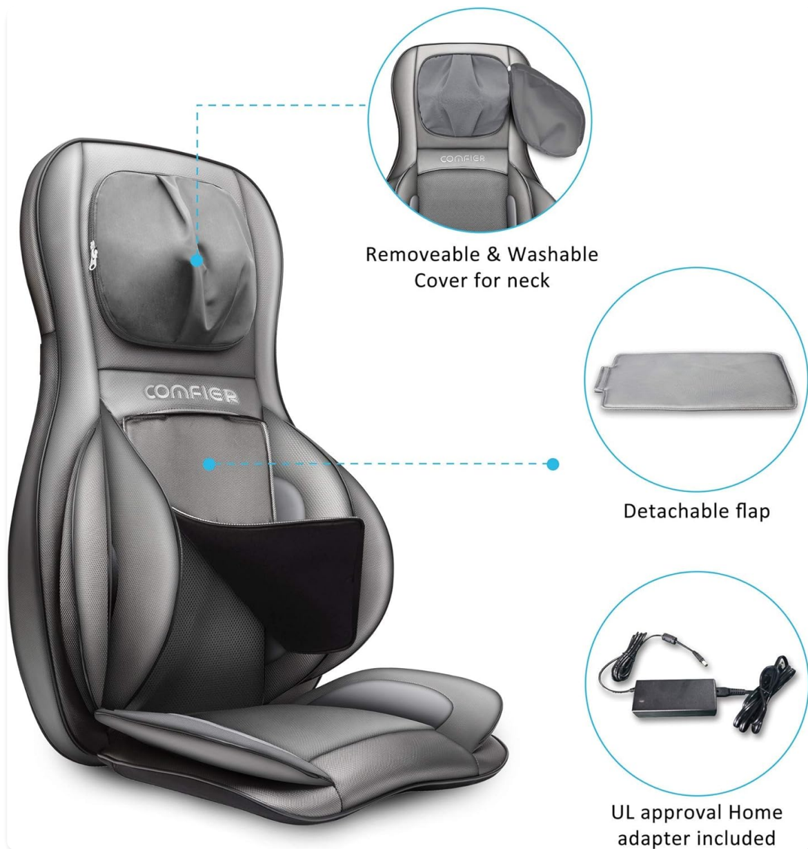
Figure 2: Key components including the removable neck cover, detachable back flap, and UL approved home adapter.