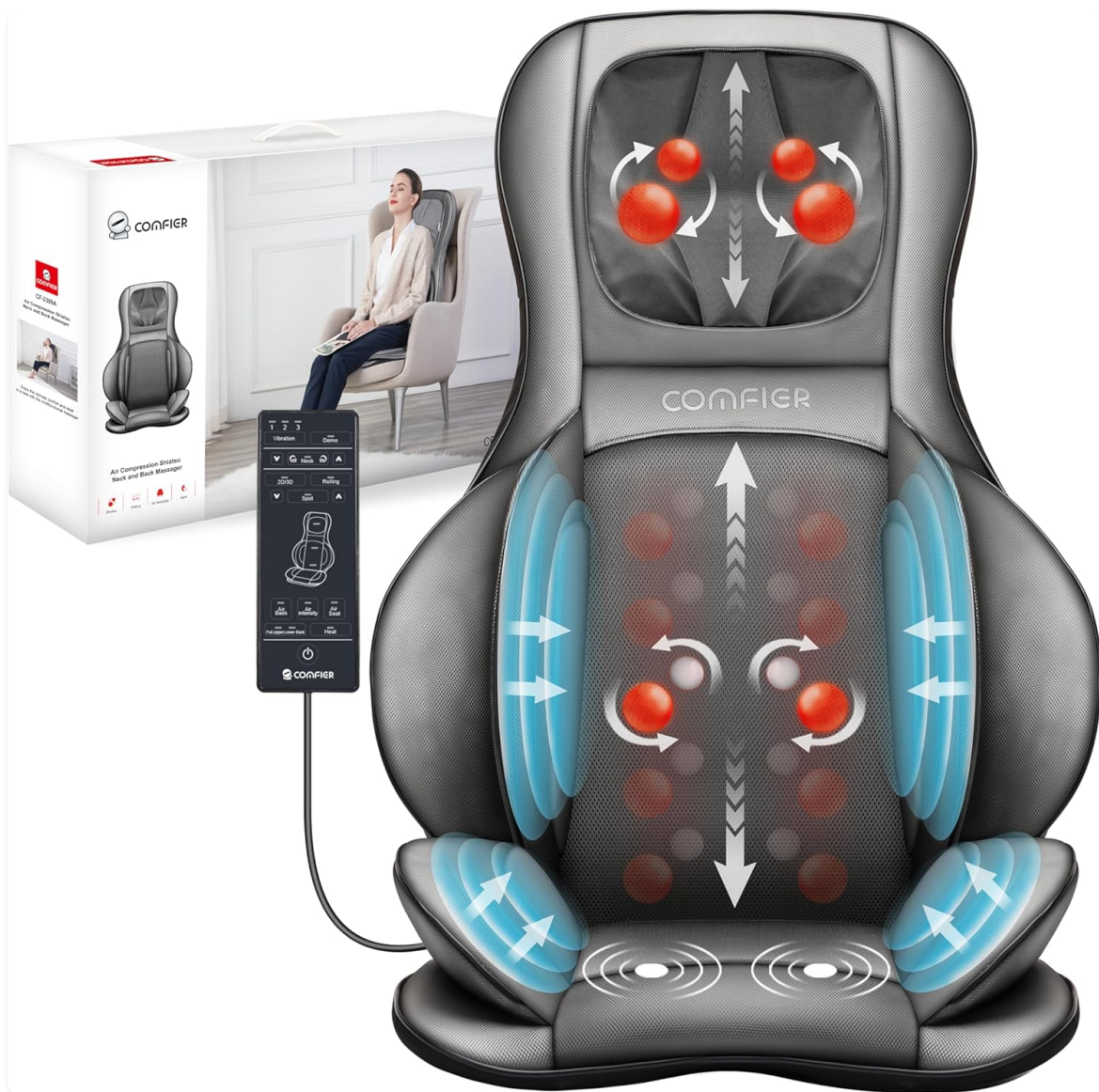
Figure 1: The COMFIER Shiatsu Neck & Back Massager with its remote control and packaging.