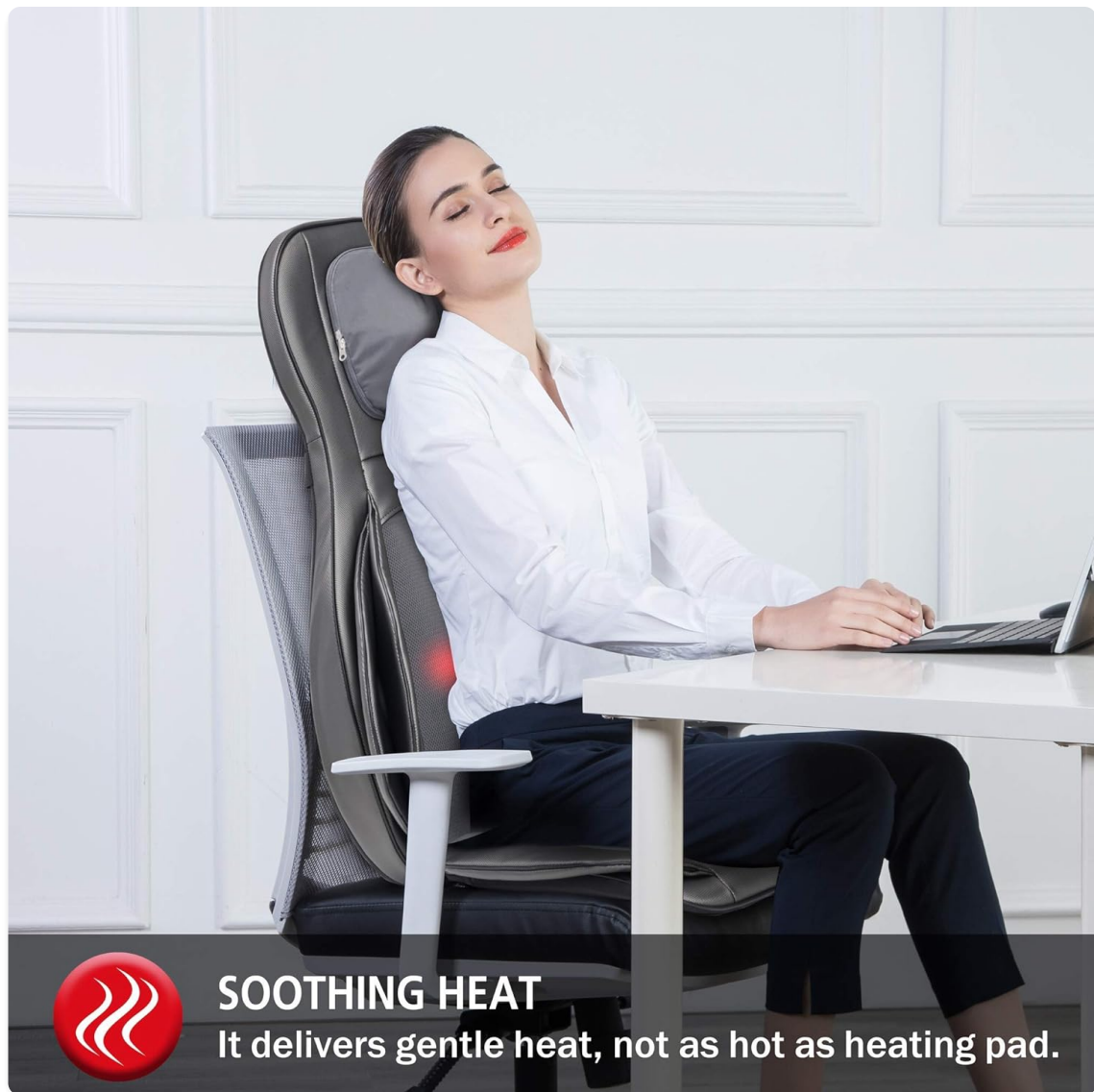
Figure 6: The soothing heat function helps to relax muscles in the back.