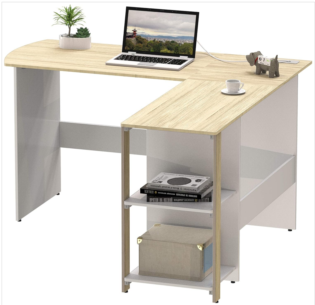
Figure 3: Desk with items on shelves, demonstrating storage capacity.