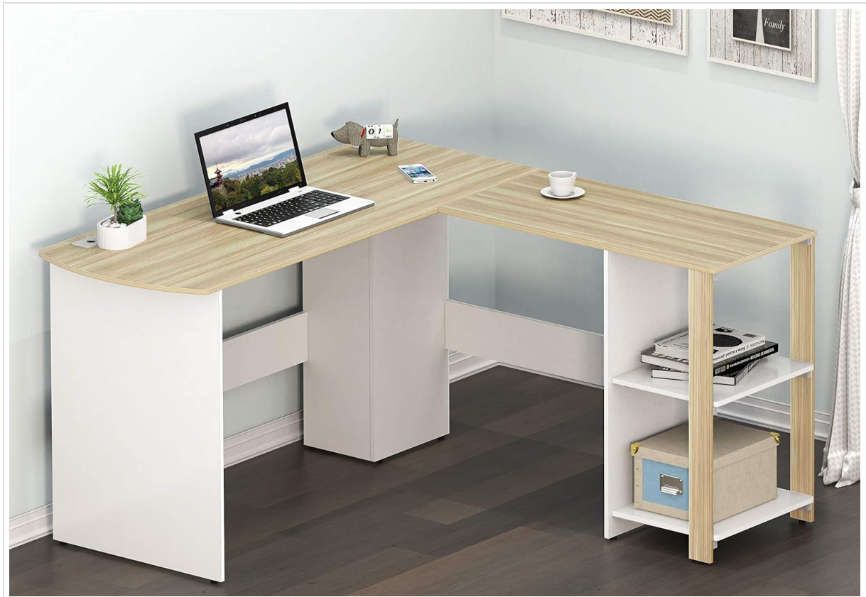
Figure 1: SHW L-Shaped Home Office Wood Corner Desk (Oak finish)

This manual provides detailed instructions for the assembly, operation, and maintenance of your SHW 51 x 51 Inches L-Shaped Home Office Wood Corner Desk. Please read all instructions carefully before beginning assembly and retain this manual for future reference.