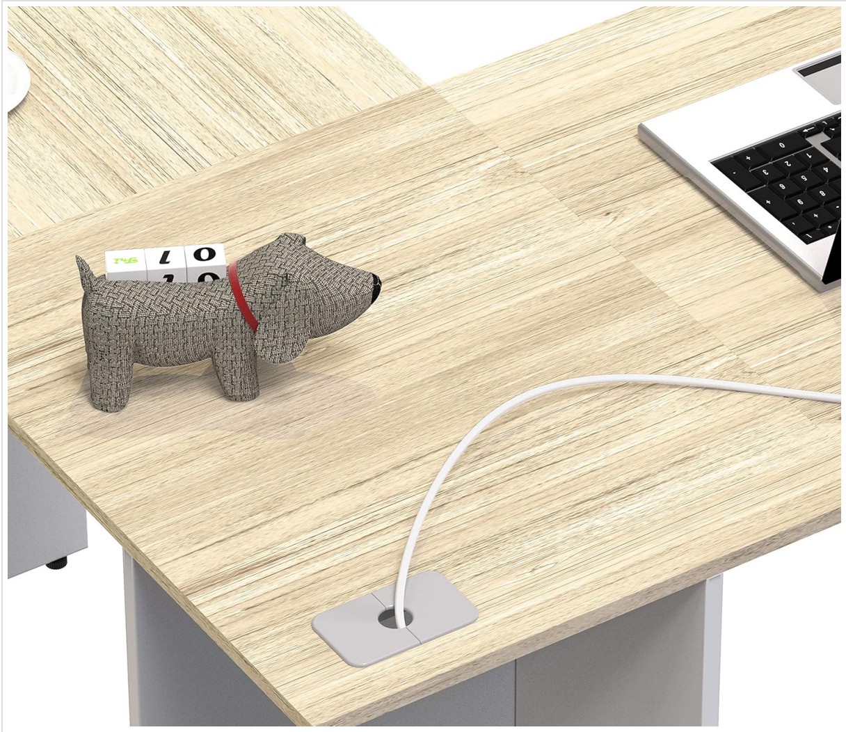
Figure 4: Detail of the cable management grommet.