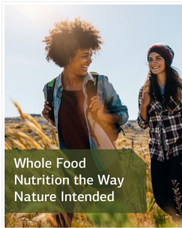
This image highlights Standard Process as a family-owned company with a certified organic farm.

Whole Food Nutrition the Way Nature Intended