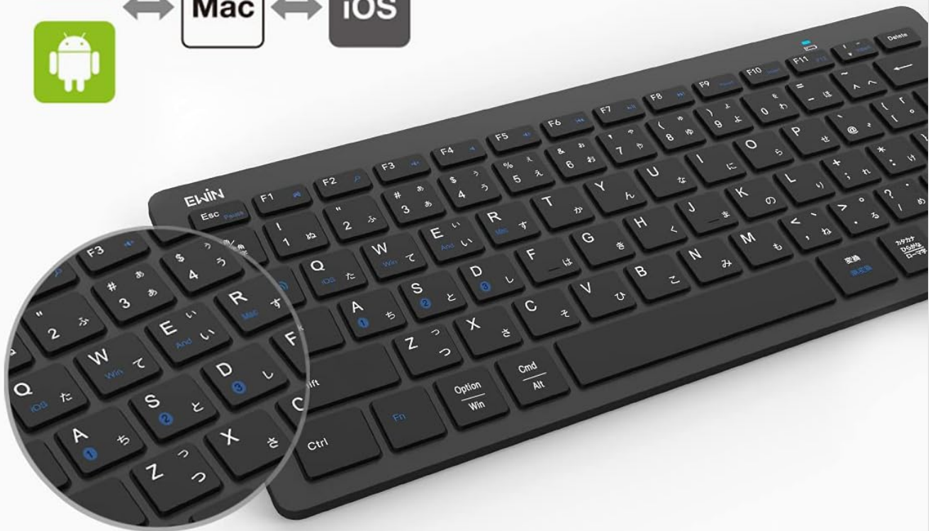
Image: The Ewin keyboard with indicators for Windows, Mac, and iOS, showing its multi-OS compatibility.