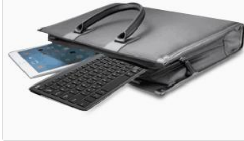
Image: The compact and lightweight Ewin keyboard shown with a tablet, emphasizing its portability.