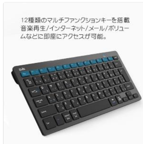
Image: The Ewin keyboard displaying its 12 multi-function keys, which provide quick access to various controls when used with the Fn key.