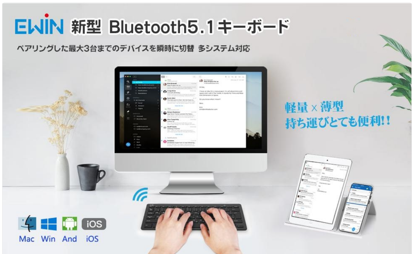
Image: Comparison highlighting the Ewin keyboard's features like multi-system support, multi-pairing, JIS Japanese layout, and Bluetooth 5.1.

Thank you for purchasing the Ewin Wireless Bluetooth Keyboard EW-B009. This compact and lightweight keyboard is designed for multi-system compatibility, allowing seamless switching between up to three devices. It features a JIS Japanese layout and a comfortable pantograph key mechanism, making it ideal for various computing tasks.