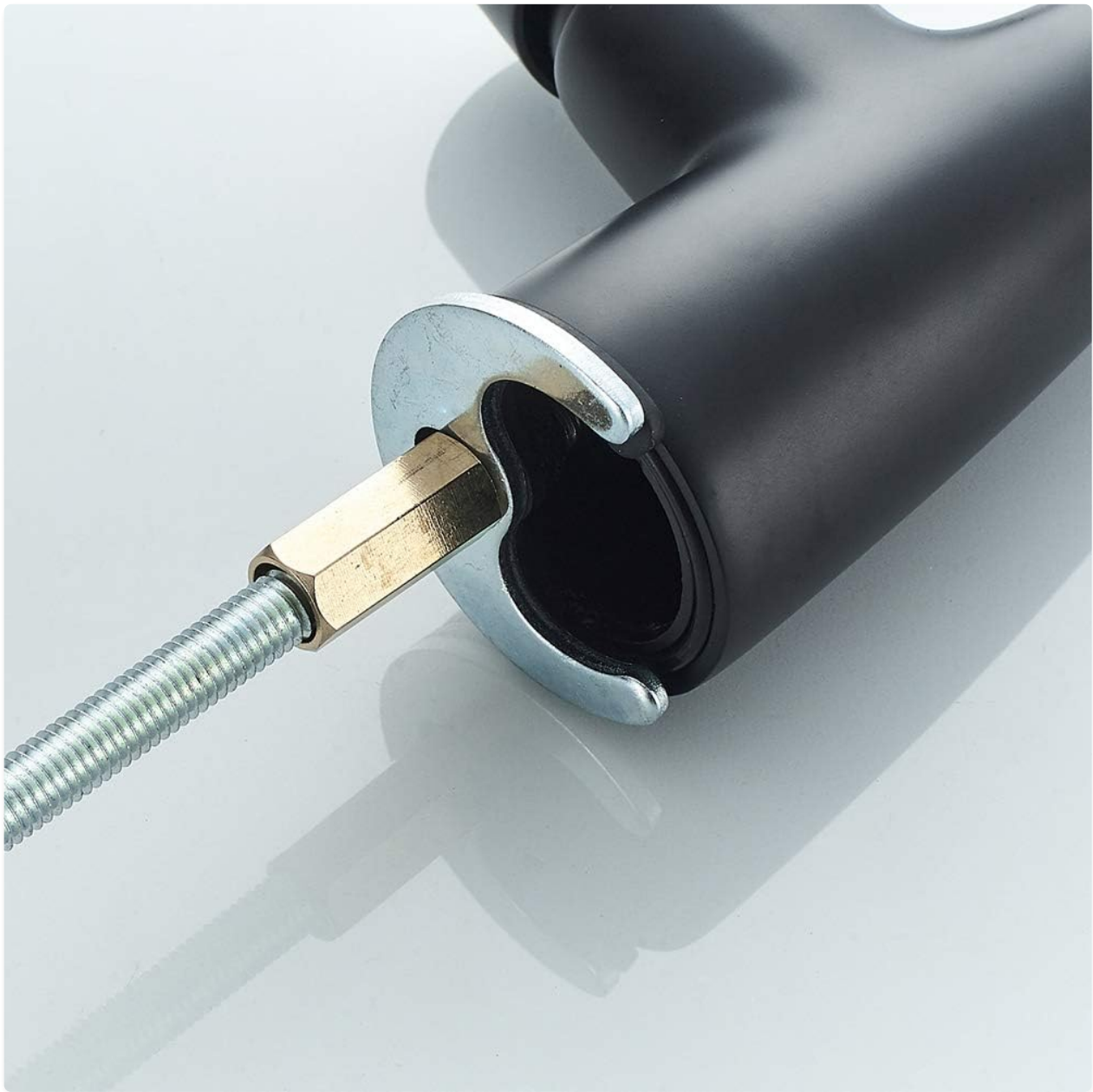
The base of the Ibergriif M14026B tap, showing the threaded rod and mounting plate for secure installation.