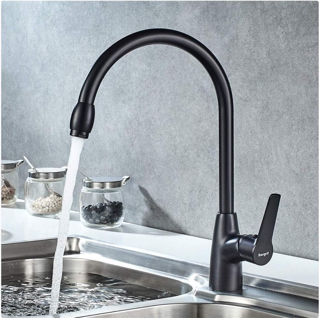
The Ibergriif M14026B kitchen tap shown in an installed setting, demonstrating water flow into a sink.