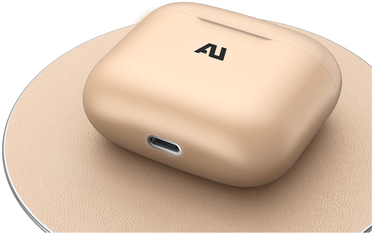
Image: The Ausounds AU-Stream charging case resting on a wireless charging pad, illustrating its wireless charging capability.

Rapid 1.5 hours wireless charging case with total battery life 20 hours