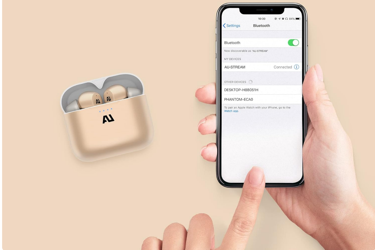
Image: A smartphone displaying a successful Bluetooth connection to the 'AU-STREAM' device, with the charging case and earbuds nearby.

(Bluetooth Receiver May Require for Desktop PC)