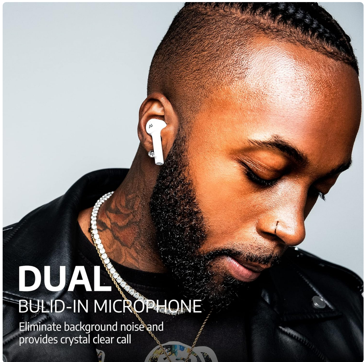
Image: Man wearing white Ausounds AU-Stream earbuds, emphasizing the dual built-in microphone for clear calls.