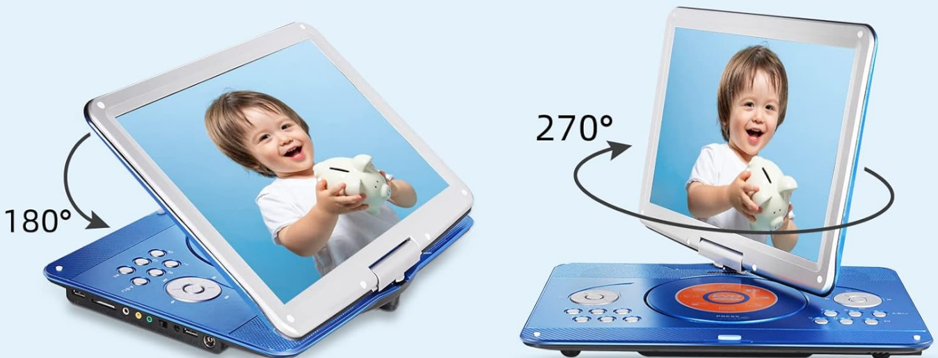
Image: Visual demonstration of the screen's flexibility, illustrating its 270-degree swivel and 180-degree flip capabilities for versatile viewing.