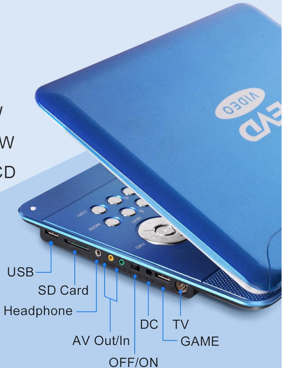
Image: A detailed view of the side ports on the Jekero Portable DVD Player, including USB, SD card slot, headphone jack, AV input/output, DC power input, TV output, and game controller port.