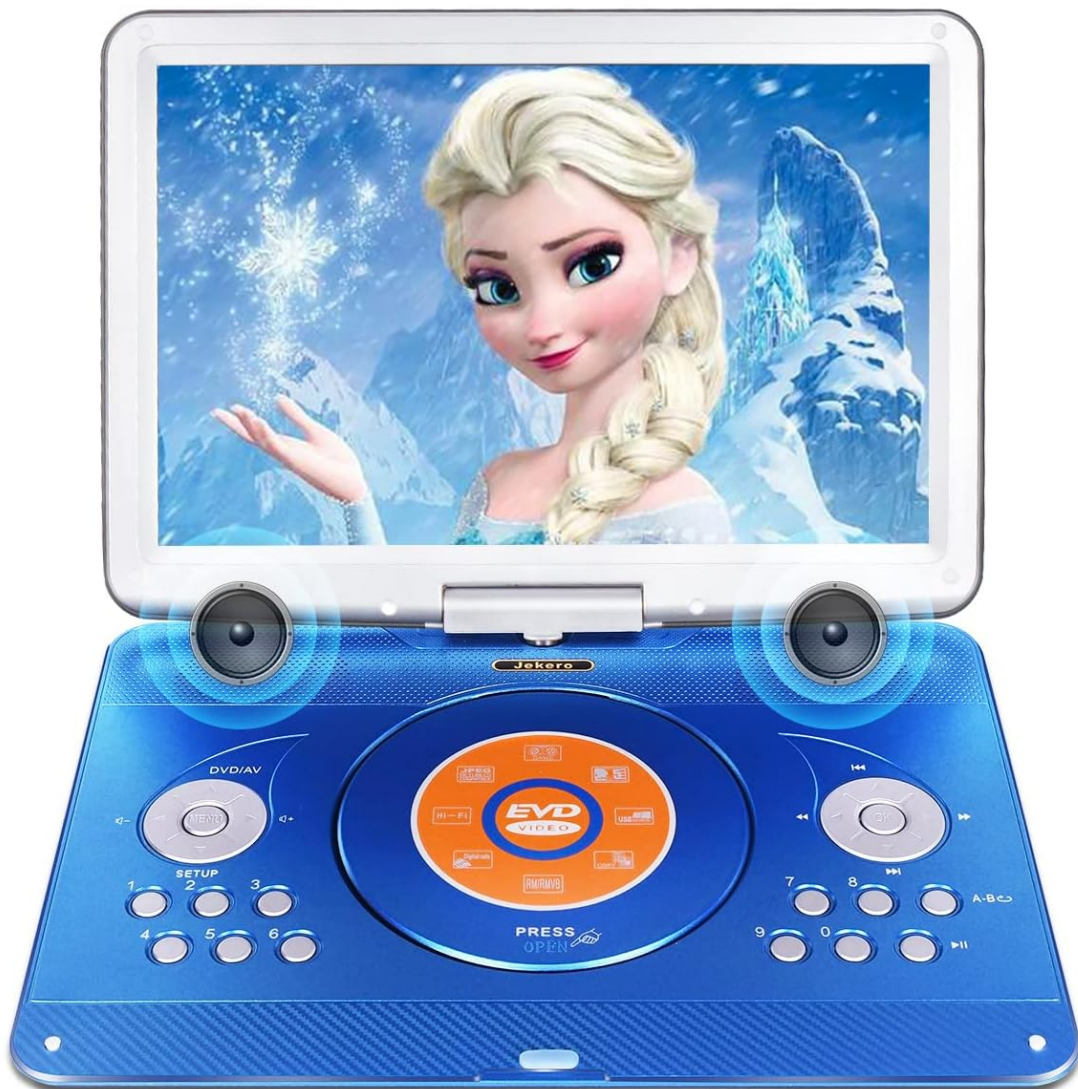
Image: The Jekero Portable DVD Player highlighting its dual 3-inch speakers, which provide enhanced audio. The screen displays a scene from a popular animated movie.

Two speakers make the volume louder and clearer