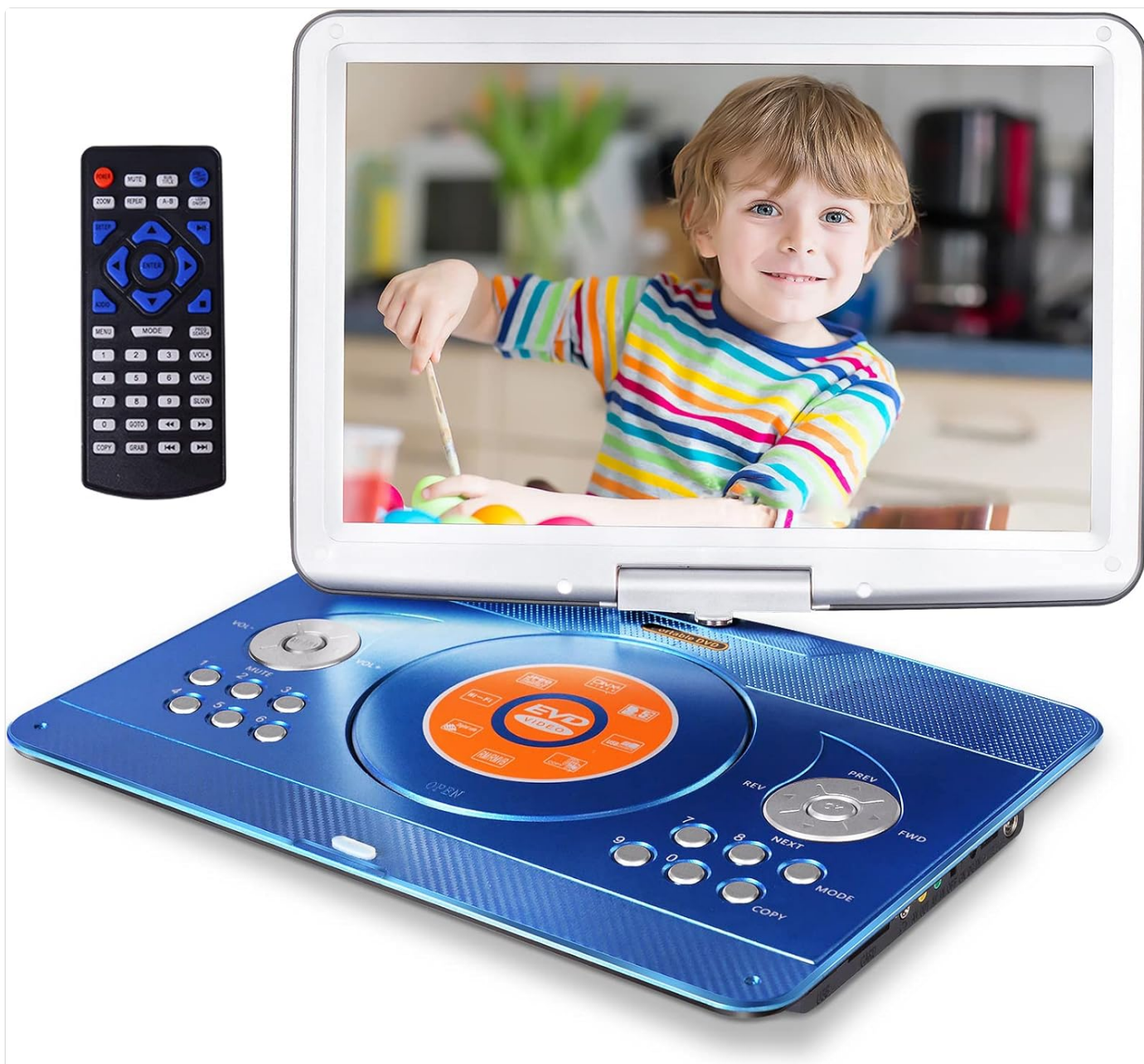
Image: The Jekero Portable DVD Player, showcasing its main unit with a large screen, alongside its remote control. The screen is displaying a vibrant image of a child.