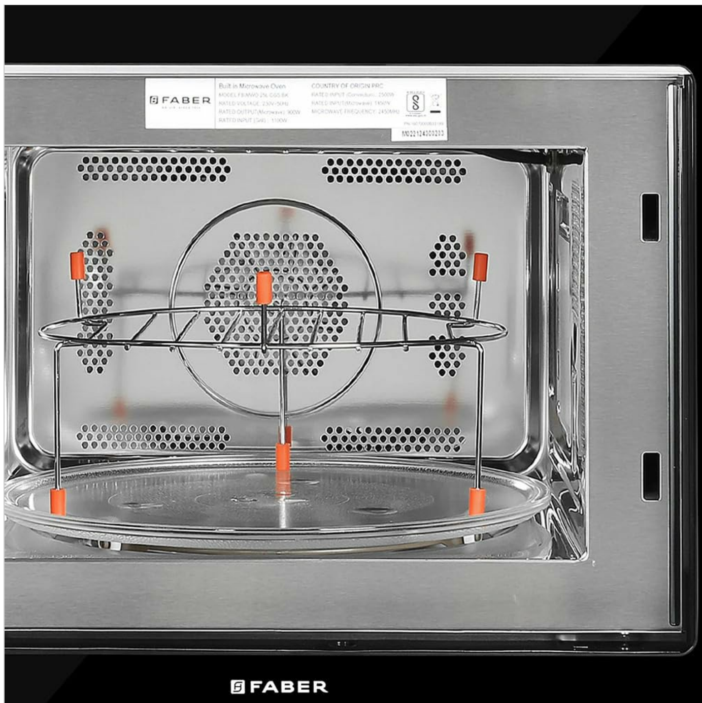
Figure 5.1: Oven interior with the grill rack in place, suitable for grilling functions.