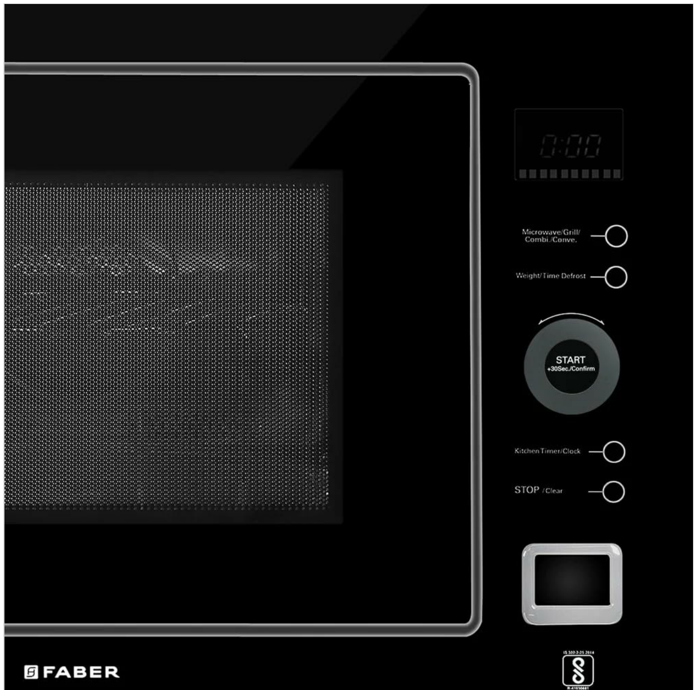
Figure 3.2: Detailed view of the control panel, showing the digital display and function buttons.

The control panel features a digital display and various buttons for selecting cooking modes, setting time, and initiating operations.