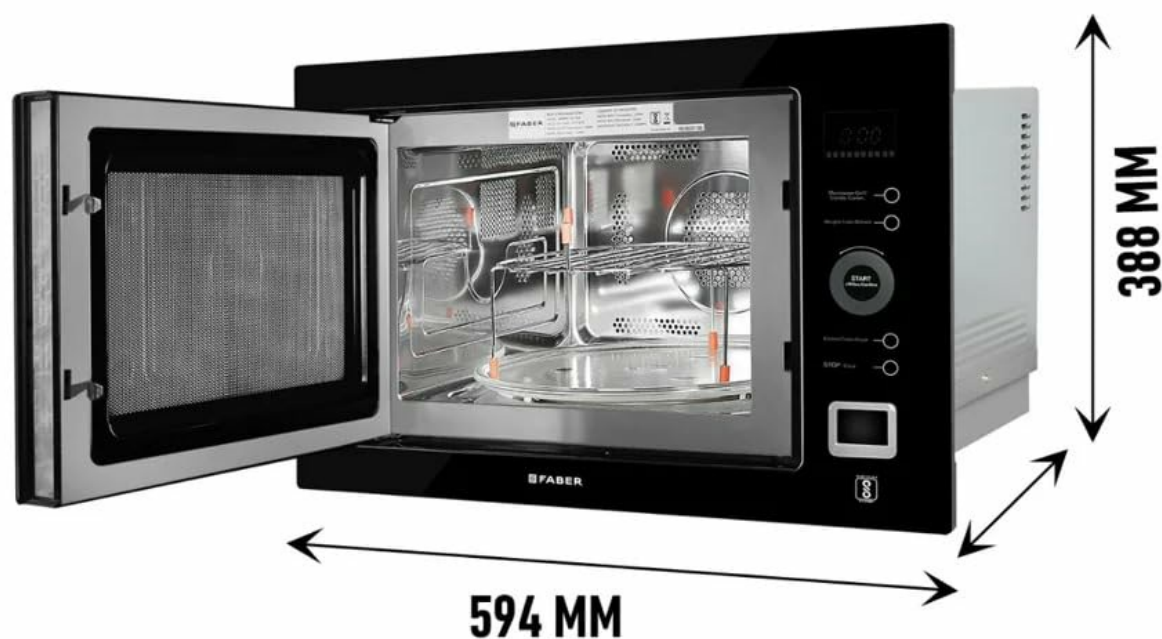
Figure 4.1: Oven dimensions (WxDxH: 594x470x388 mm) for built-in installation.