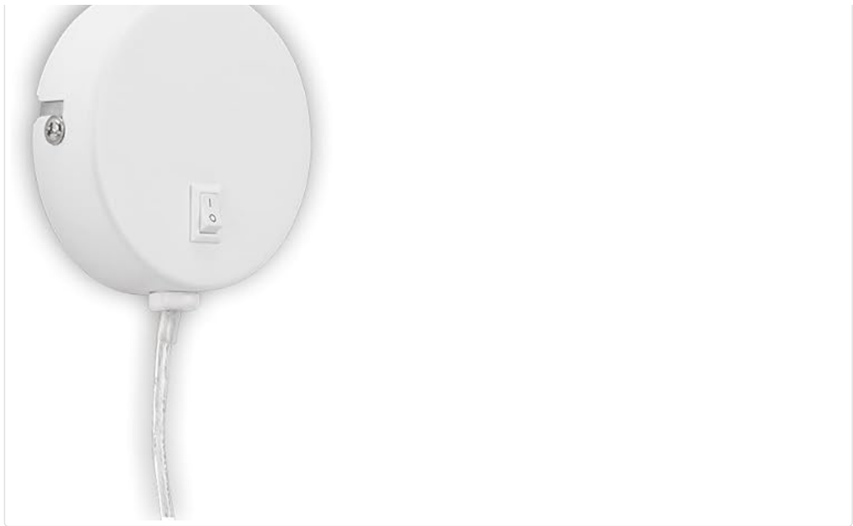
Figure 1: Front view of the Briloner LED Bedside Lamp with its flexible arm and base-mounted switch.