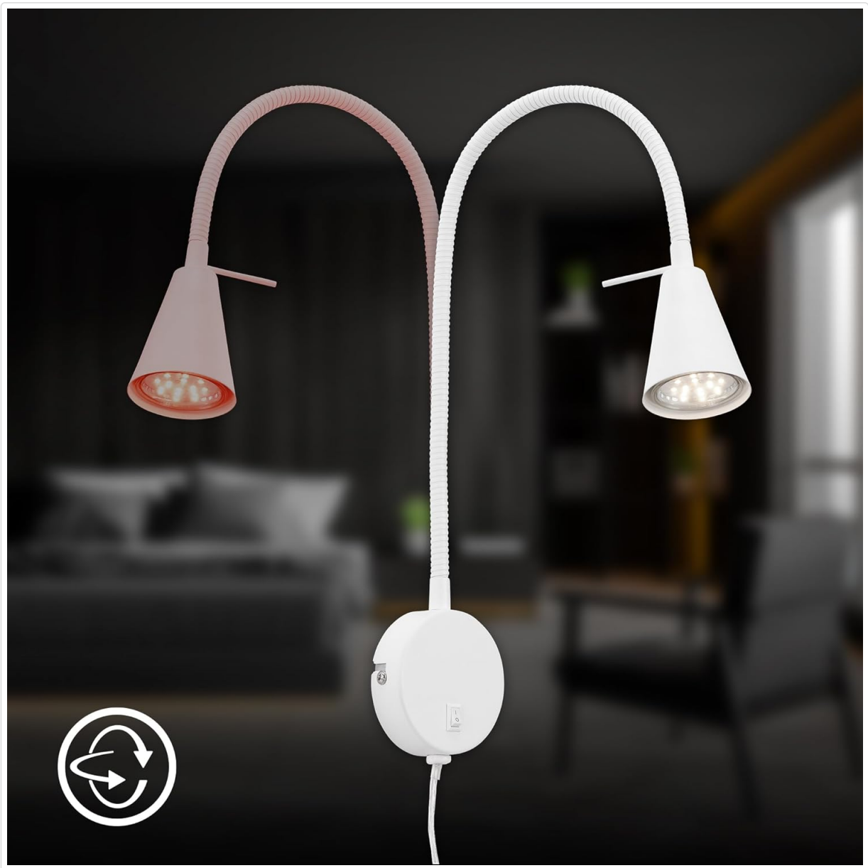
Figure 5: Two lamps illustrating the flexibility of the arm, allowing for various light positions.