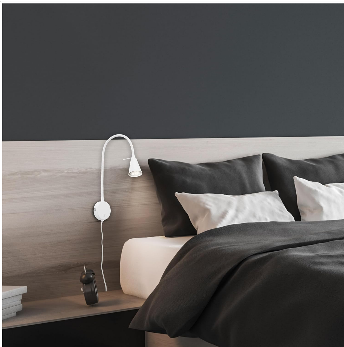
Figure 4: The lamp installed on a wall above a bed, demonstrating a typical usage scenario.