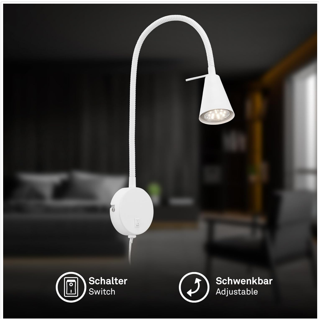
Figure 2: Close-up showing the on/off switch on the lamp's base and illustrating the adjustable nature of the flexible arm.